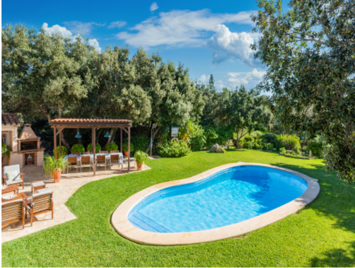
Fantastic garden and pool area