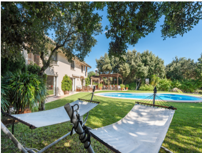
Garden with chill-out area