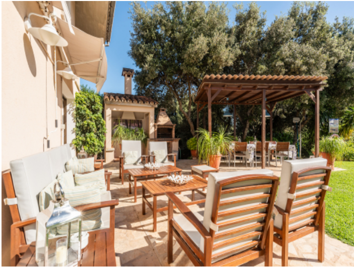
Sunny terrace with BBQ area