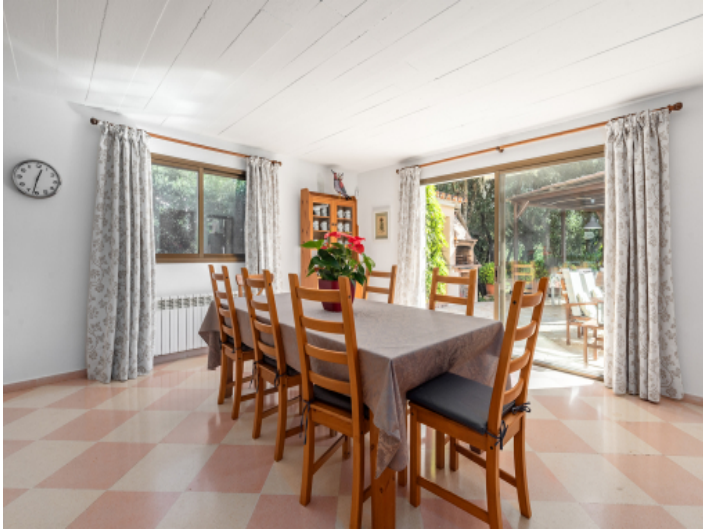
Large dining area