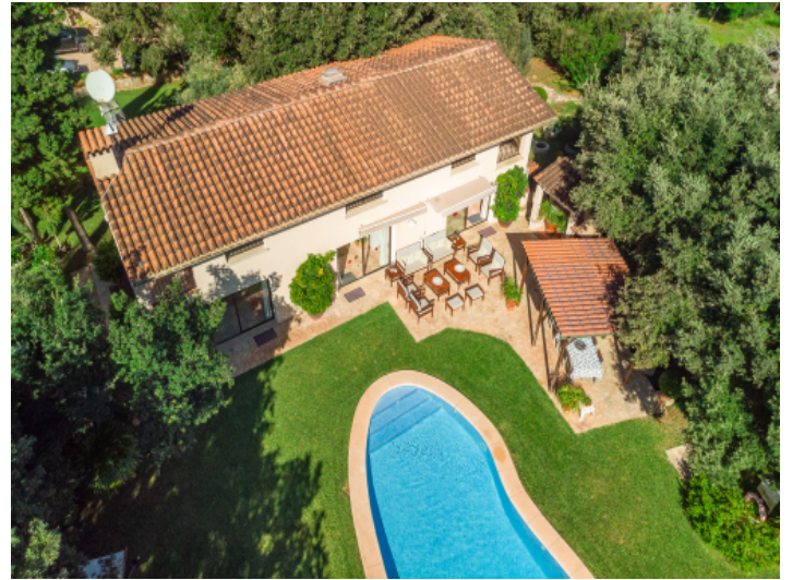
Bird's-eye-views to the finca