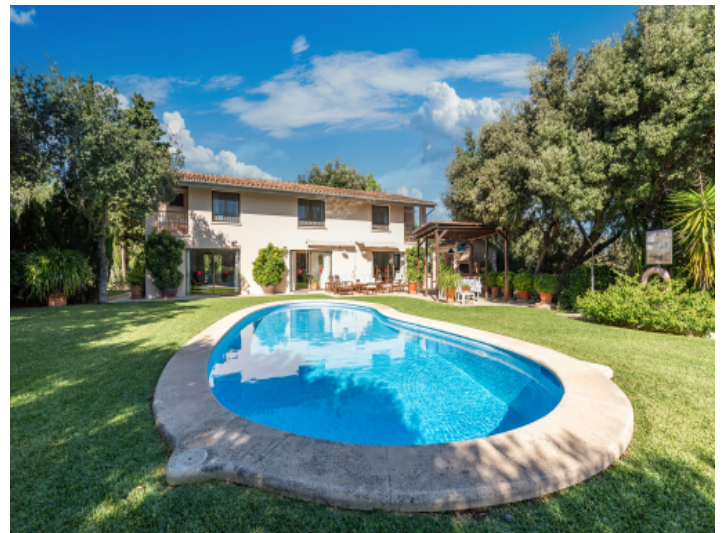
Exterior view and pool