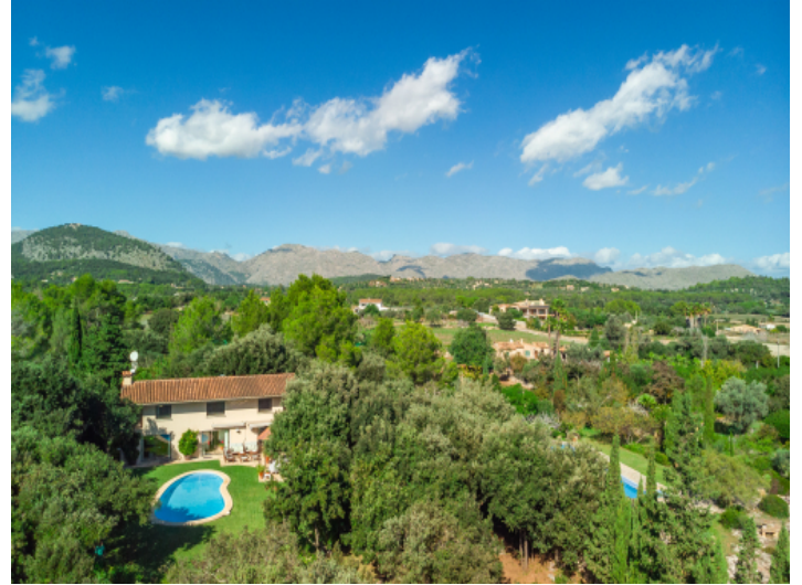
The finca is surrounded by trees