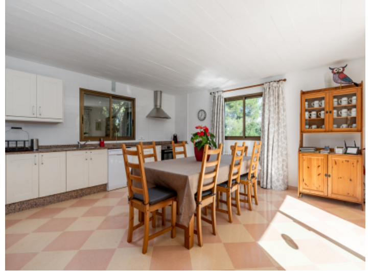
Elegant dining area and kitchen