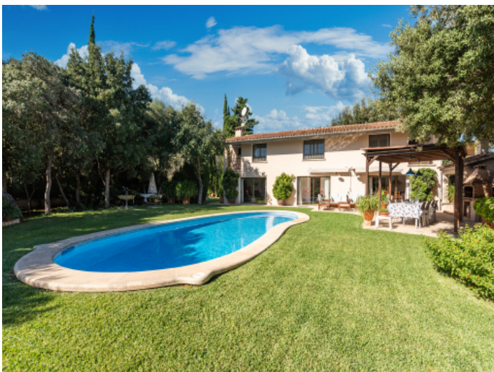
Exterior view and pool