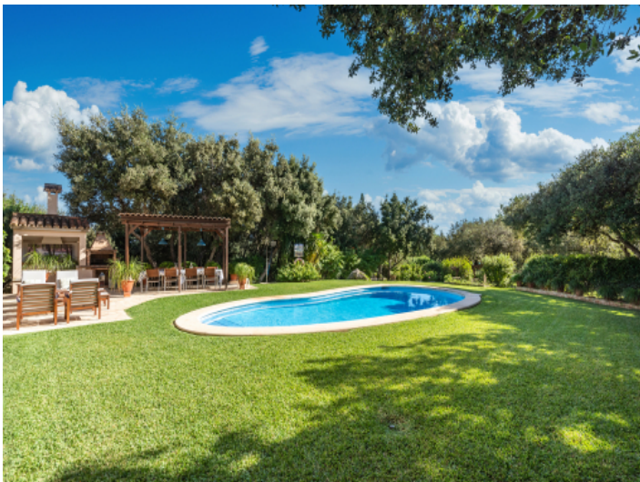
Well-tended outdoor area