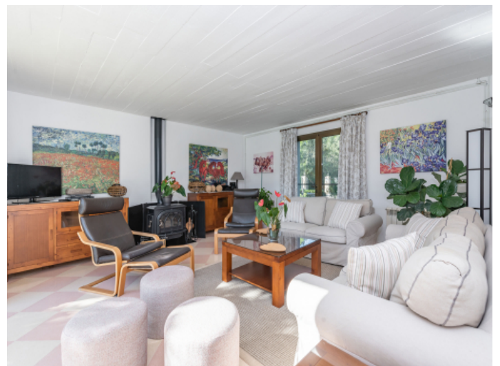
Light-flooded living area