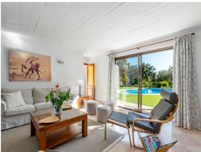
Living area with direct garden access