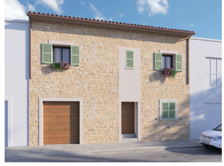
font view of the house

PORTA MALLORQUINA • C./ COLOM 20 2°, 07001 PALMA, SPAIN TEL.: +34 971 698 242 • INFO@PORTAMALLORQUINA.COM • WWW.PORTAMALLORQUINA.COM