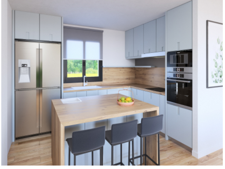
Modern kitchen with cooking island