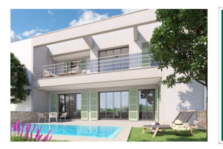
Cala Llombards search for property MAL-118942