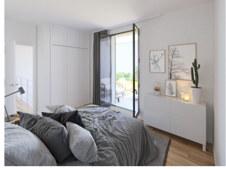
Bright double bedroom