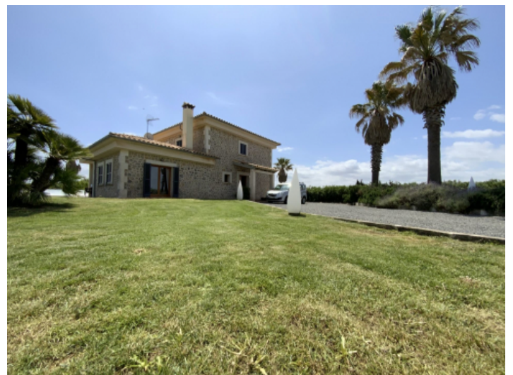
Finca and garden