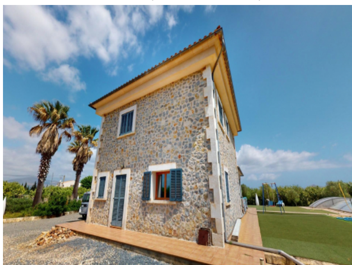
Exterior view of the finca