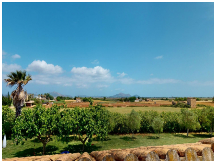
Wonderful views over the landscape