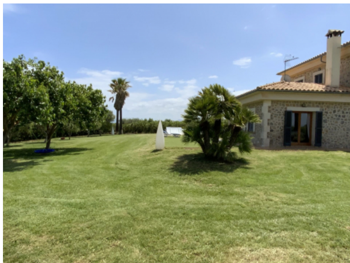
Finca and garden