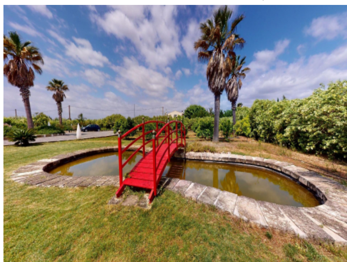
Natural pond in the garden