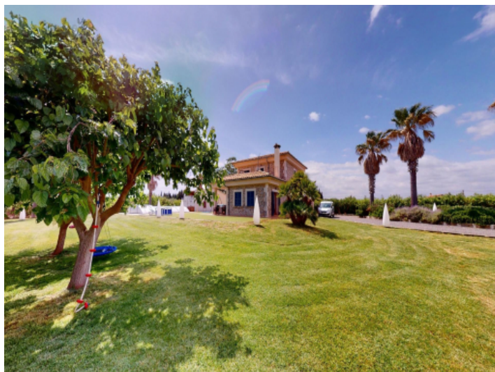
Natural-stone finca with pool and olive tree plantation near