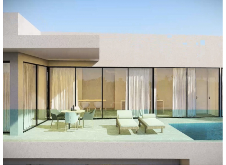
View of the pool