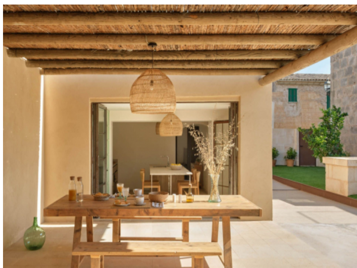
Lovely outdoor dining area