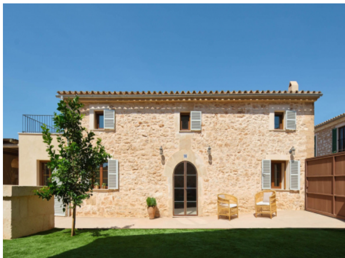
Exterior view of the house