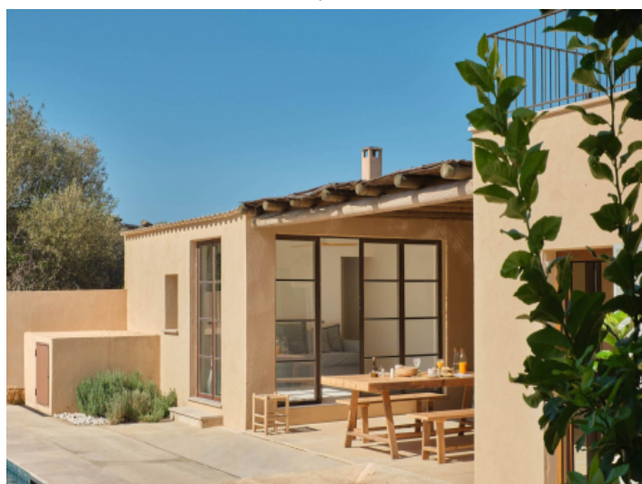
Terrace with access to the living area