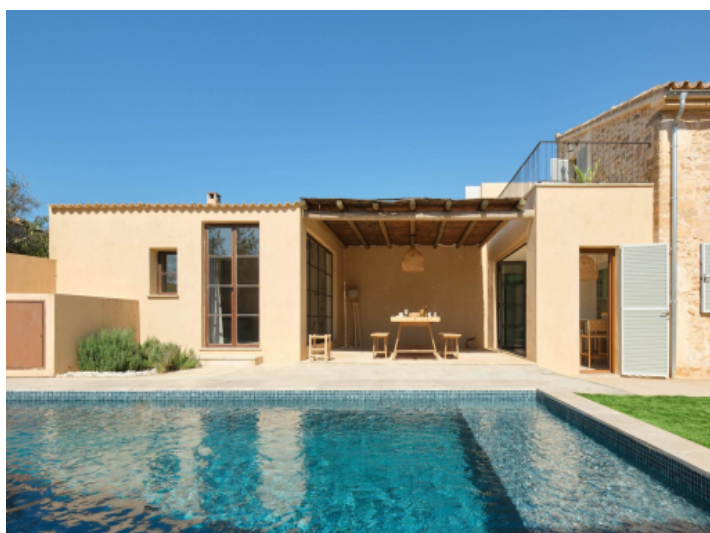
Pool and covered terrace