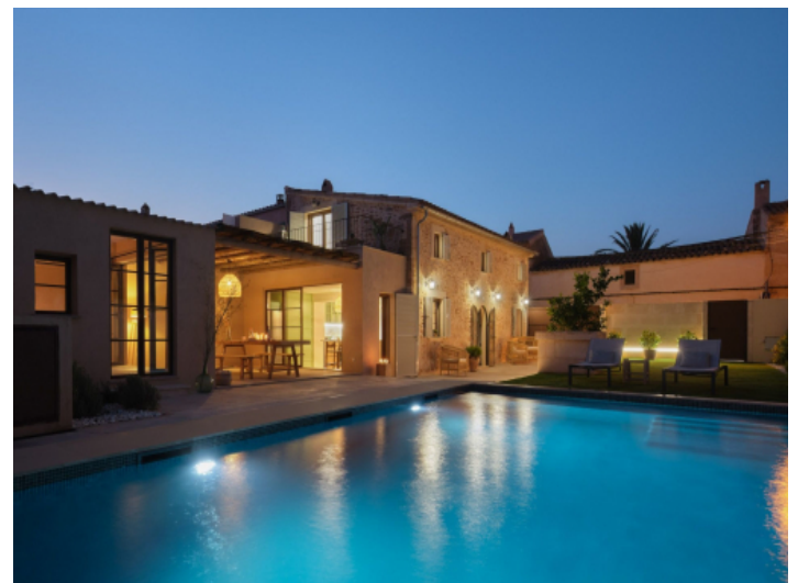
Pool by night