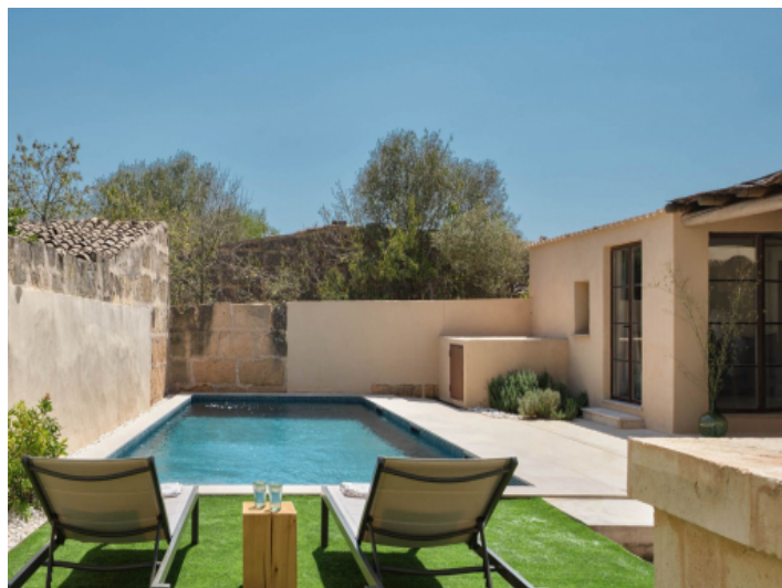
Private pool area