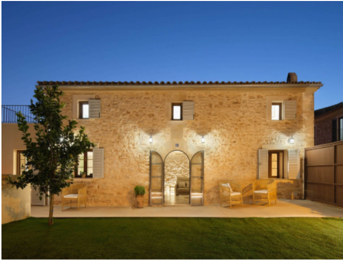
Exterior view by night