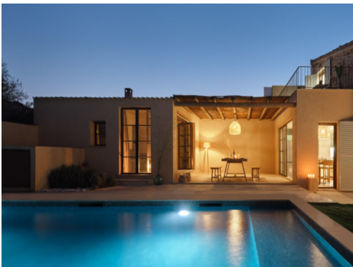
Pool by night