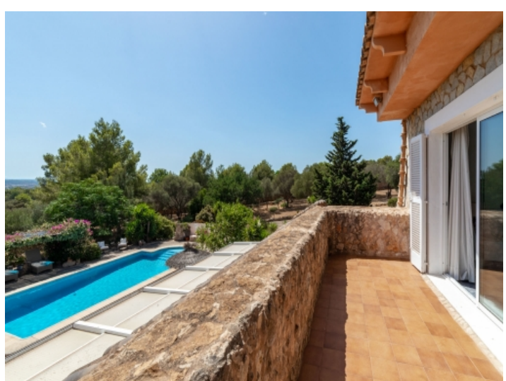
Upper balcony with pool views