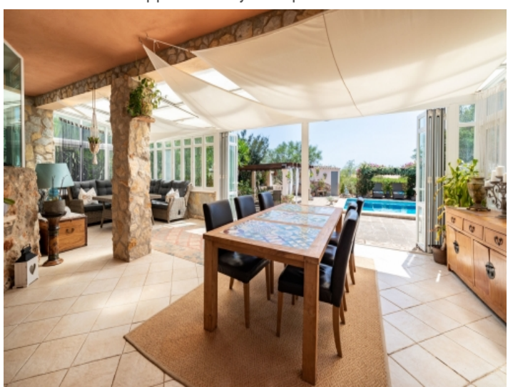
Large wintergarden with terrace access