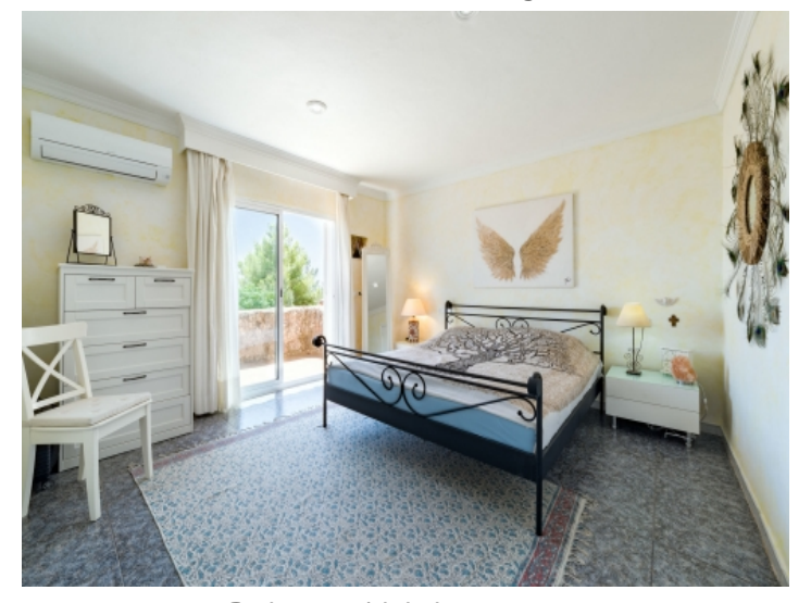
Bedroom with balcony access