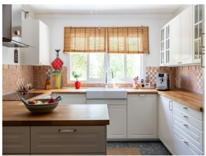
Open, fully equipped kitchen