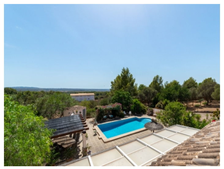
Wonderful sweeping views