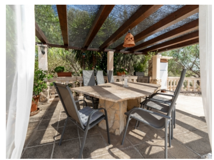
Terrace with covered dining area