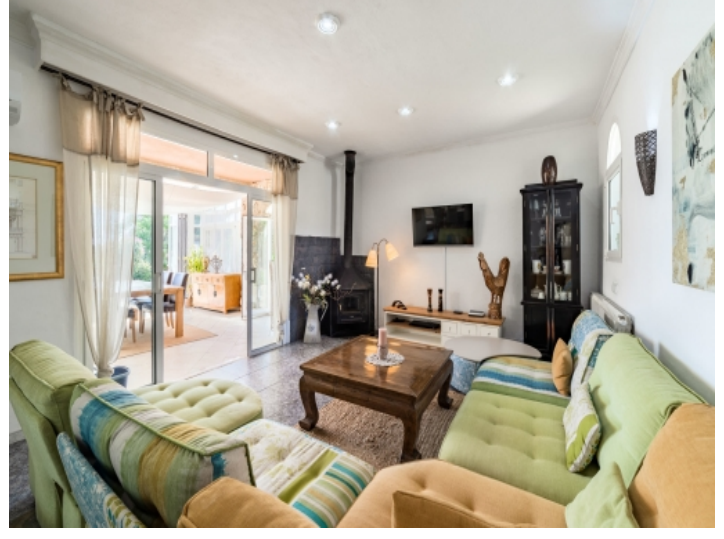
Adjoining living area with fireplace