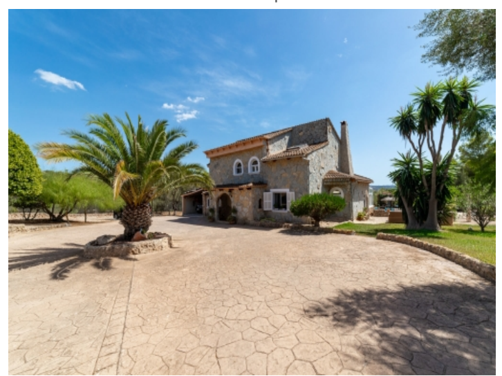
Front view of the finca