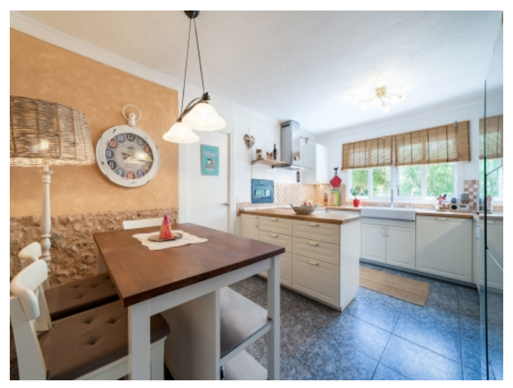
Modern kitchen and dining area