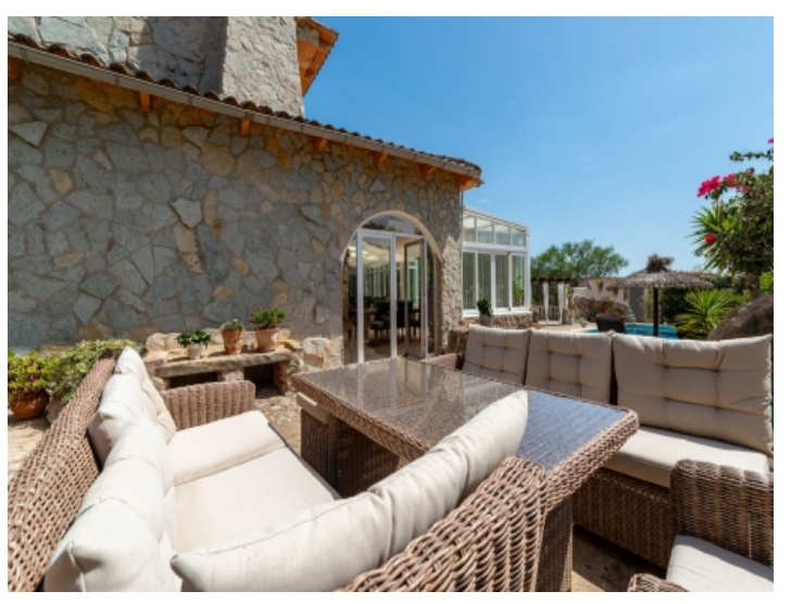
Further lounge terrace