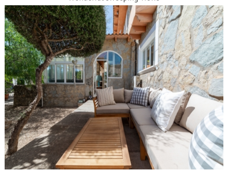
Lovely lounge terrace