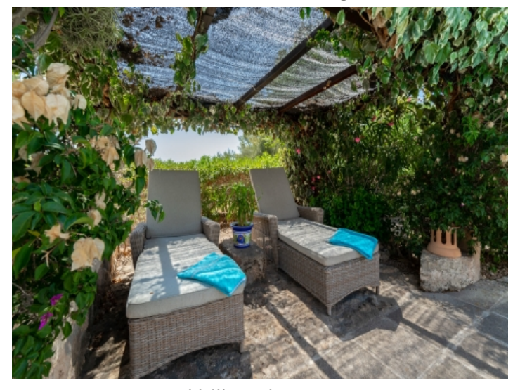
Idyllic pool terrace