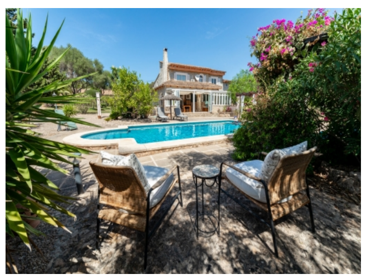
Mediterranean pool area