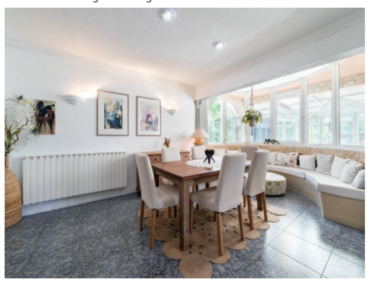
Lightflooded dining area