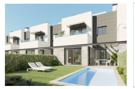
Playa de Palma search for property MAL-118674