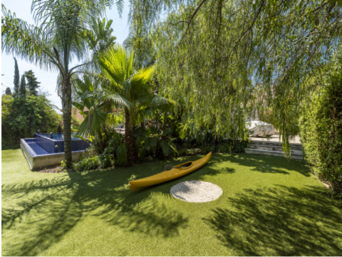
Garden and pool