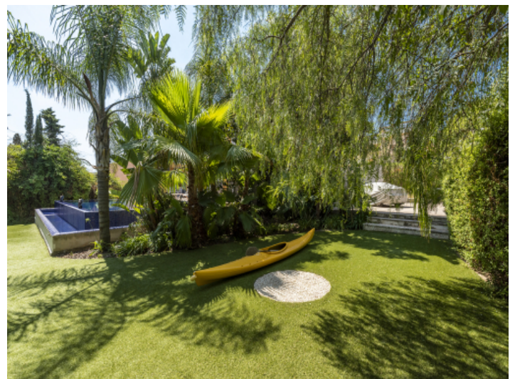
Garden and pool