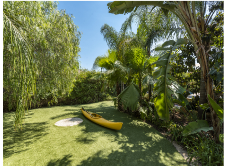
Large garden area