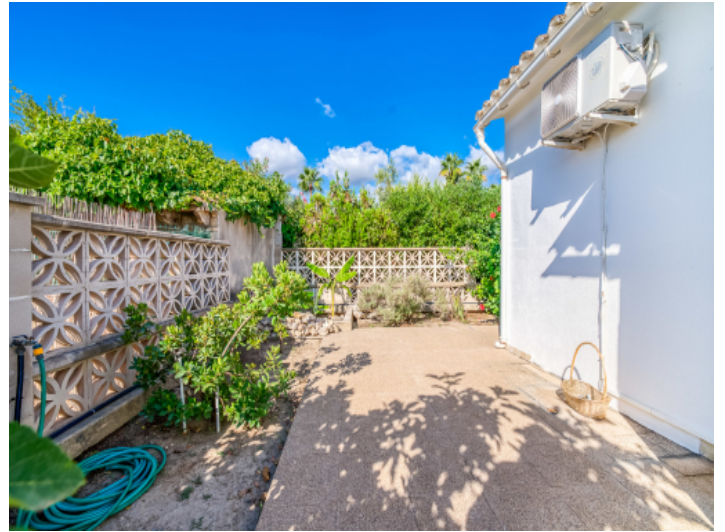
Terrace and small garden