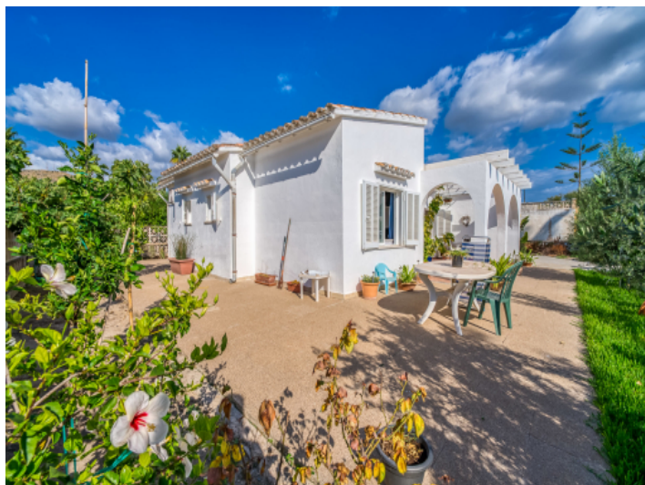
Large terrace surrounds the house