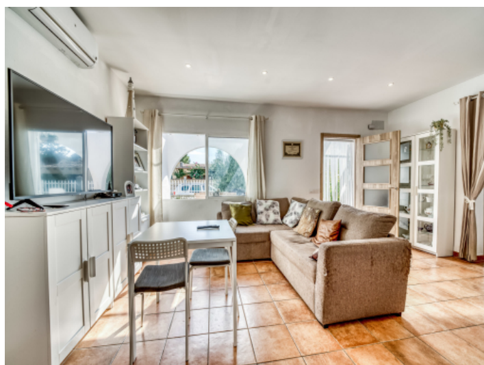
Entrance and living area