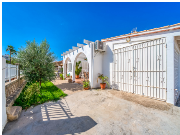
Access to the garage