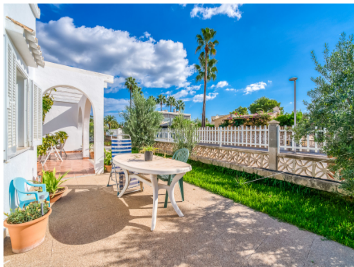
Beautiful front terrace