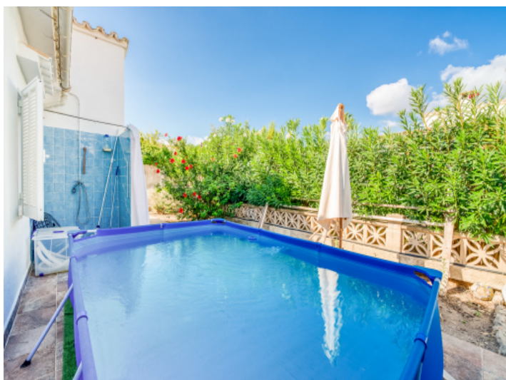
Terrace with pool and outdoor shower