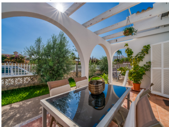
Front terrace with dining area