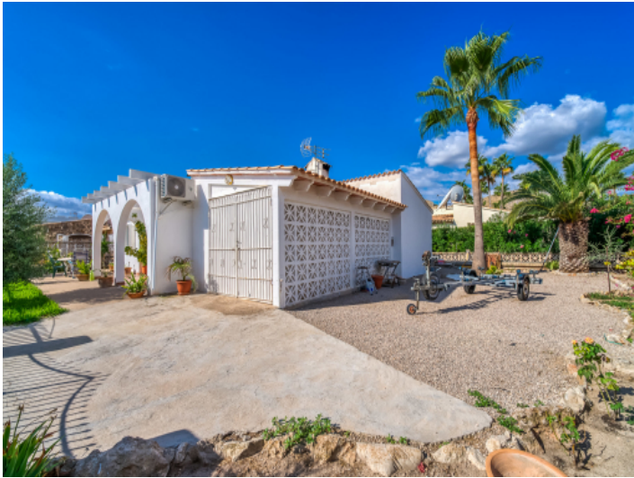
Spacious outdoor area