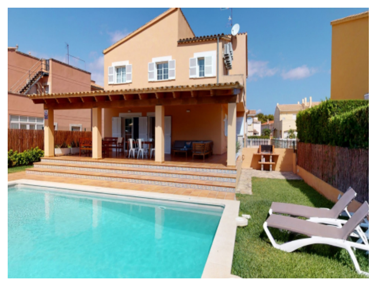
Upper floor Pool