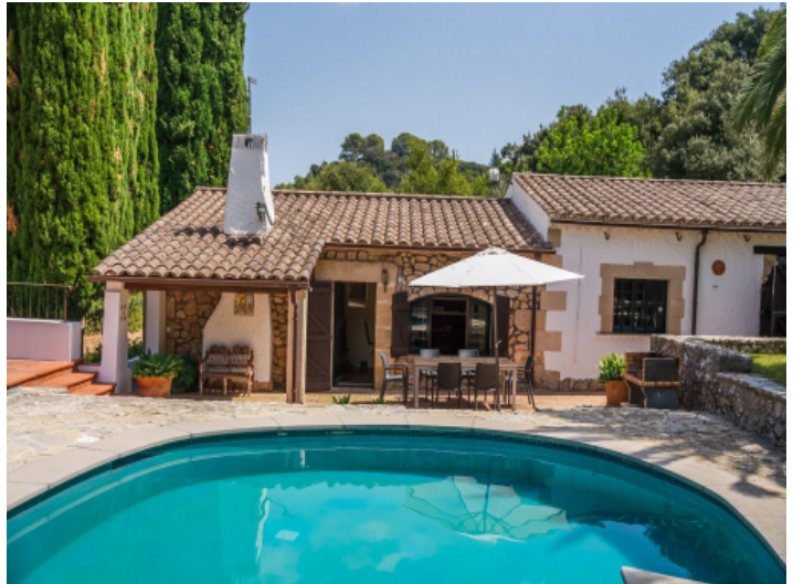
View of the finca with pool