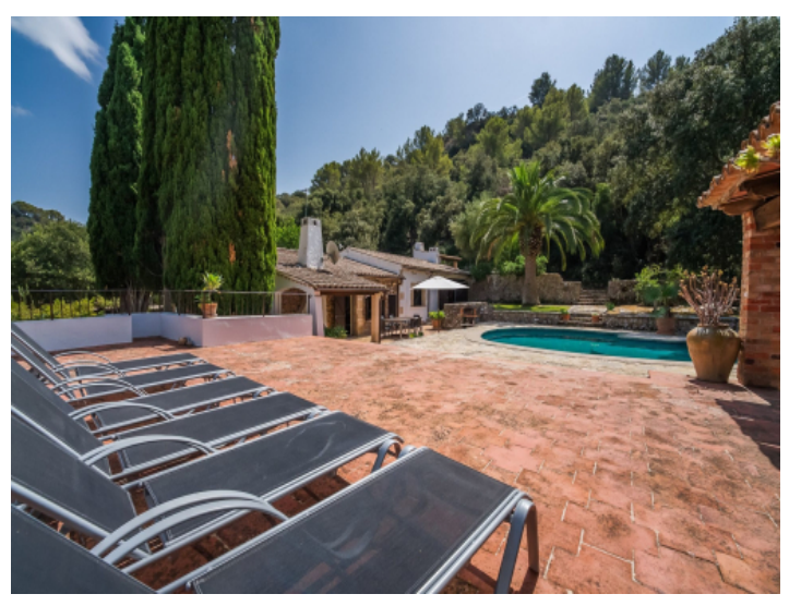
Large pool area with sun loungers