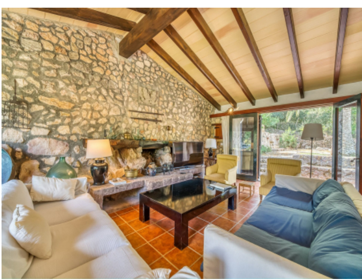
Living area with access to a terrace