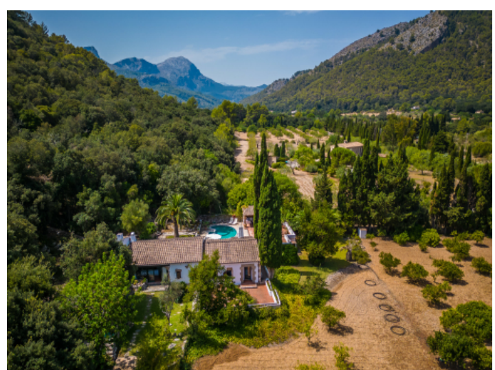
Bird's eye view