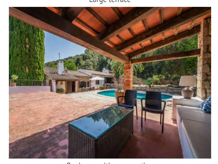
Pool area with cozy seating