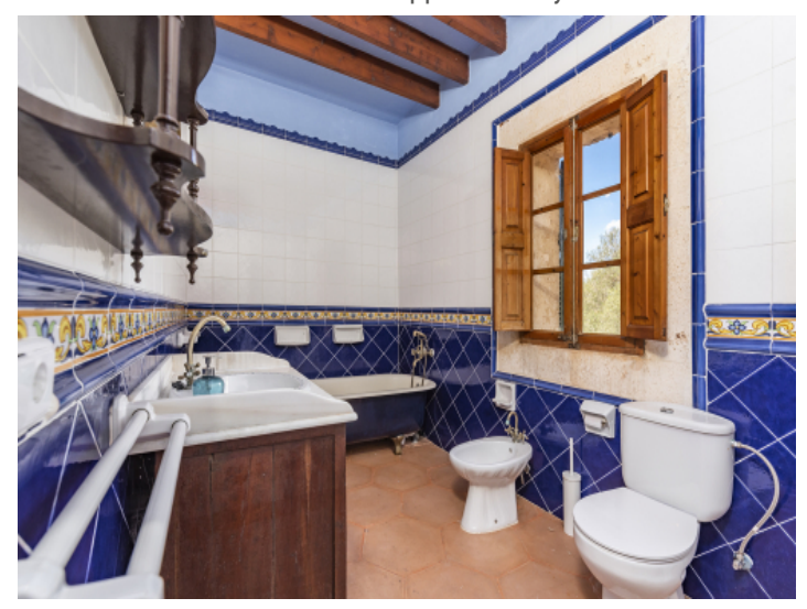
One of the 4 bathrooms