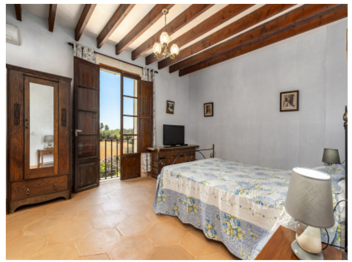
One of the 5 bedrooms