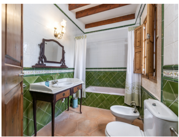
One of the 4 bathrooms