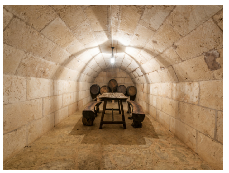
The wine cellar