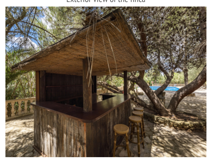
Rustic pool bar