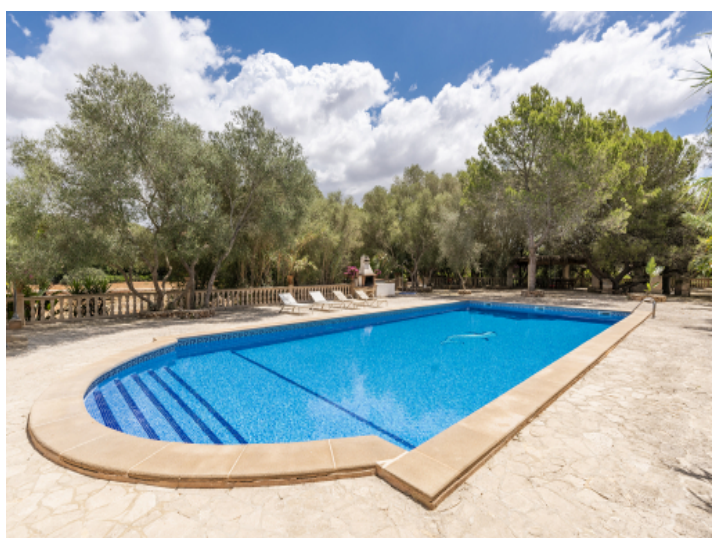
Pool with barbecue