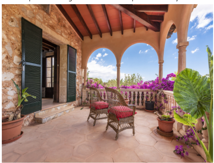
Spacious covered terrace