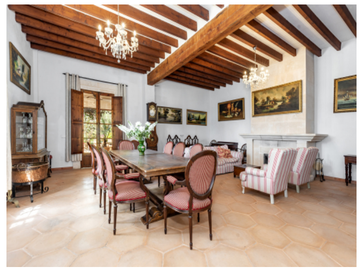
Living and dining room