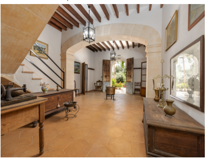
Spacious entrance area