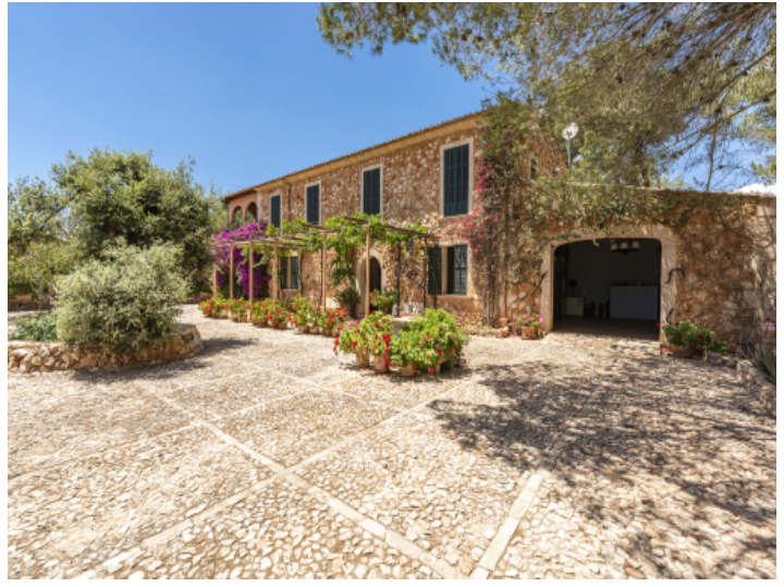
Stone-covered country house