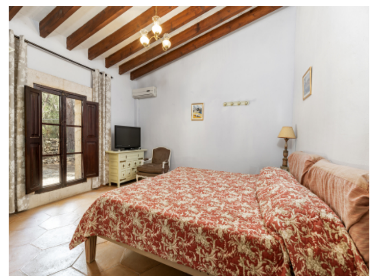
One of the 5 bedrooms