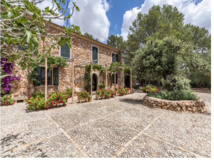
Mediterranean country property in Porreres