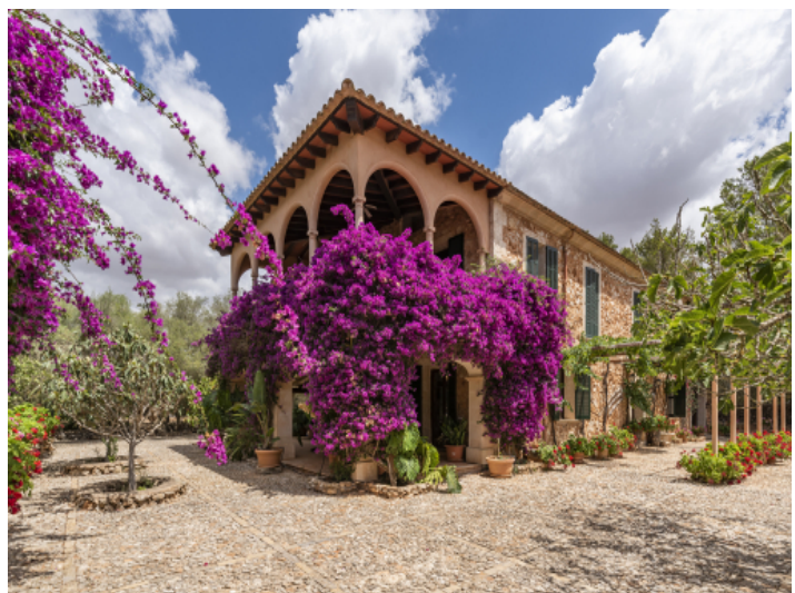
Splendid bougainvillea covers a part of the façade