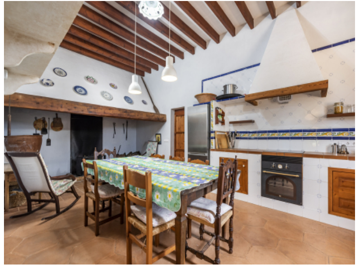
Kitchen with breakfast area