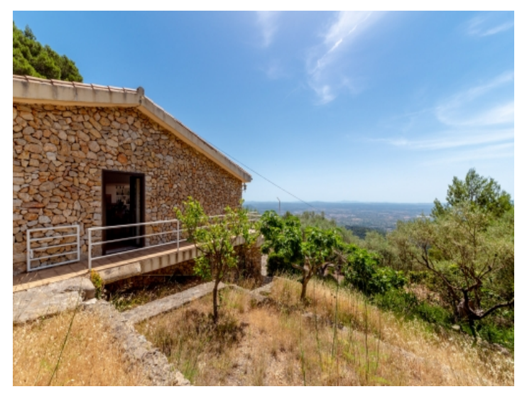
Side view of the finca