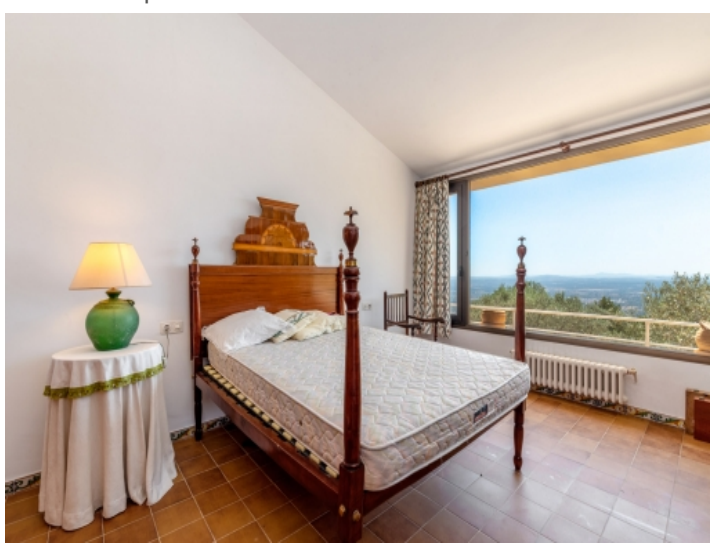
Cosy bedroom with outstanding views