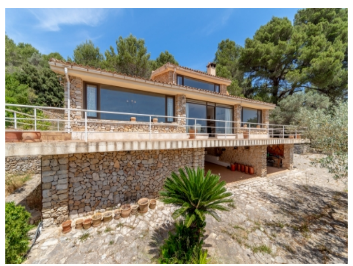
Beautiful natural stone finca with amazing views in Biniarroy