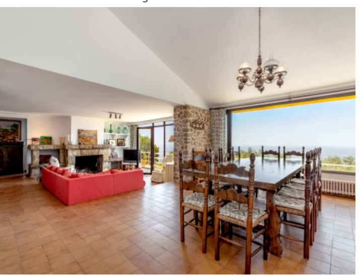
Open living- and dining area with panoramic windows