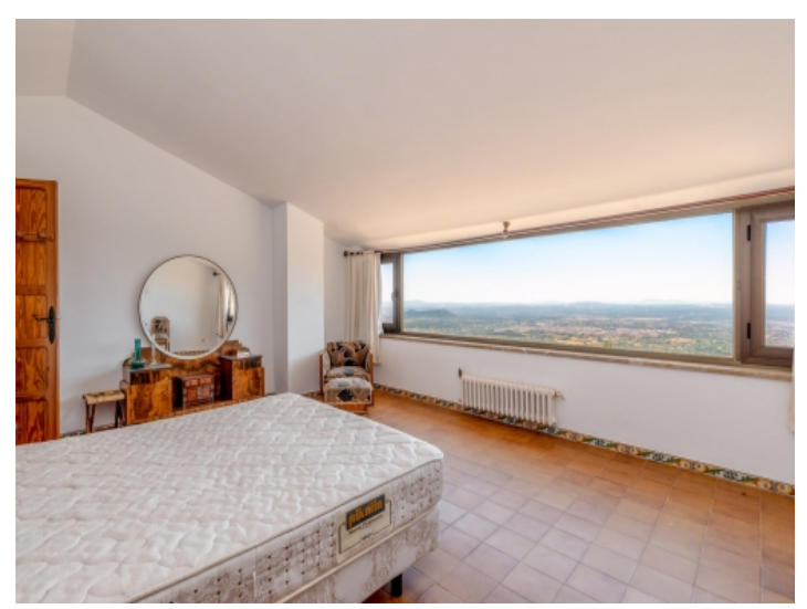
Spectacular views in the master bedroom