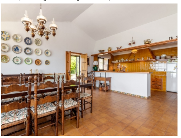
Mallorcan dining area