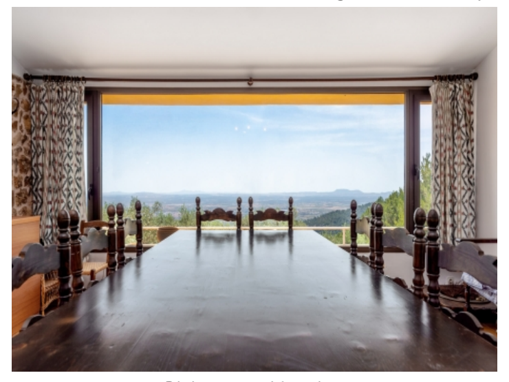
Dining area with a view