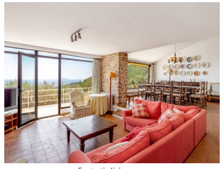
Fantastic living area