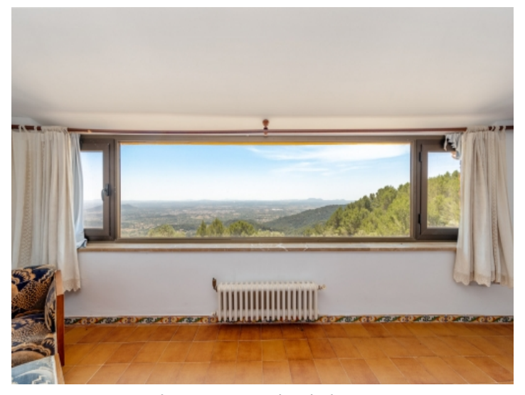
Large panoramic windows