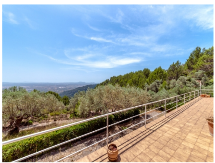
Spacious terraces surrounding the property