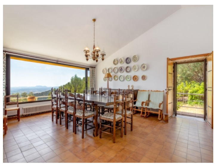
Dining area with a view