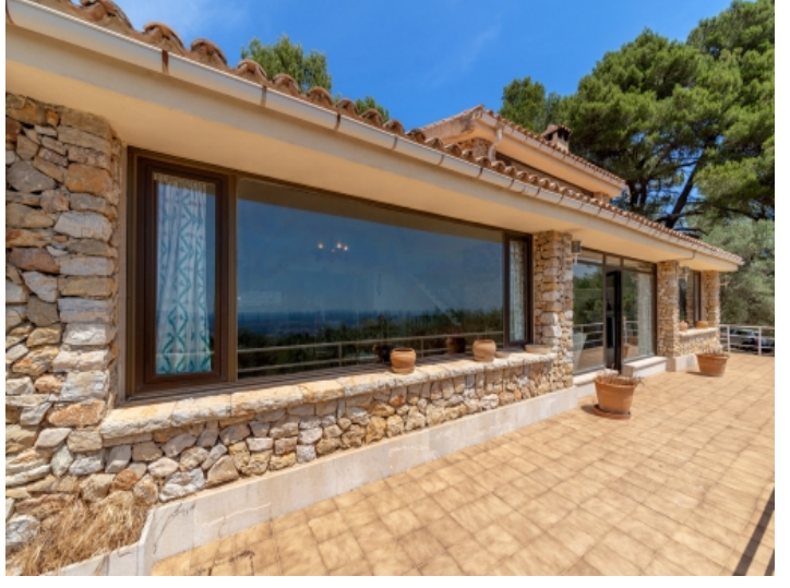
Spacious terraces surrounding the property