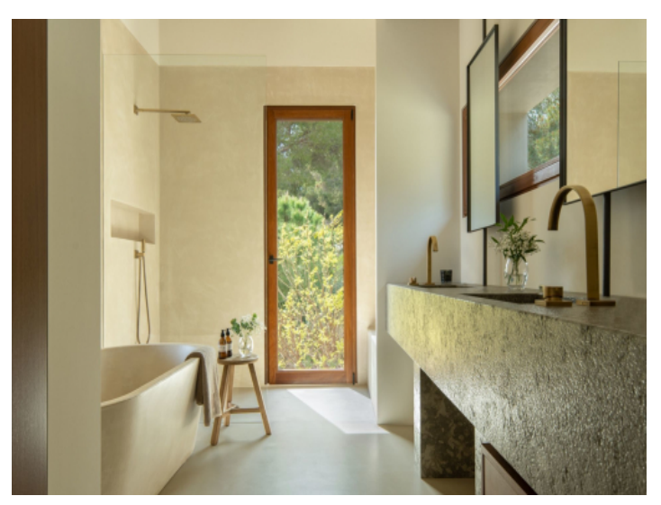
One of 4 bathrooms