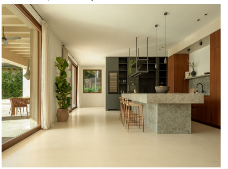
Luxurious kitchen with island