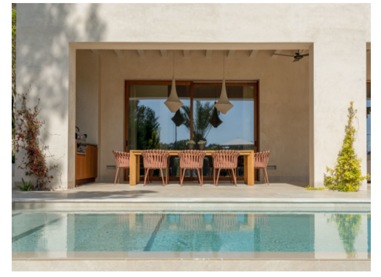
Fantastic pool area