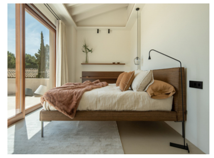
One of 4 bedrooms