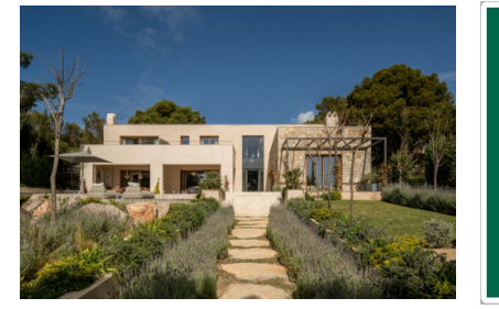
Santa Ponsa search for property MAL-118436