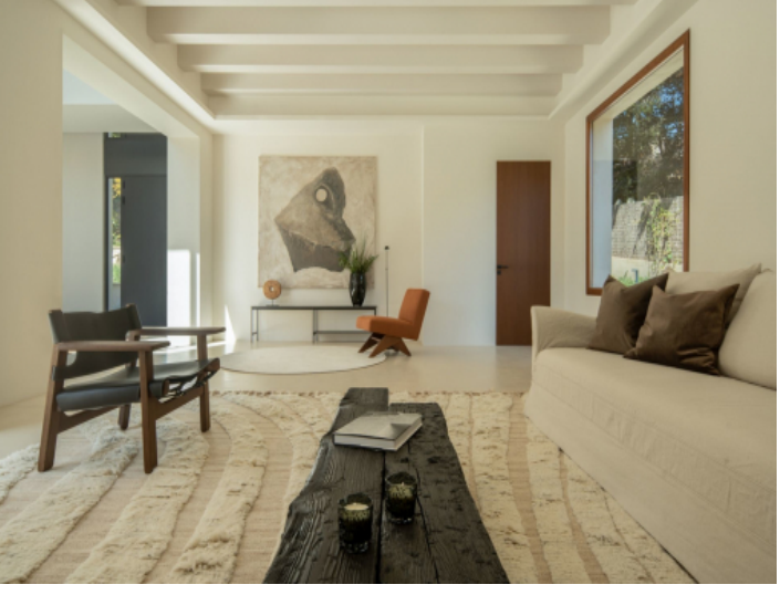
Alternative view of the living area