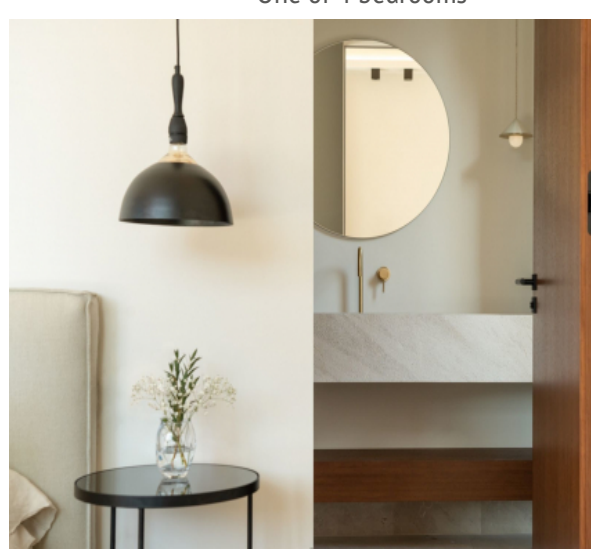
One of 4 bathrooms