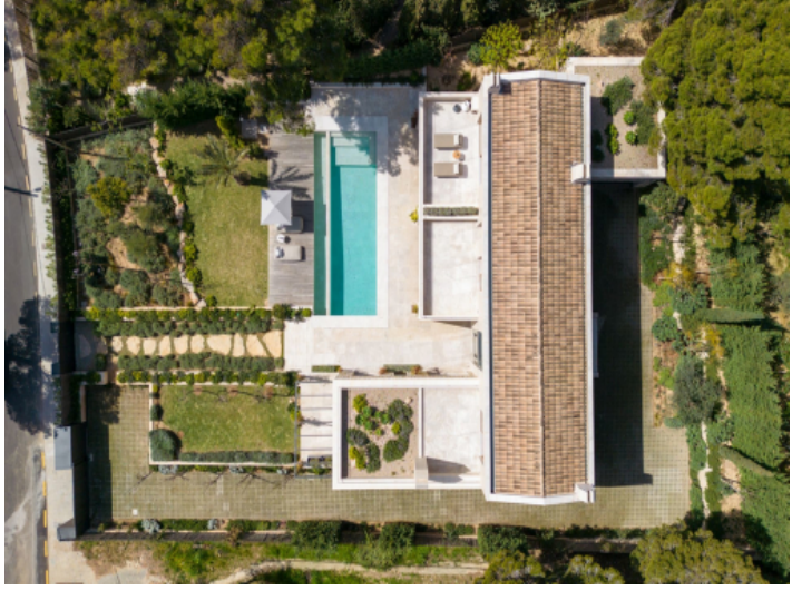
View from above