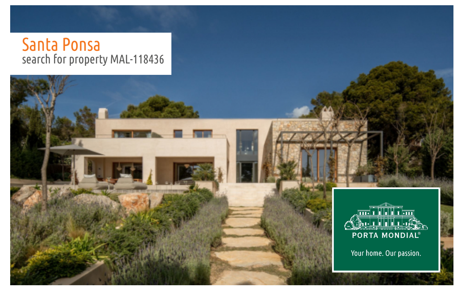
Beautiful family-villa near the Club Nautico of Santa Ponsa