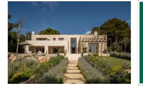
Santa Ponsa search for property MAL-118436