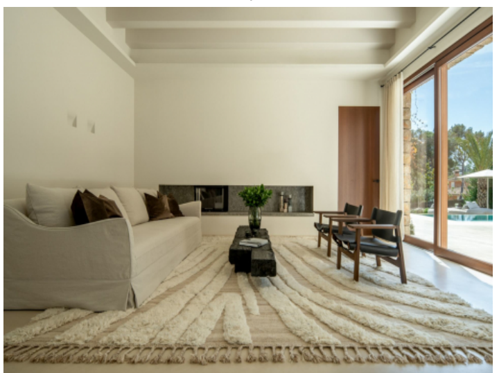
Spacious living area with terrace access