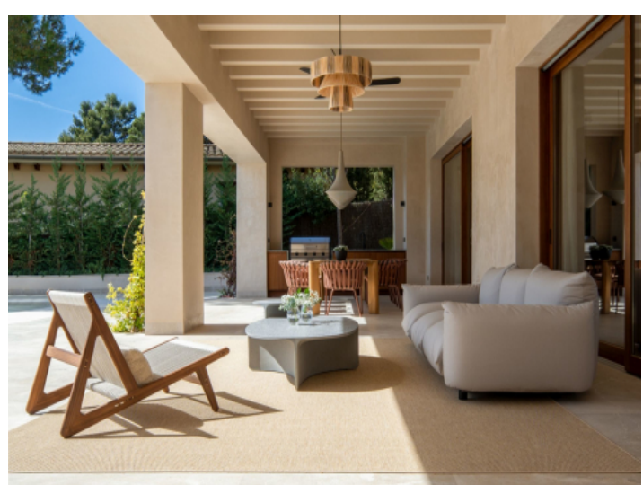
Covered terrace with lounge and dining area