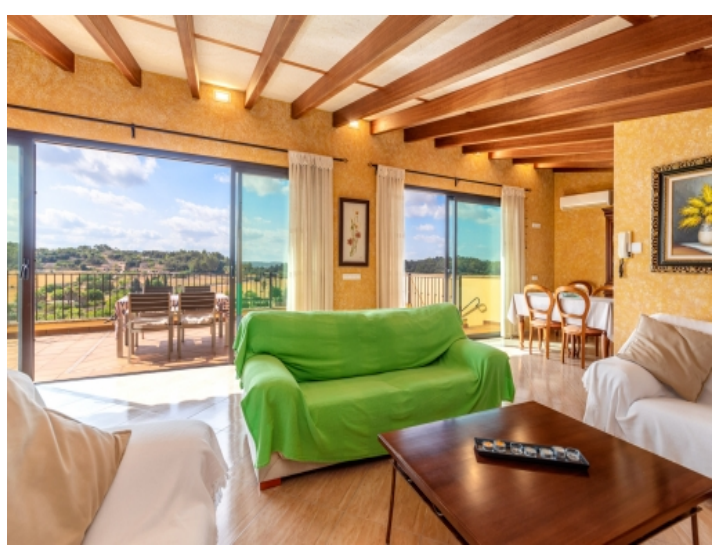
Spacious living area