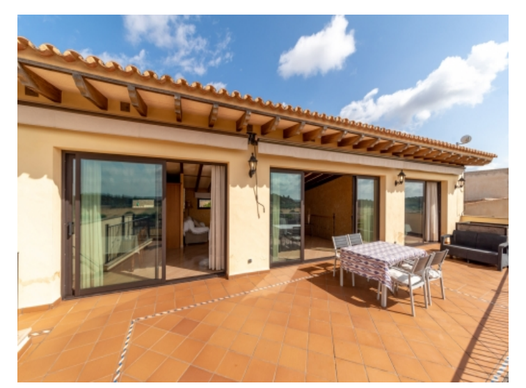
Large terrace with views