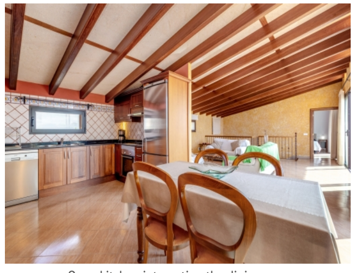
Open kitchen integrating the dining area