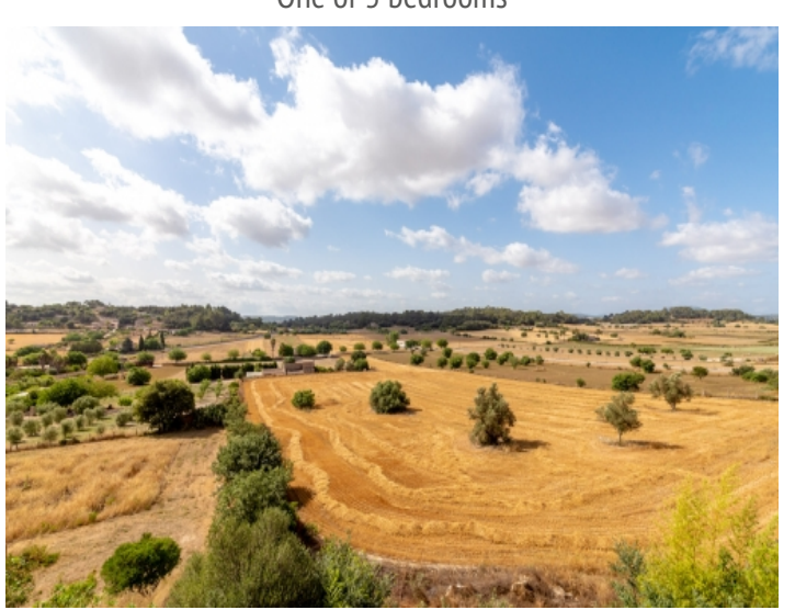
Views from the house