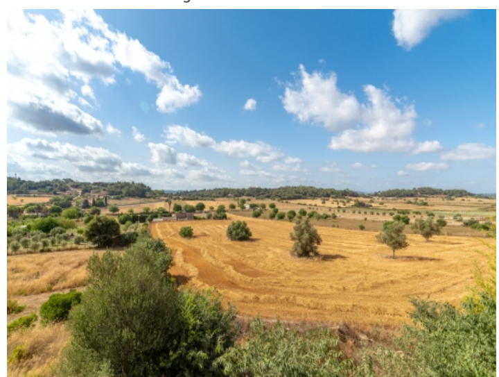
Views to the countryside