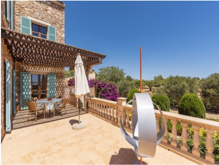
Alternative view of the kitchen