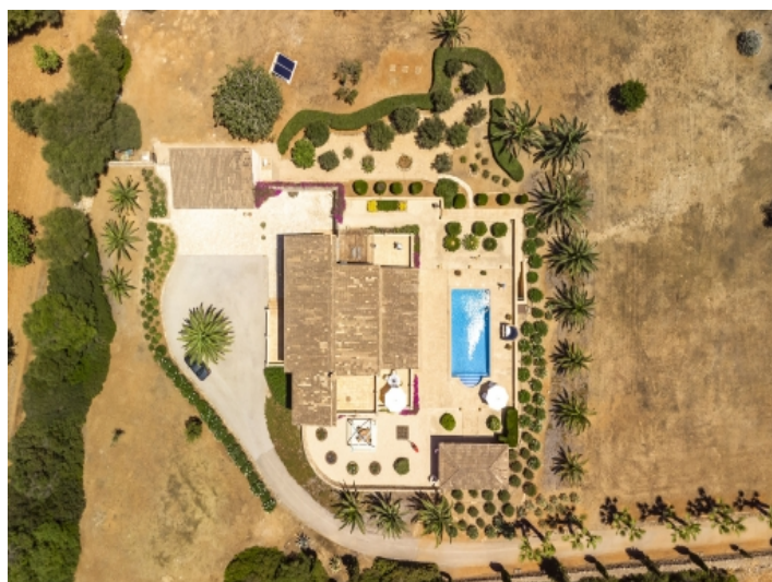
The finca from a birds-eye view