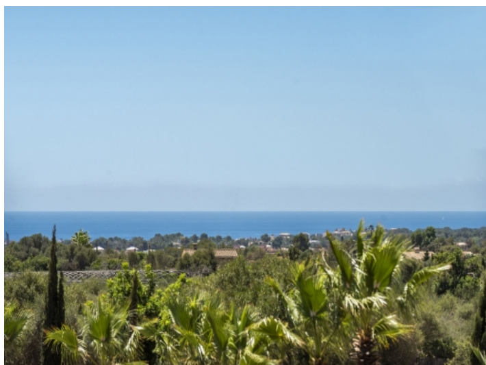
Close to the sea