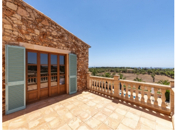
Sunny balcony with a view