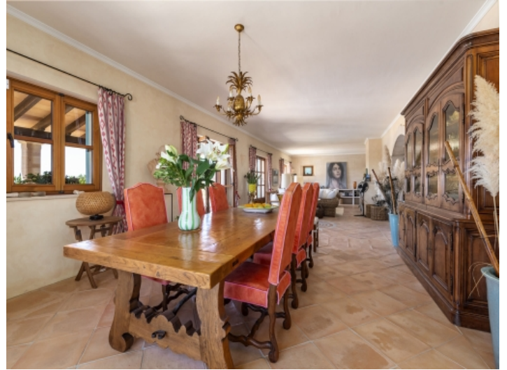
Open dining and living area