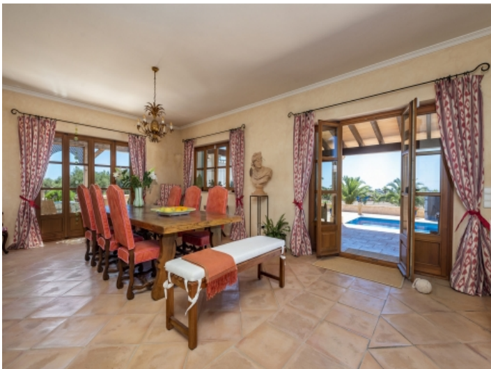
Access to the terrace