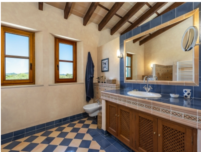
Bathroom with shower