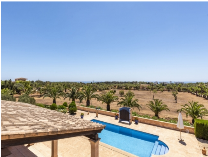
View to the pool and into the landscape