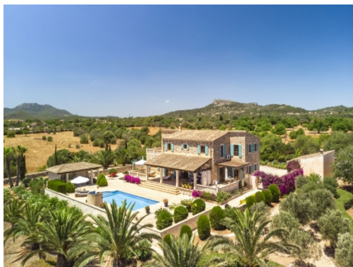
The finca property from a birds-eye view