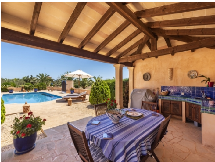
Covered barbecue area