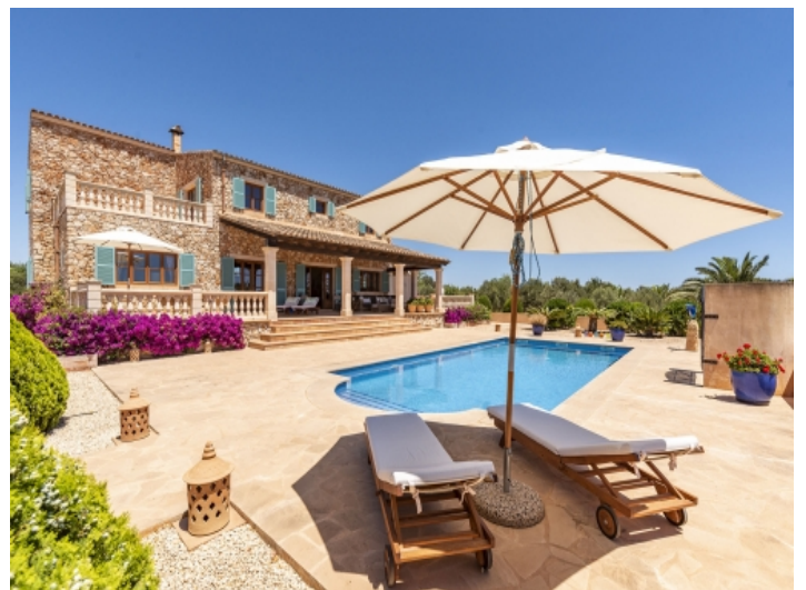
Exterior view of the finca