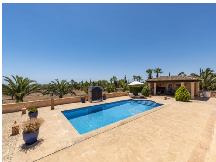
Splendid pool area with a view