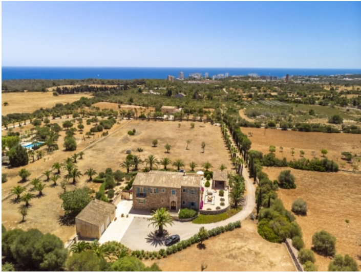
The finca from a birds-eye view