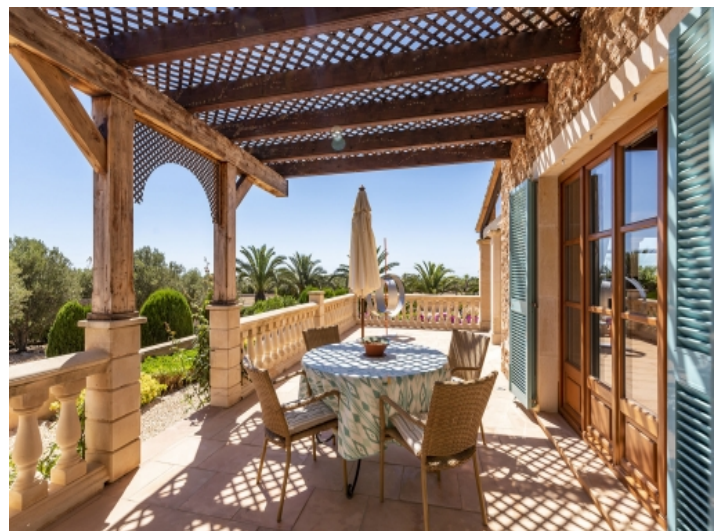
Inviting terrace of the kitchen