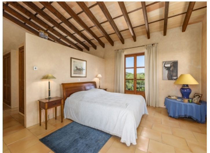
Master bedroom with bathroom en suite