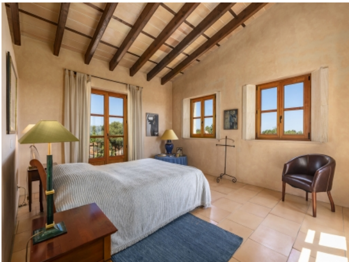
Master bedroom with bathroom en suite