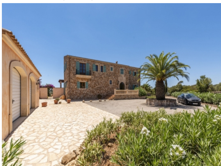
Exterior and entrance view with garage