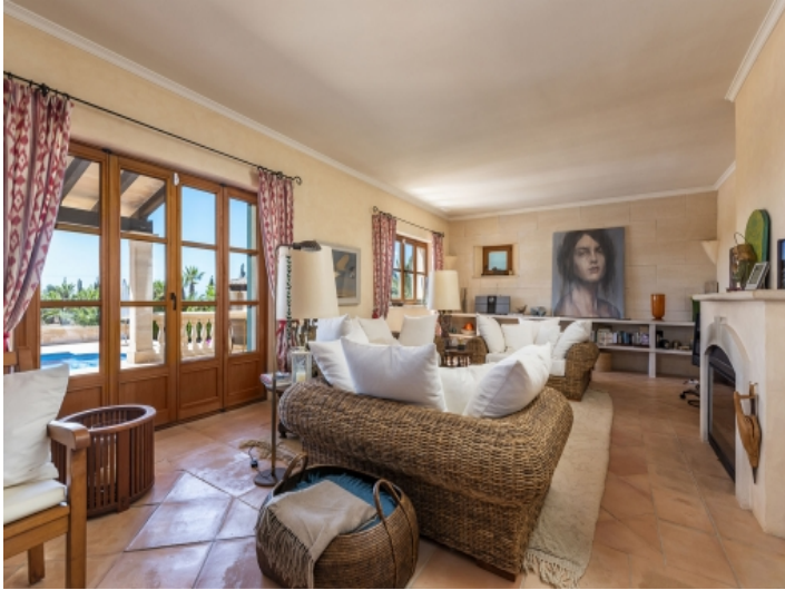
Cozy living area