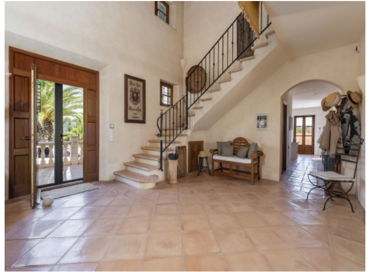
Impressive entrance area with high ceiling