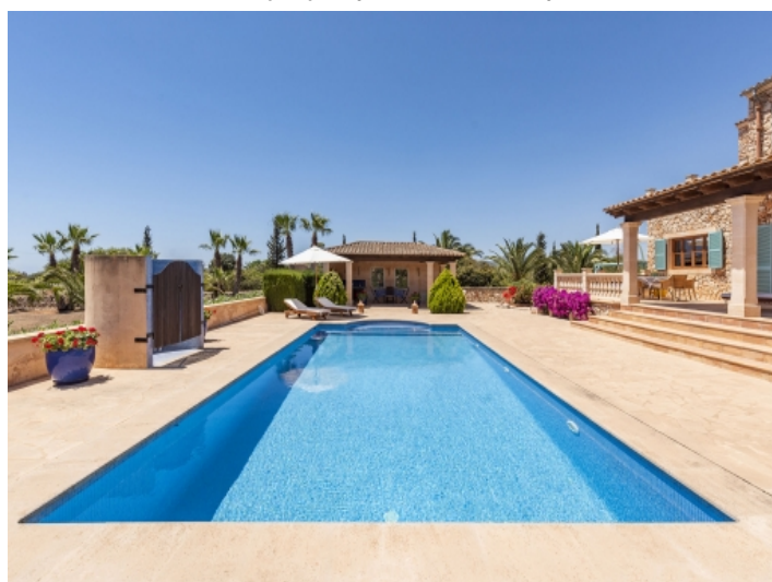
Inviting pool area of the finca