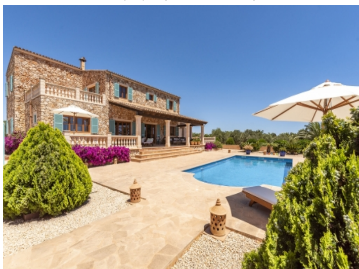
Exterior view and pool area