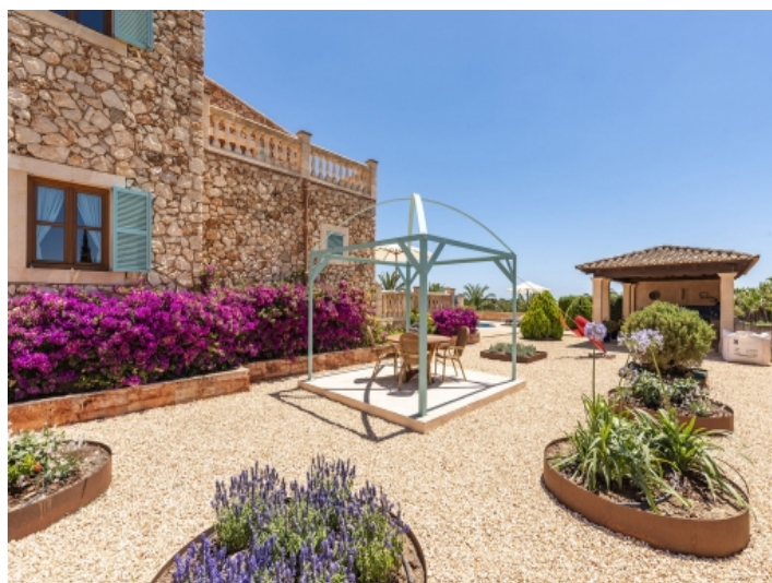
Side terrace with separate sitting area