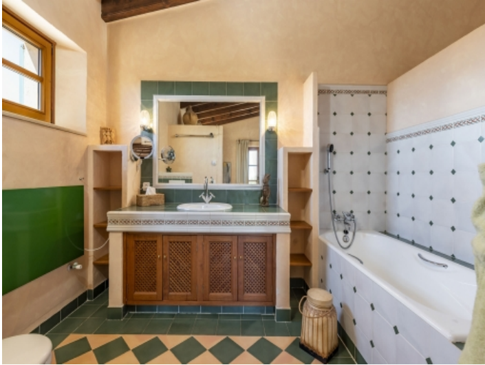
Bathroom with bath tub