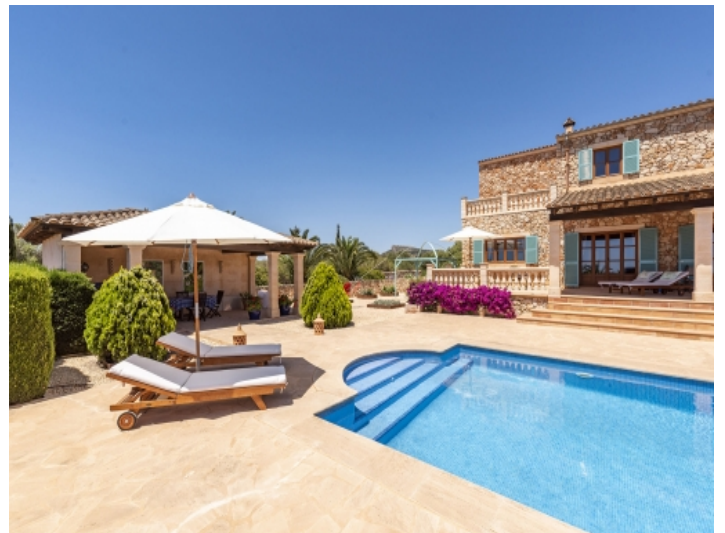
View to the barbecue area