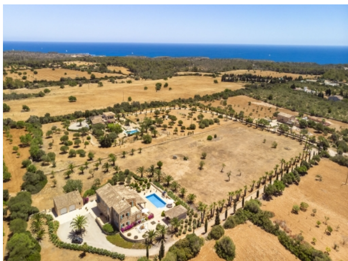
The finca property from a birds-eye view