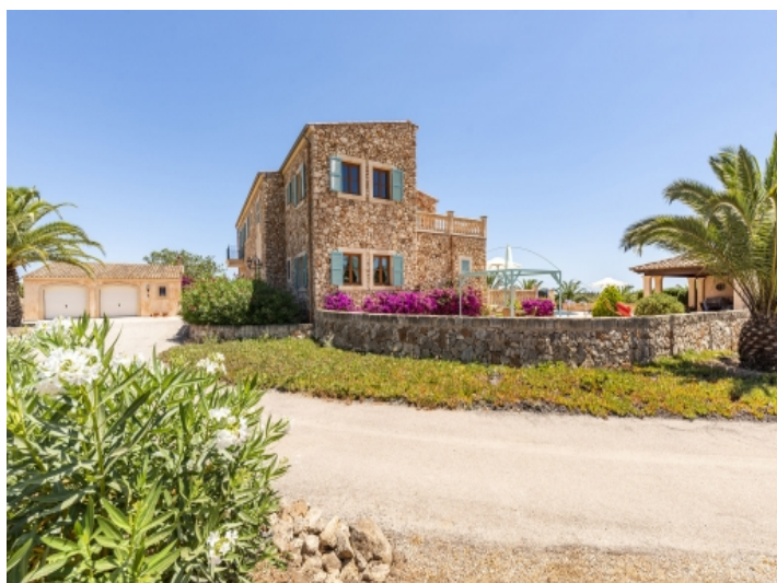
Front and entrance view of the finca