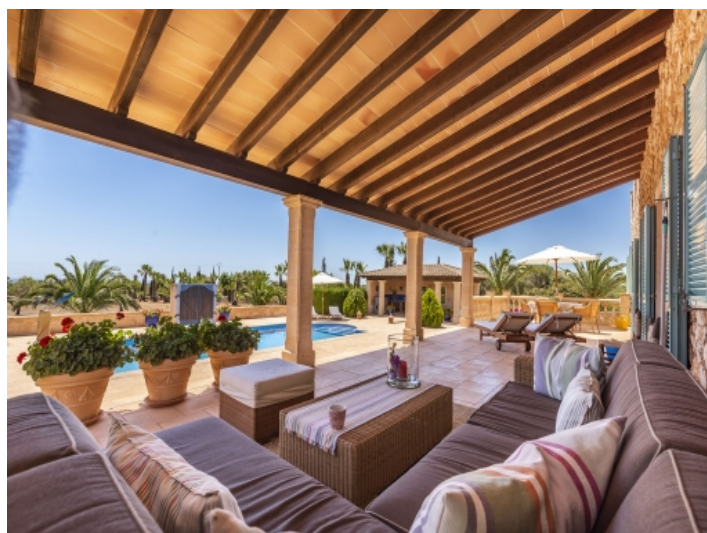
Covered chill out area on the terrace