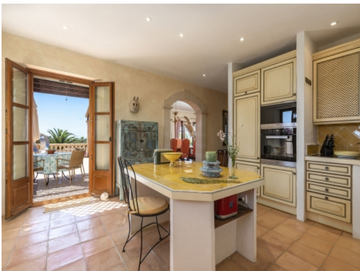
Access to another terrace