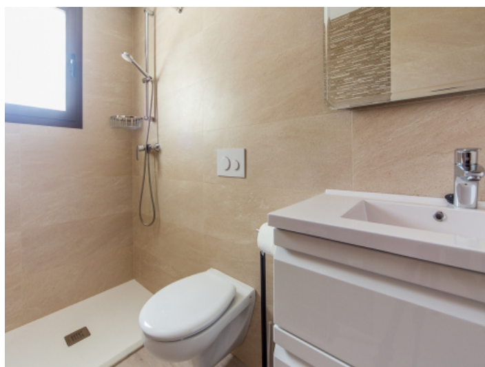
Second bathroom with shower