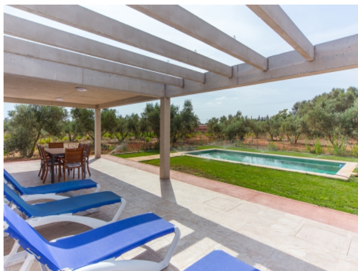
Lounge area on the terrace with views to the pool