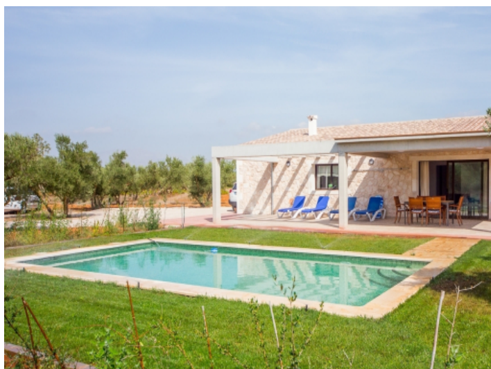
Large plot of 15.000 sqm with lots of privacy