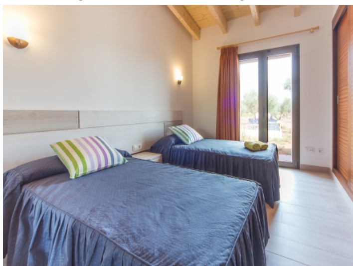
Double bedroom with panoramic windows