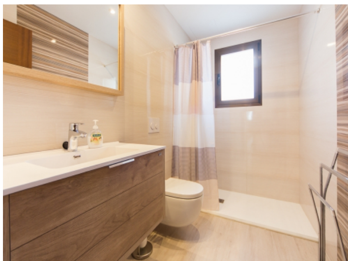
Bright master bathroom with large shower