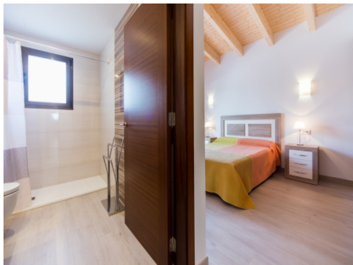
Master bedroom with bathroom en suite