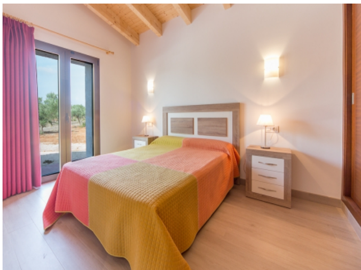
Friendly master bedroom