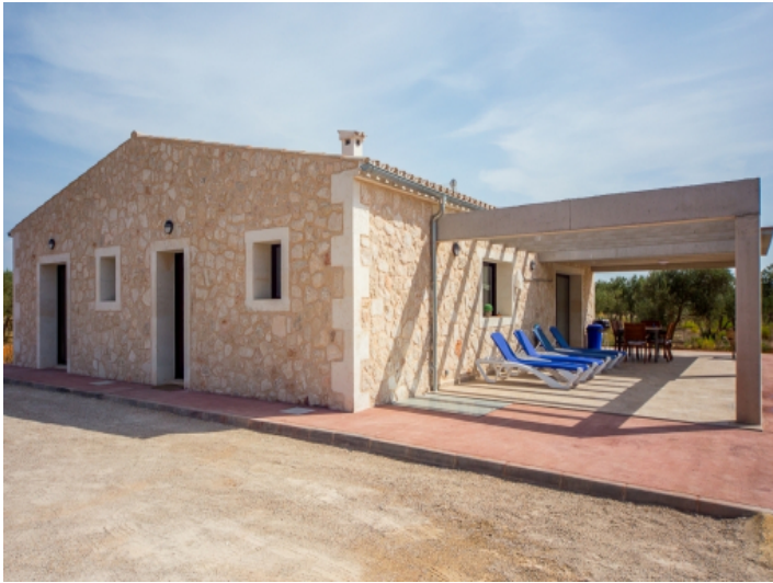
Mediterranean elements and modern equipment