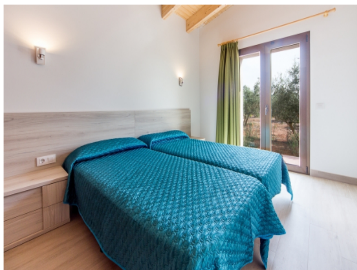
One of three double bedrooms