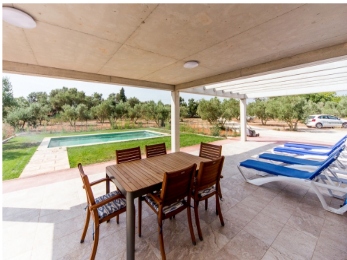
Covered terrace with dining area and views of the garden