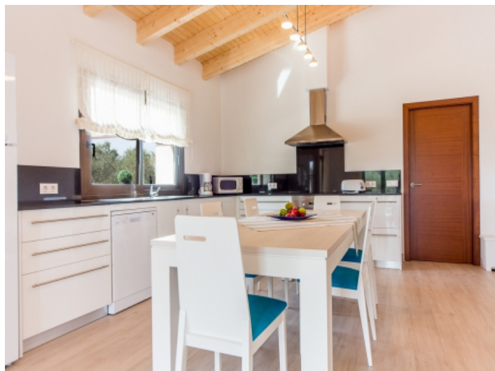
Modern kitchen with dining area