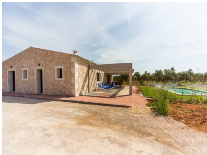
Access to the property