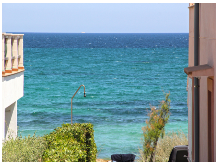
Lovely sea views