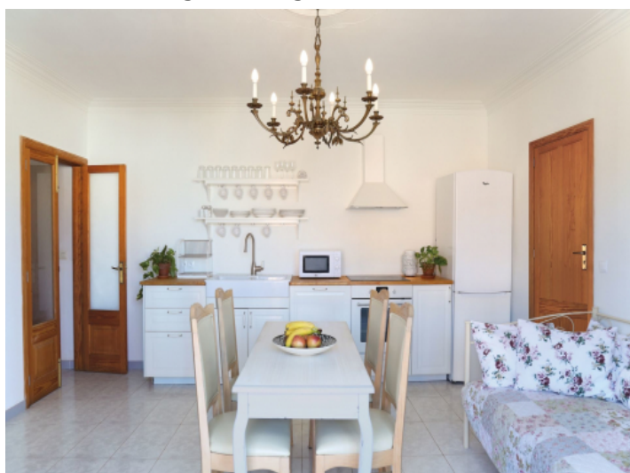
Open plan living area