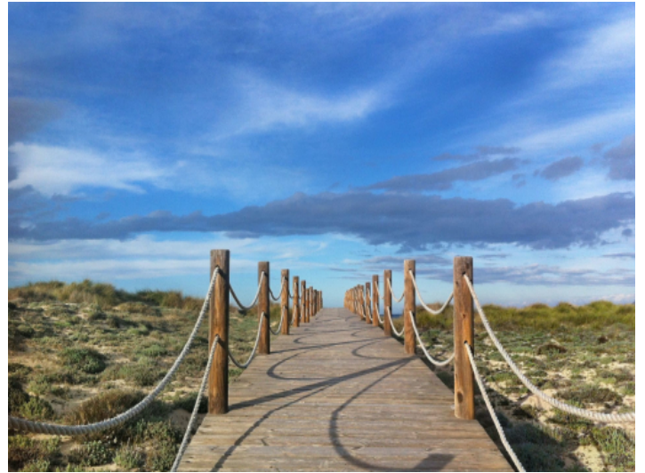
Wooden path leading to the sea