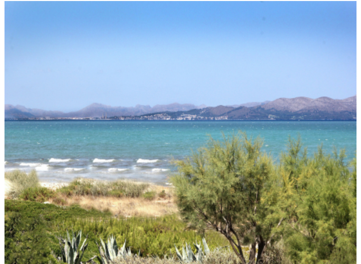
Impressive sea views from the balcony