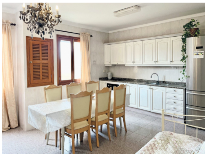
Additional live-in kitchen