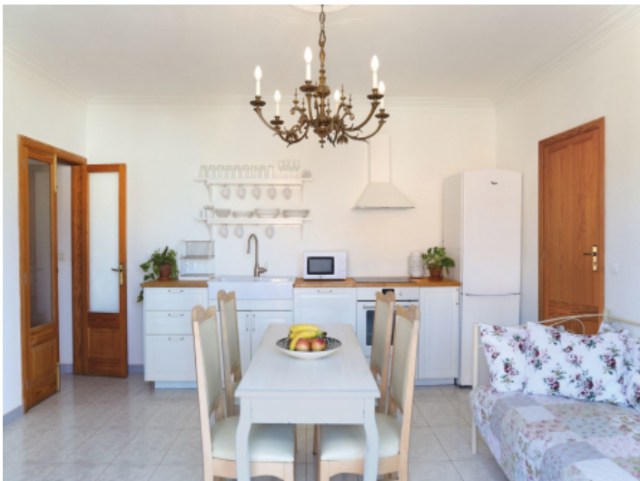
Open plan living area