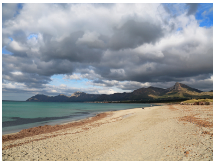
The beach nearby