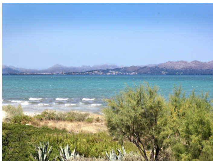
Impressive sea views from the balcony