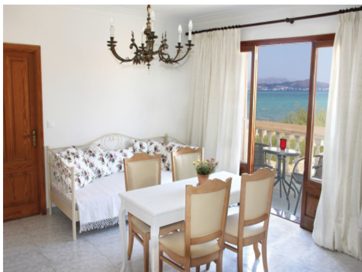
Living and dining area with sea views