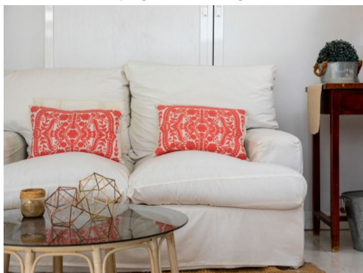
Comfortable lounge area