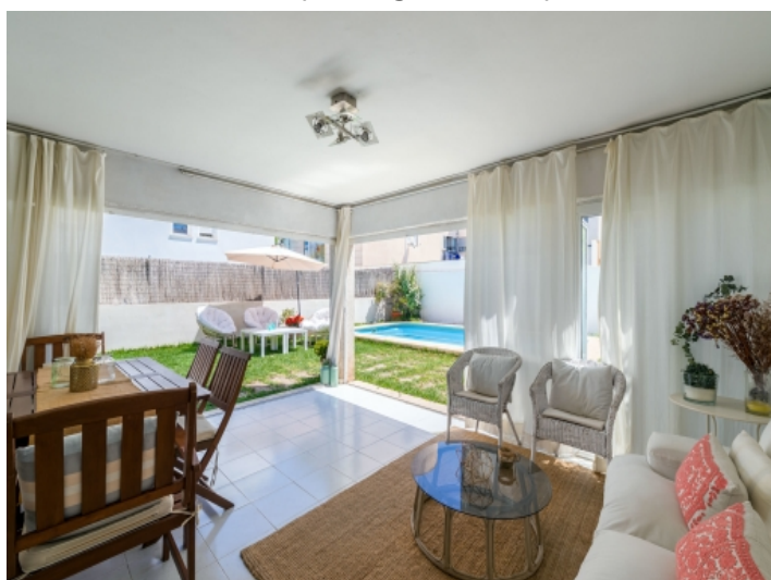
Ground floor with open access to the garden