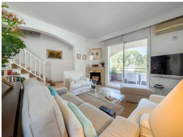
Main living area on the first floor