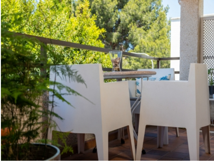
Balcony with seating area