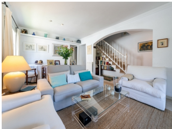
Beautiful living and dining area