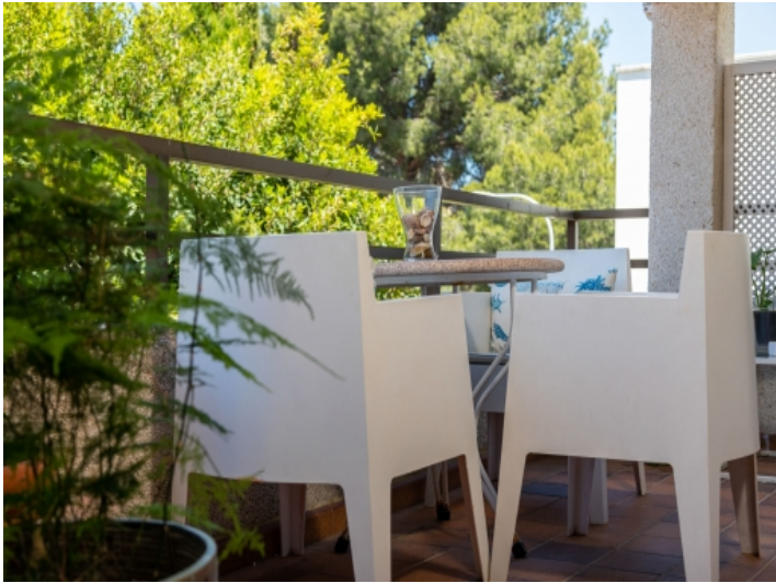
Balcony with seating area