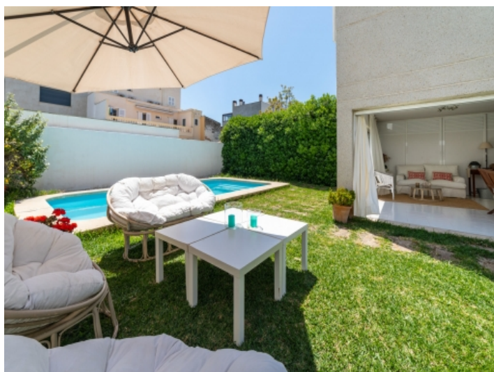
Beautiful private garden with pool