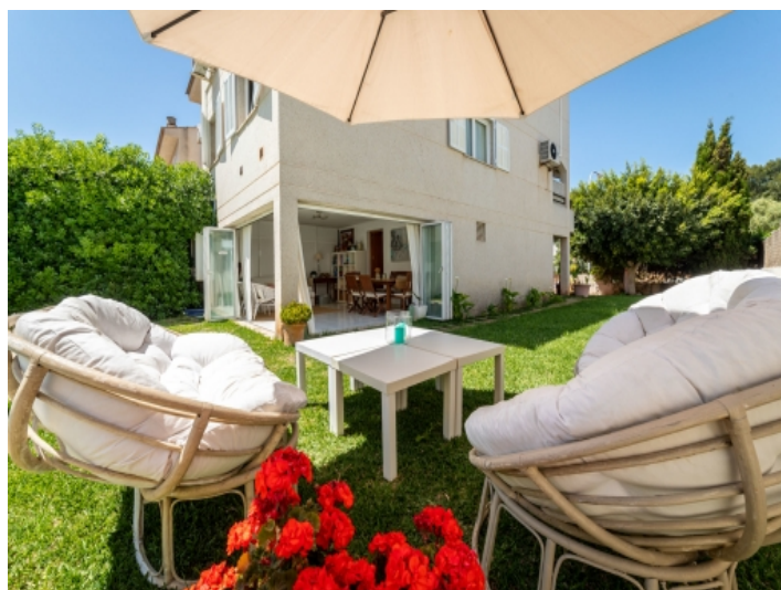
Tranquil garden with lounge area