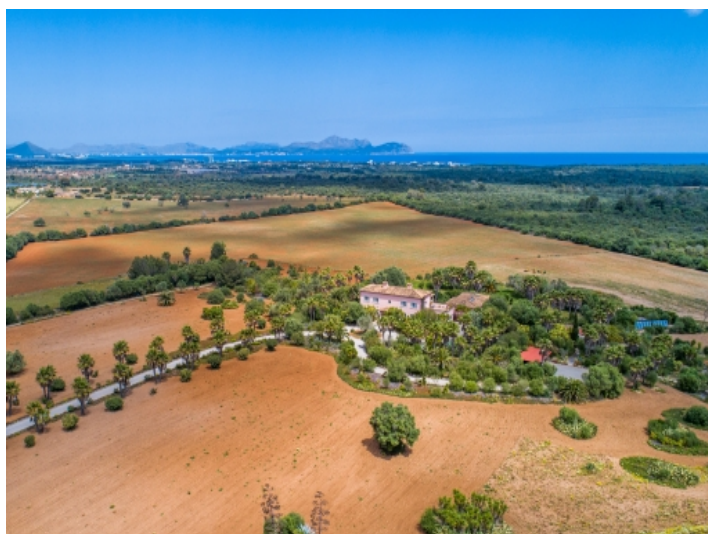
Bird's eye view of the finca with panorama views