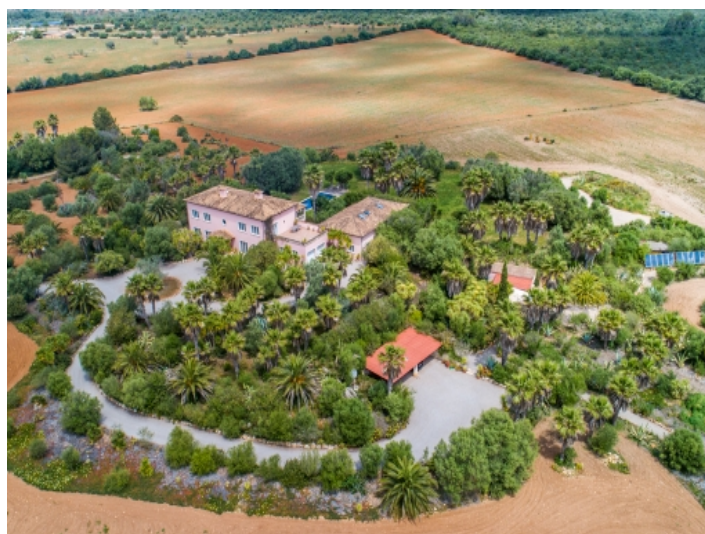
Finca surrounded by an oasis of palm trees