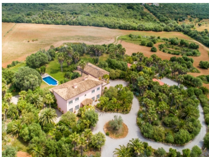
View of the access to the finca