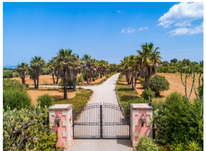
Access to the property