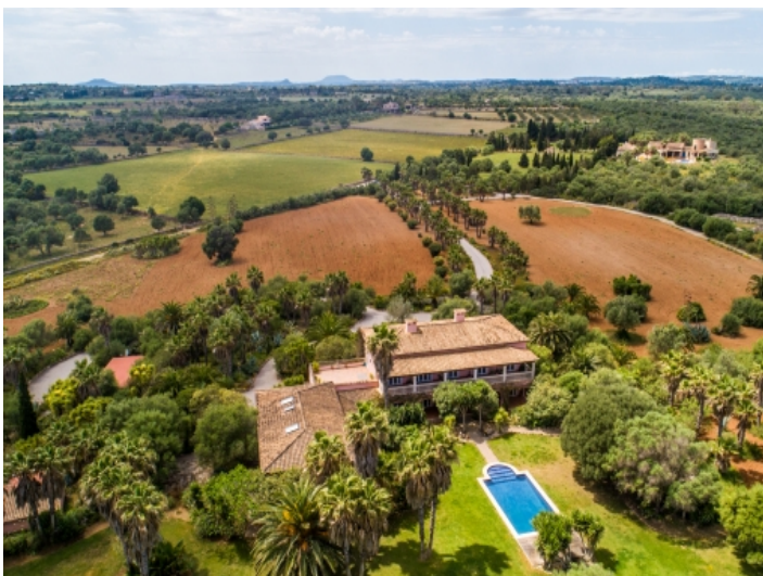
View of the mediterranean plot