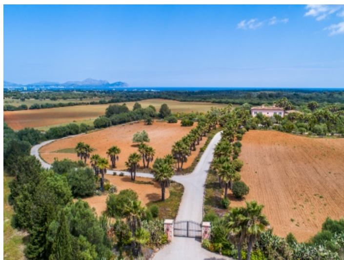
Impressive driveway to the finca