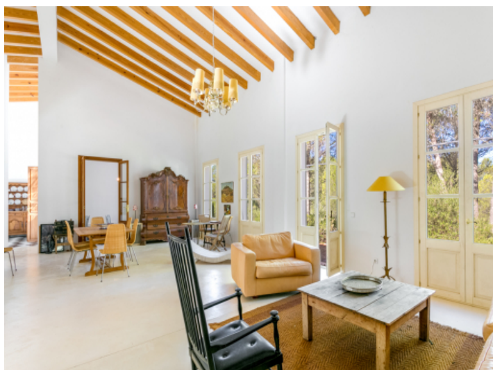
Lightflooded living area with high ceiling