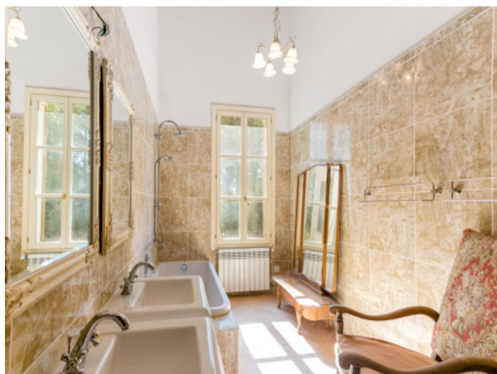
Sunny bathroom with bathtub

PORTA MALLORQUINA • C./ COLOM 20 2º, 07001 PALMA, SPAIN