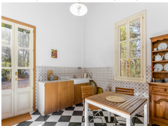
Lovely kitchen with tiled floor