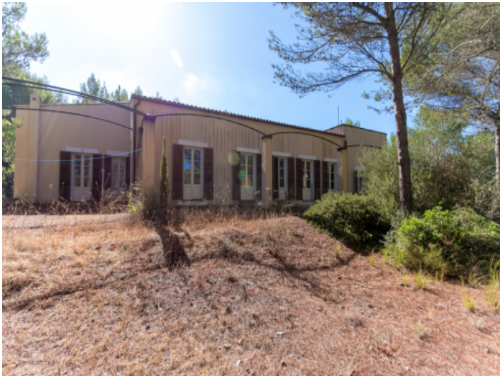
View of the studio house from the outside