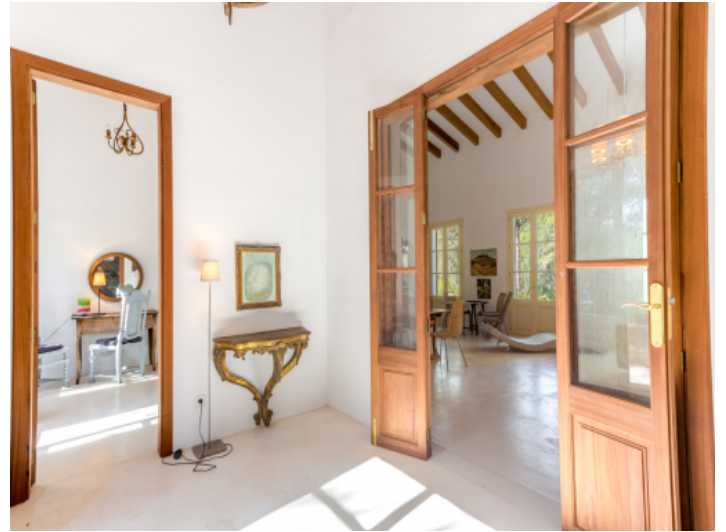
Appealing entrance area