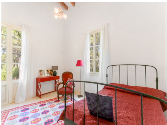
Bedroom with access to the garden