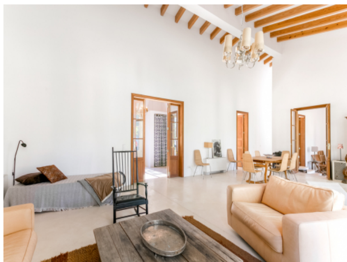
Spacious living area with beautiful wooden ceiling beams