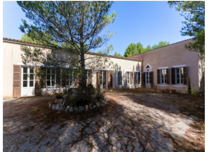
Another perspective of the house