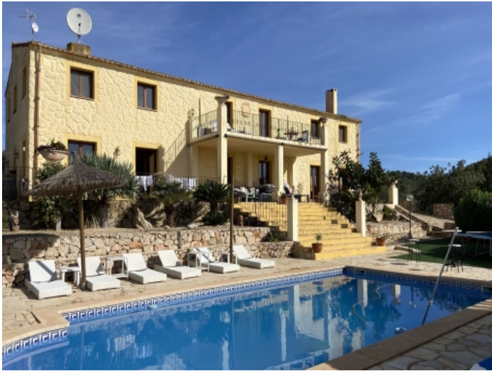
Finca with pool and splendid views int Sant Llorenç des