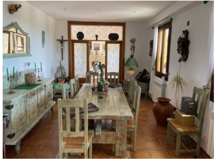
View to the living and dining area