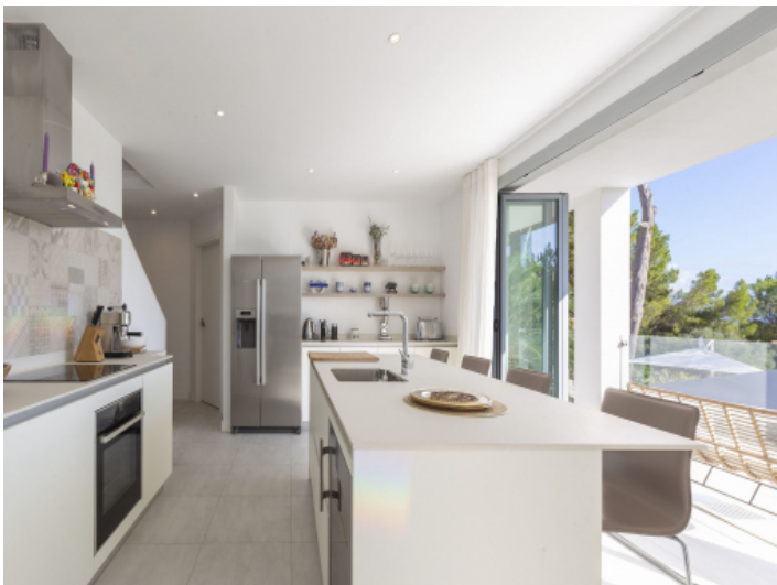
Kitchen with cooking island