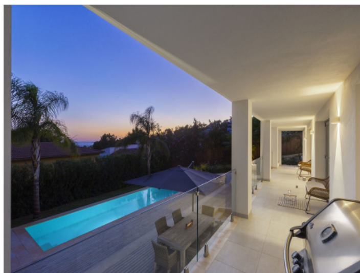
Balcony by night