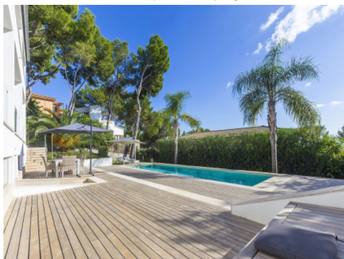
Sunny pool area