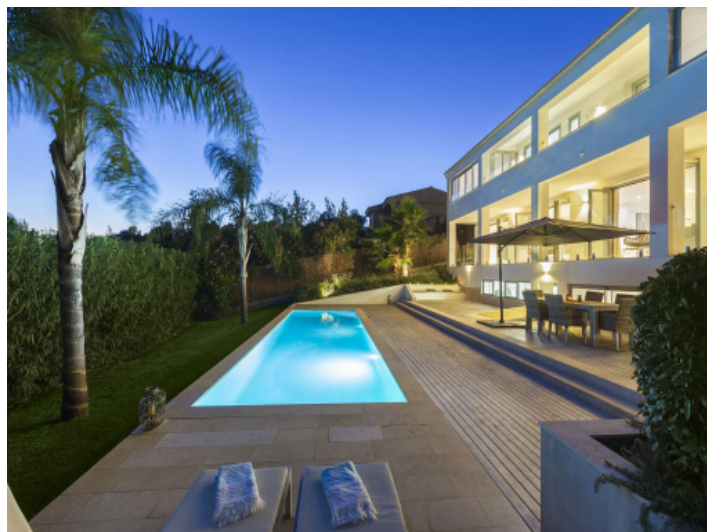
Romantic pool area by night