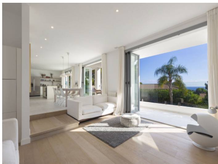
Open living area