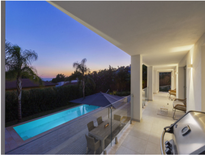
Balcony by night