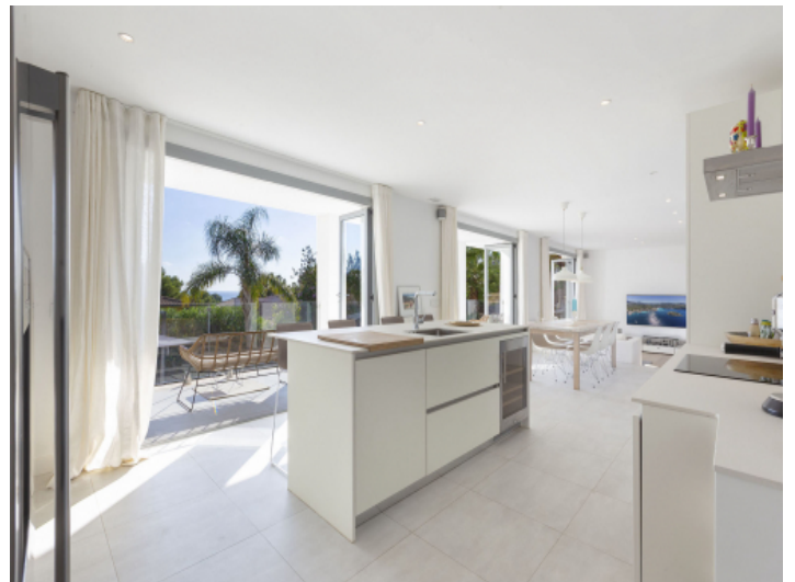
Kitchen with cooking island