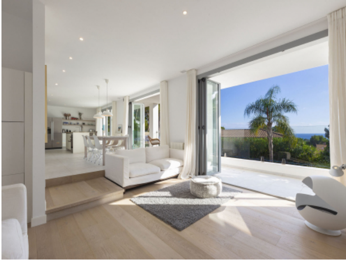
Open living area