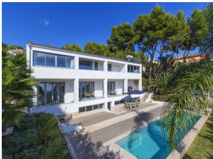
house, Costa den Blanes