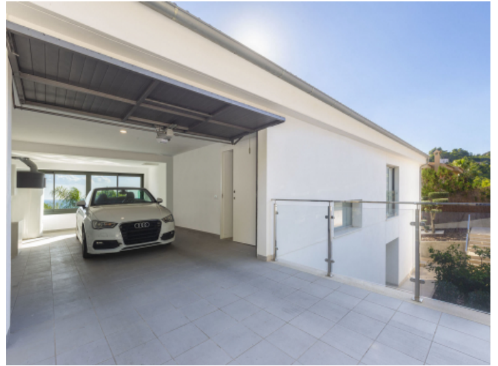
Garage of the villa