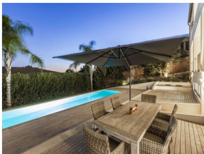
Terrace by night