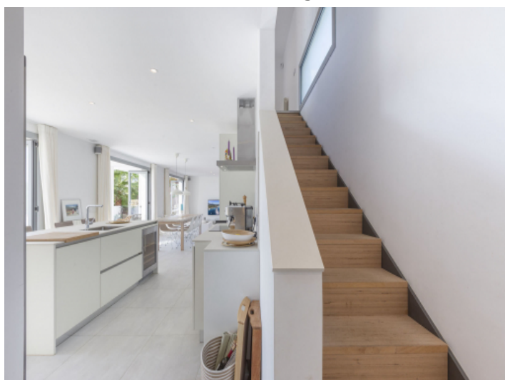
Access to the upper floor