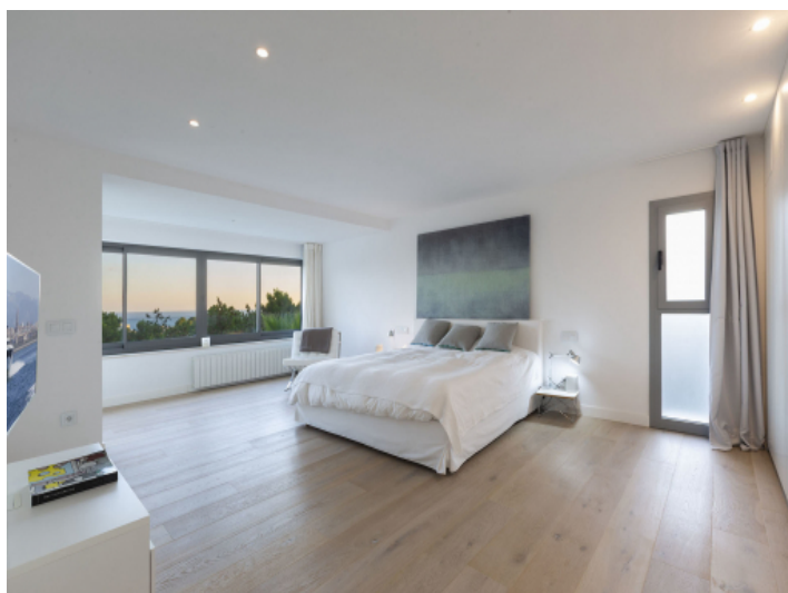
Master bedroom with large windows