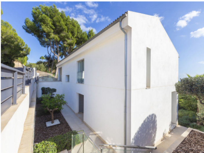
Exterior view of the villa