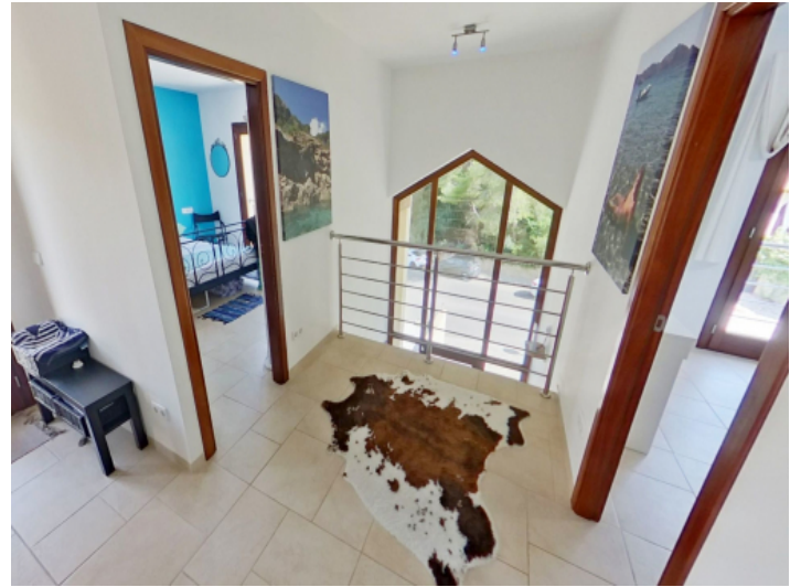
Hallway 1. floor