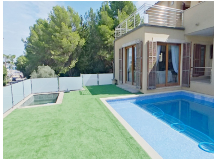
Garden and pool