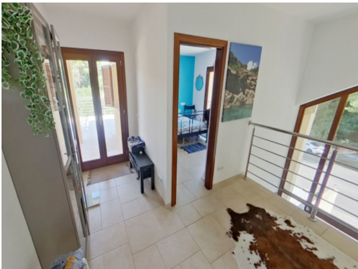
Hallway 1. floor