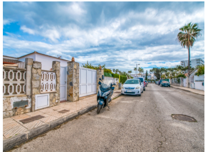
View of the street