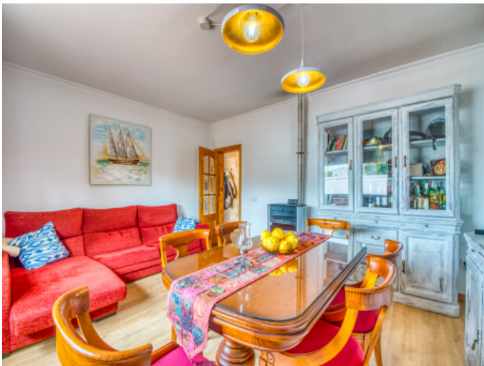
Comfortable living and dining area