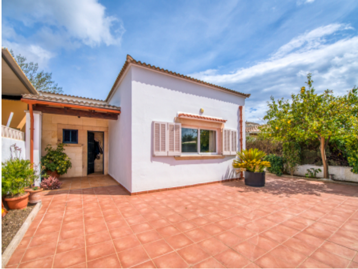
Access to the house with large front terrace