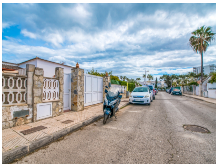
View of the street