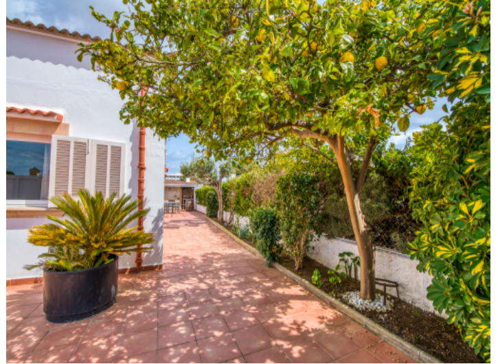
Beautifully planted terrace