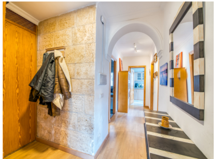
Friendly entrance area