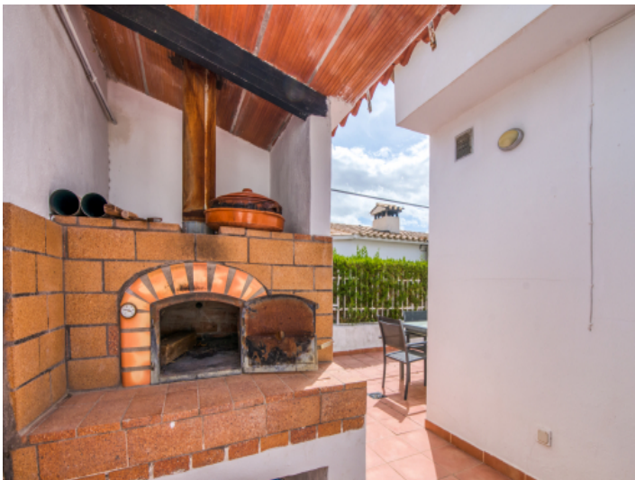
Wood-fired oven on the terrace