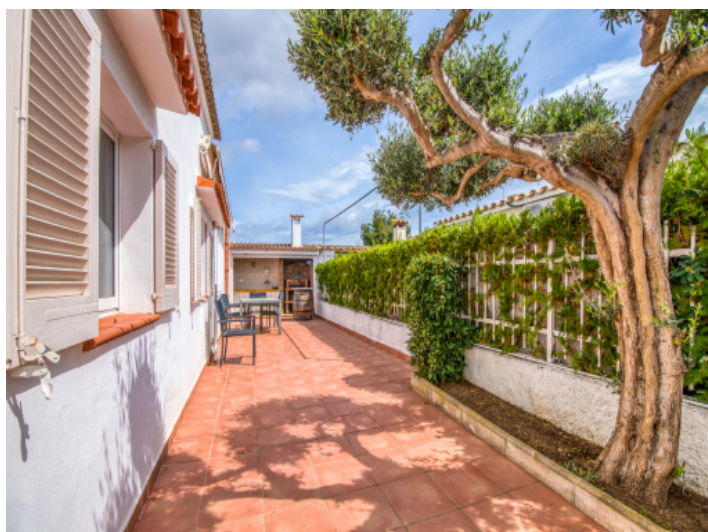
Private terrace on the side