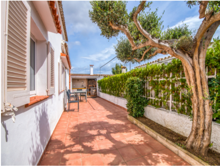
Private terrace on the side