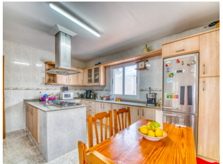
Spacious kitchen with dining area