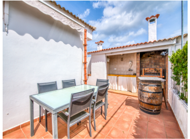
Outdoor dining and bbq area