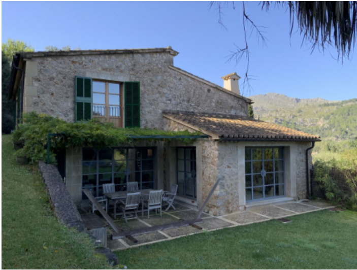
Mallorcan style finca