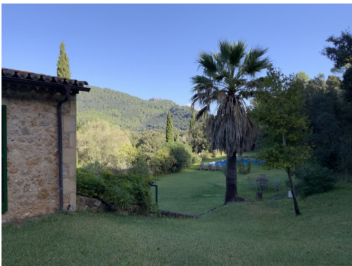
Very well mantained garden