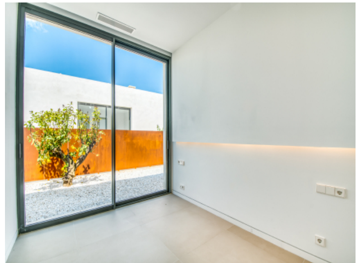
Bright bedroom with access to the outside