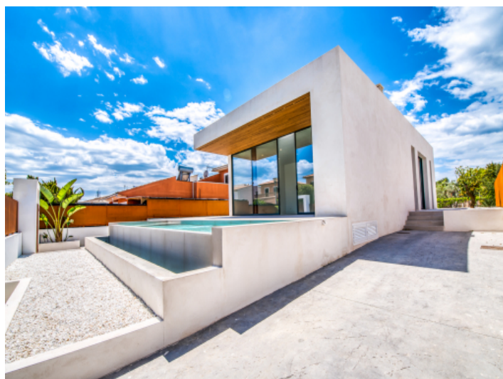
Access to the plot and exterior view