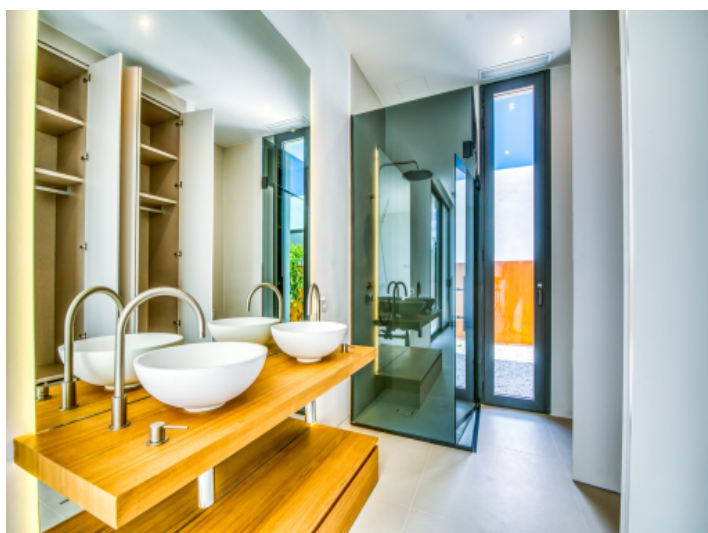
Modern en suite bathroom