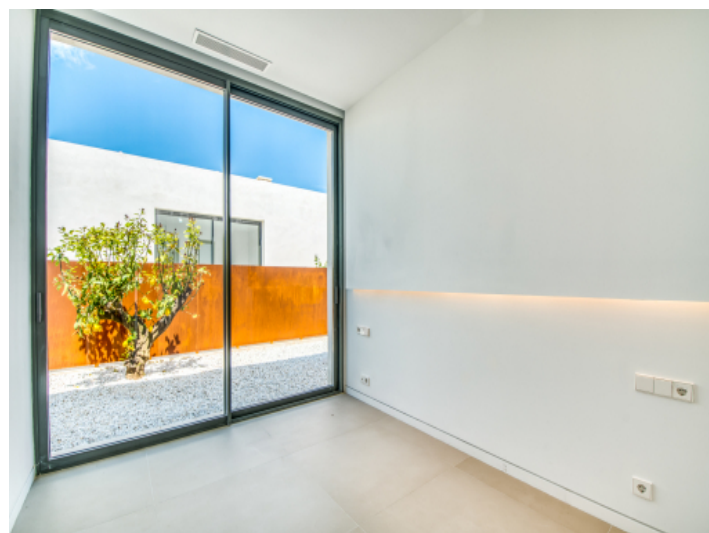
Bright bedroom with access to the outside