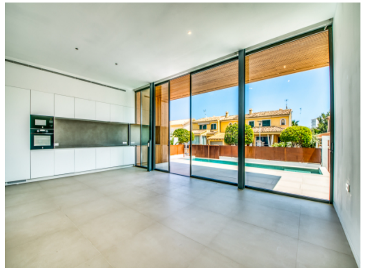
Living area with panorama windows