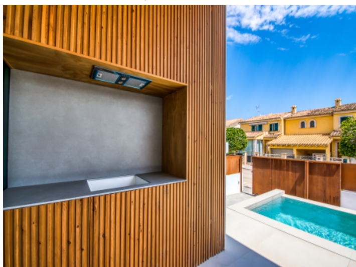
Modern outdoor kitchen