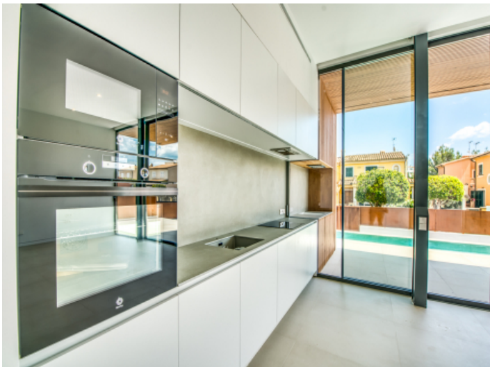
Modern, open kitchen