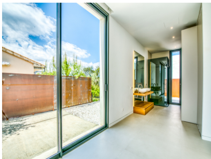
Bedroom with open bathroom