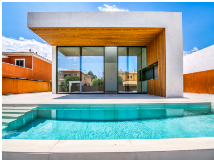
Modern pool and terrace area