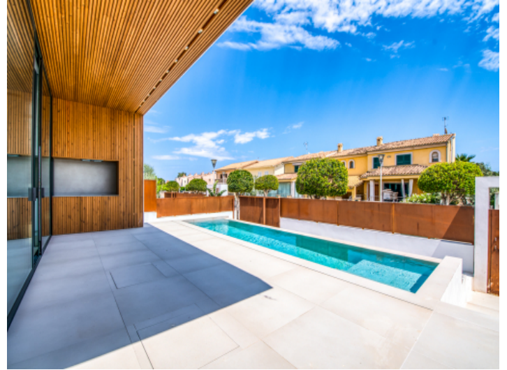
Elegant terrace with pool views