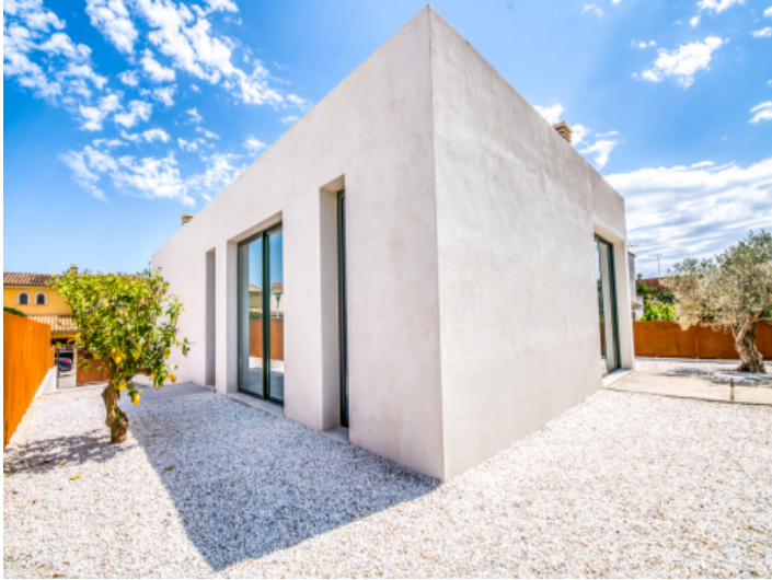
Rear view and outdoor area