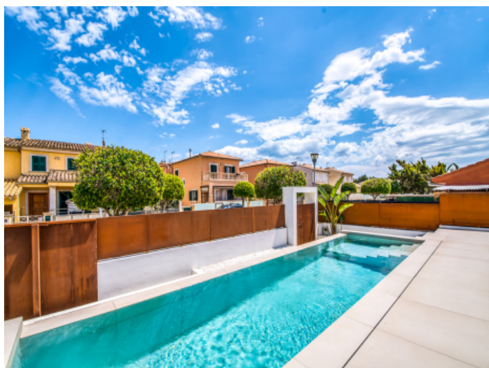
Elegant, sunny pool