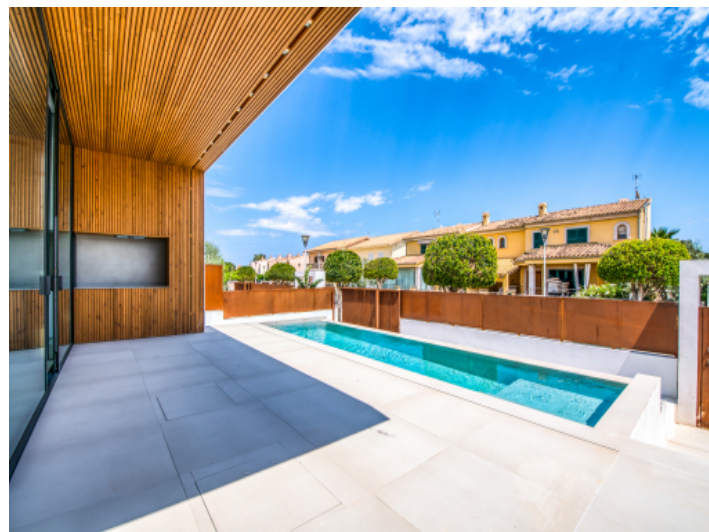
Elegant terrace with pool views