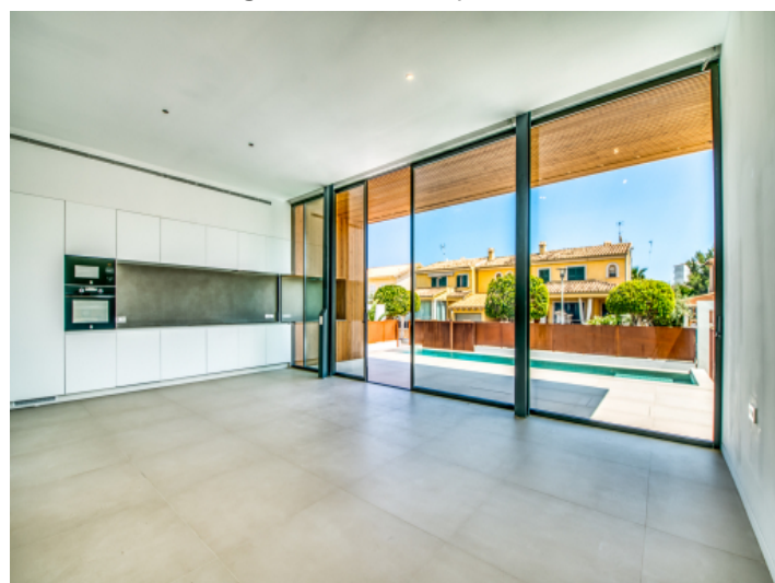
Living area with panorama windows