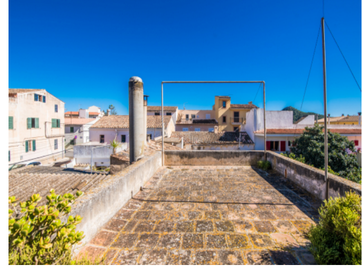
Large roof terrace

PORTA MALLORQUINA • C./ COLOM 20 2°, 07001 PALMA, SPAIN TEL.: +34 971 698 242 • INFO@PORTAMALLORQUINA.COM • WWW.PORTAMALLORQUINA.COM