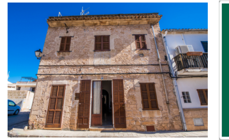
Capdepera search for property MAL-117510