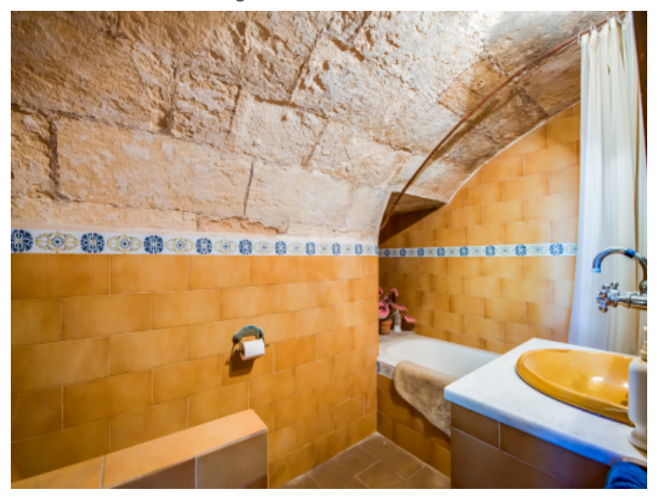
Bathroom with vaulted ceiling