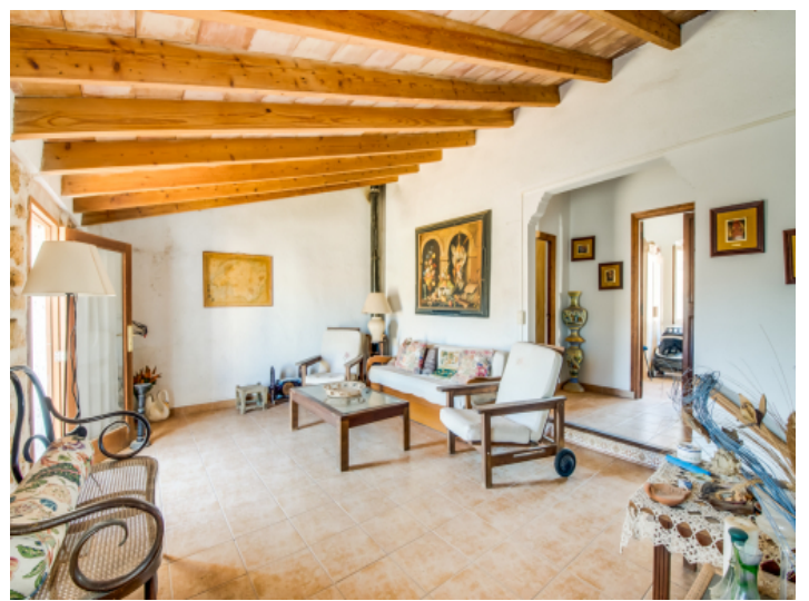
Living area with wooden ceiling beams