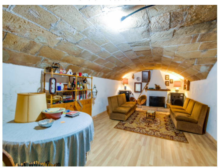
Living room in the basement