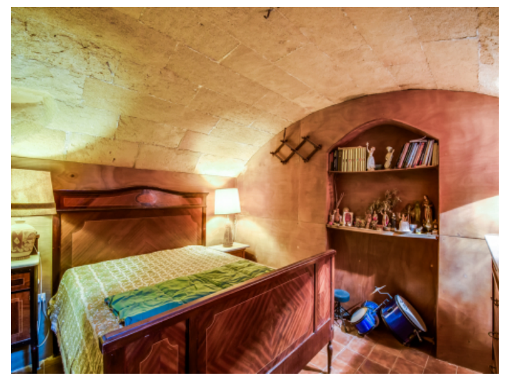
Bedroom with vaulted ceiling