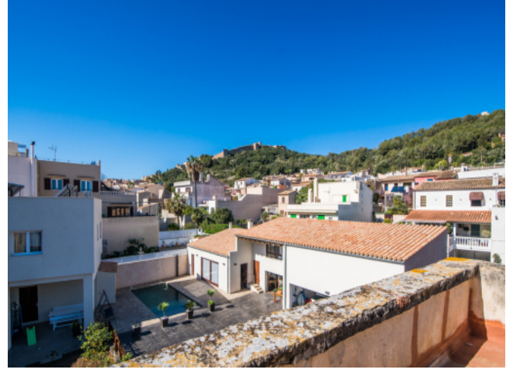
Sweeping views to the Castel de Capdepera