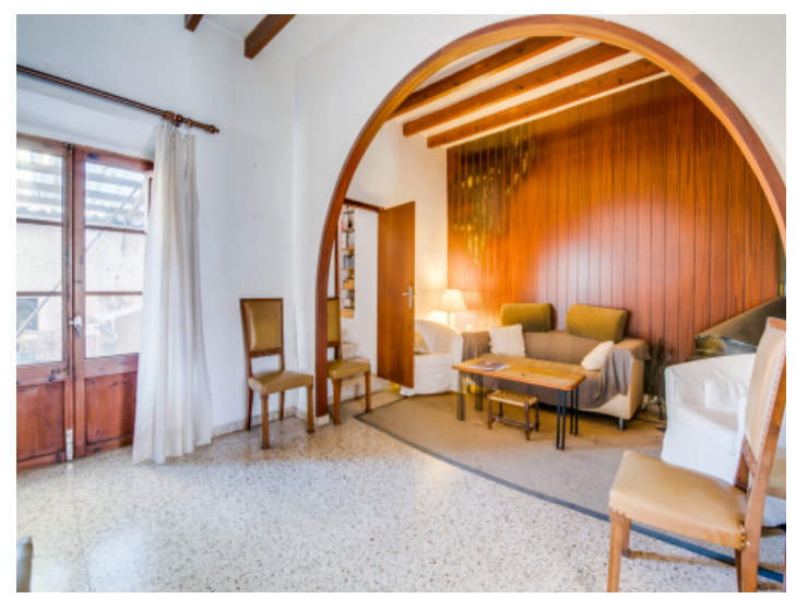
Room with wooden arch and lounge area

PORTA MALLORQUINA • C./ COLOM 20 2°, 07001 PALMA, SPAIN TEL.: +34 971 698 242 • INFO@PORTAMALLORQUINA.COM • WWW.PORTAMALLORQUINA.COM