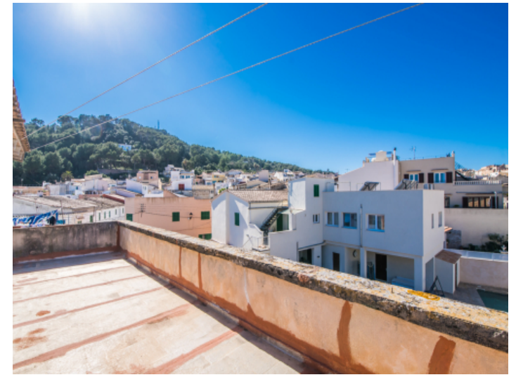
Sunny roof terrace