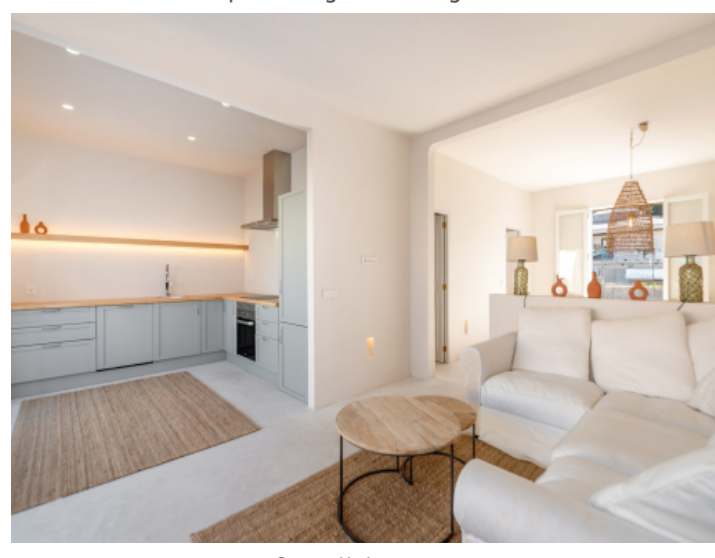
Open living area