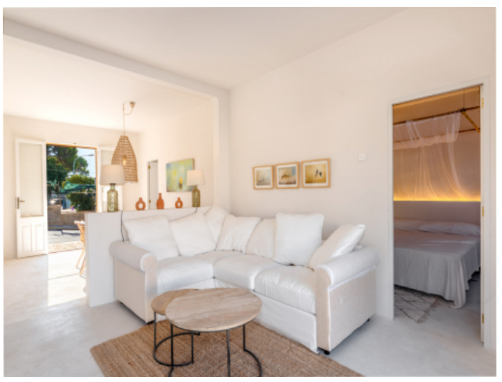
Modern living area