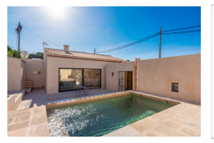
Cala Ratjada search for property MAL-117461