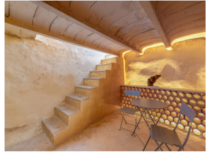
Wine cellar with indirect lights

PORTA MALLORQUINA • C./ COLOM 20 2°, 07001 PALMA, SPAIN TEL.: +34 971 698 242 • INFO@PORTAMALLORQUINA.COM • WWW.PORTAMALLORQUINA.COM