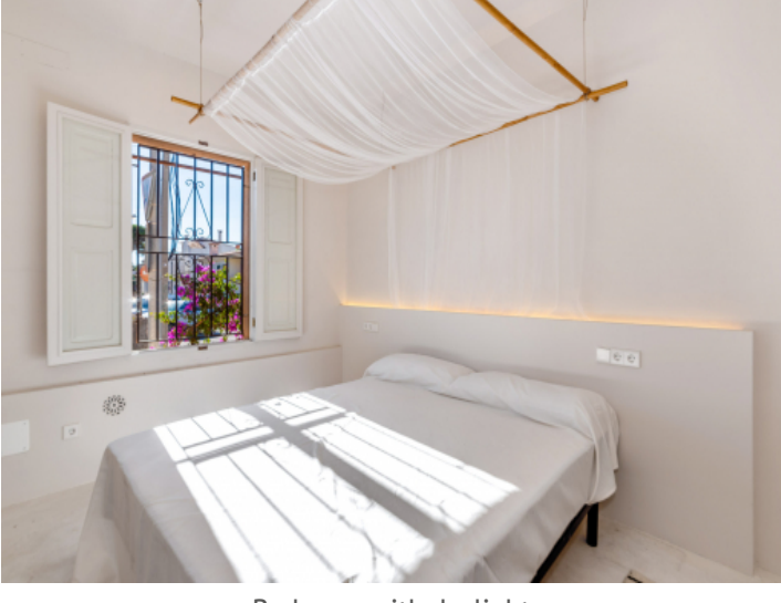
Bedroom with daylight