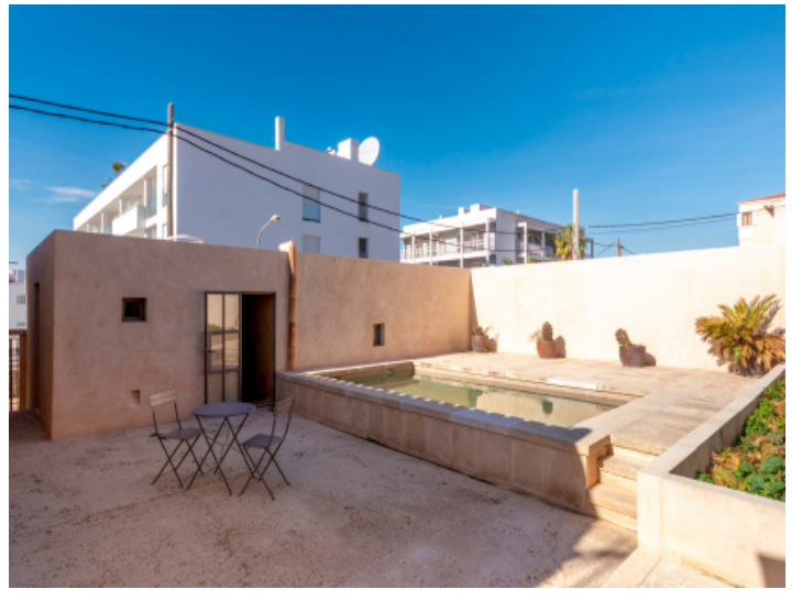
Terrace with palms