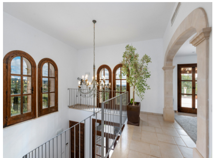
Elegant access to the upper floor