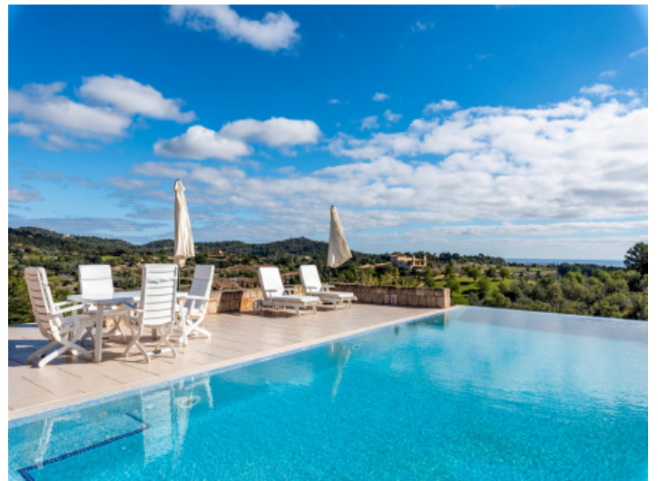
Infinity pool with views as far as the sea