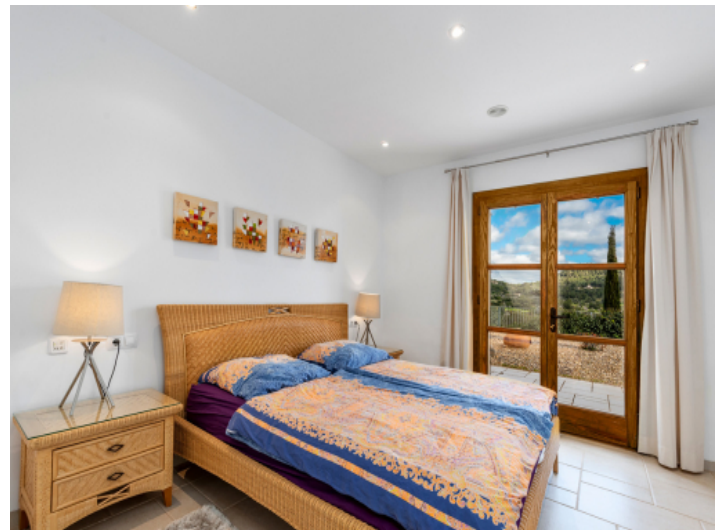
Further ground floor bedroom