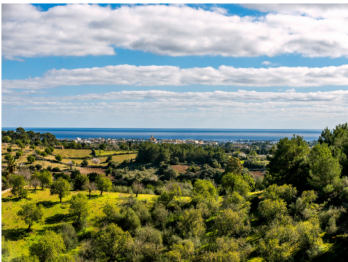
Dreamlike sweeping views