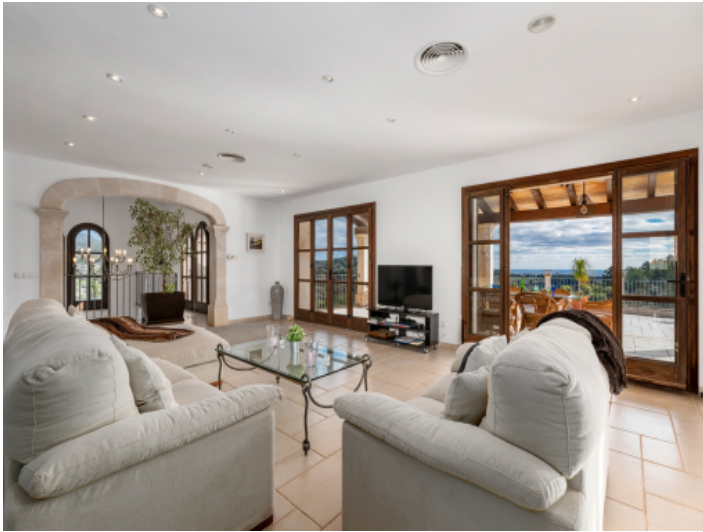
Generous living area on the upper floor