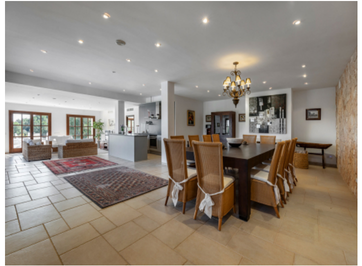
Large living area with dining area