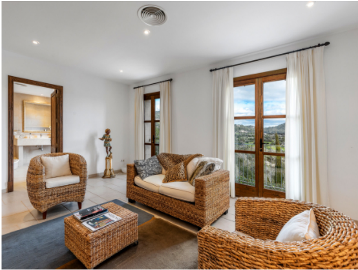
Master suite with lounge area