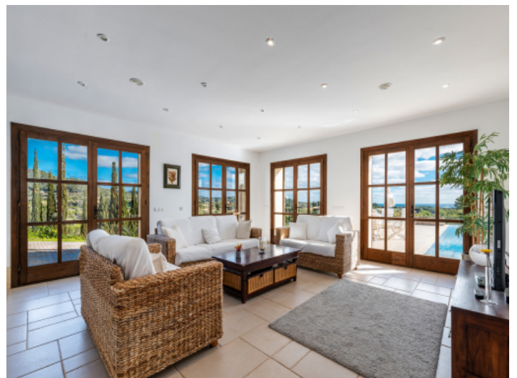
Living area with direct access to the pool terrace