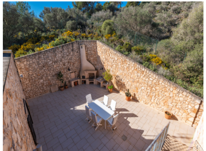
View into the indoor patio