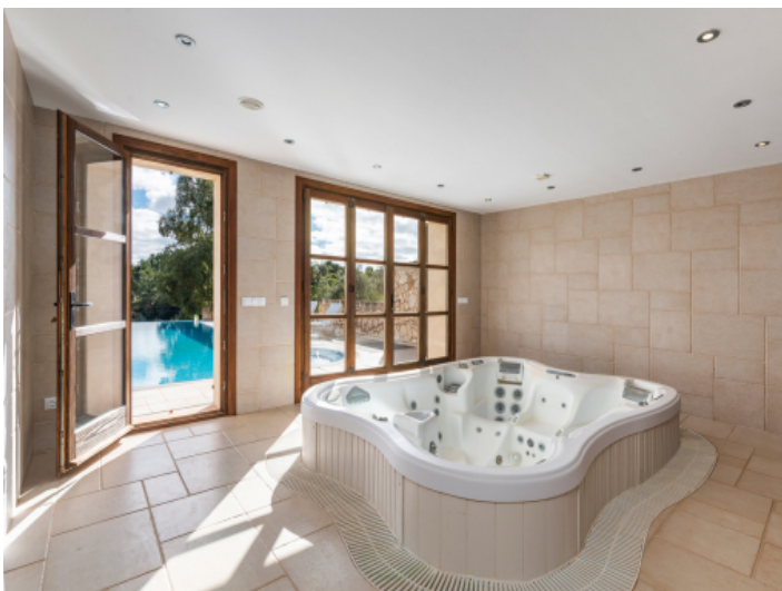
Jacuzzi room with access of the pool area