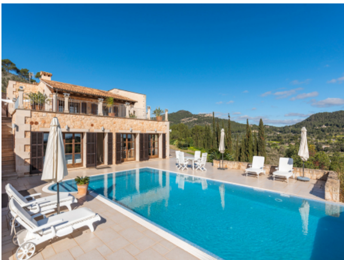
Pool area surrounded by a wonderful landscape