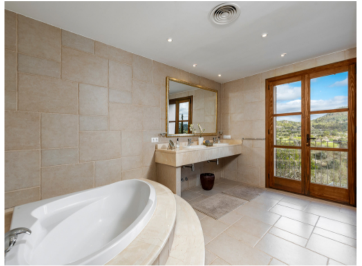
Bathroom with bathtub and a view