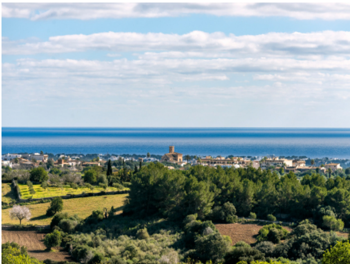
Stunning views as far as the sea