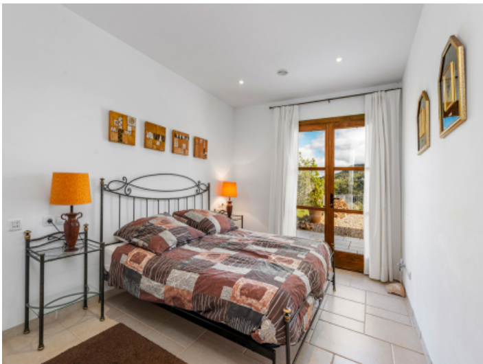
Double bedroom on the ground floor