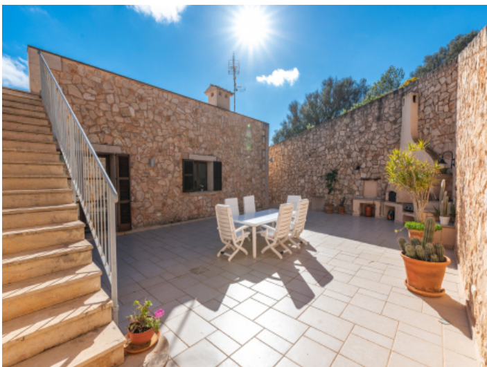
Mallorcan patio with bbq area