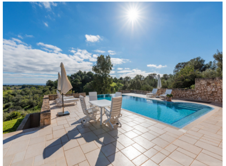
Pool area with absolute privacy