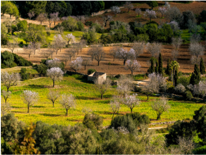
Finca surrounded by nature