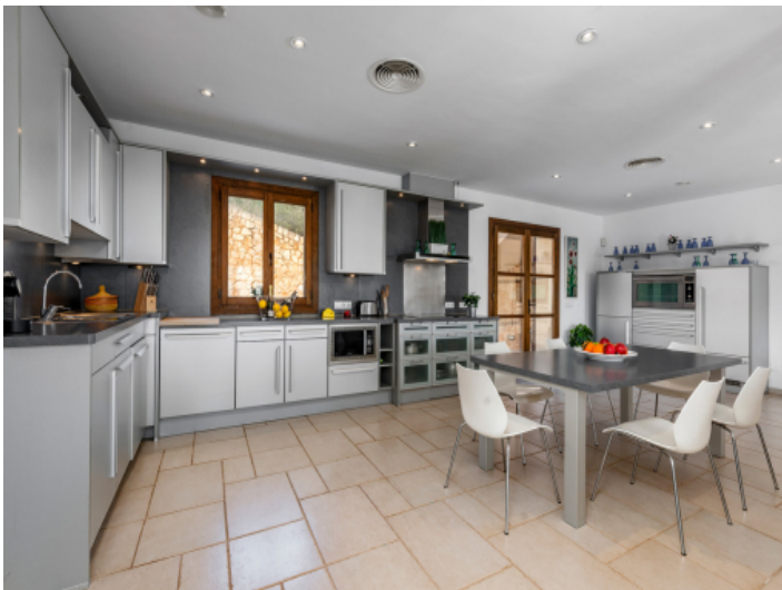
Large kitchen with access to a patio