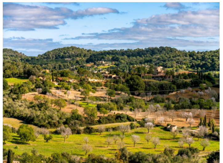
Views to the hilly landscape