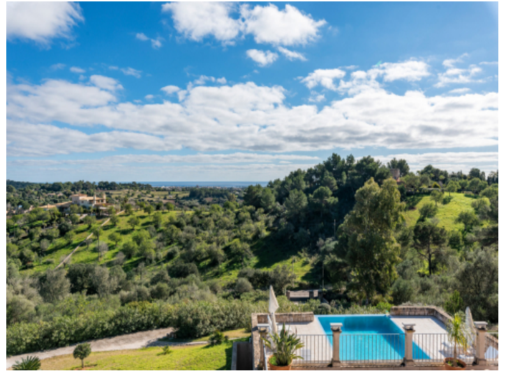
Enchanting panoramic views over the landscape