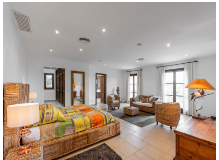
Large master bedroom suite on the upper floor