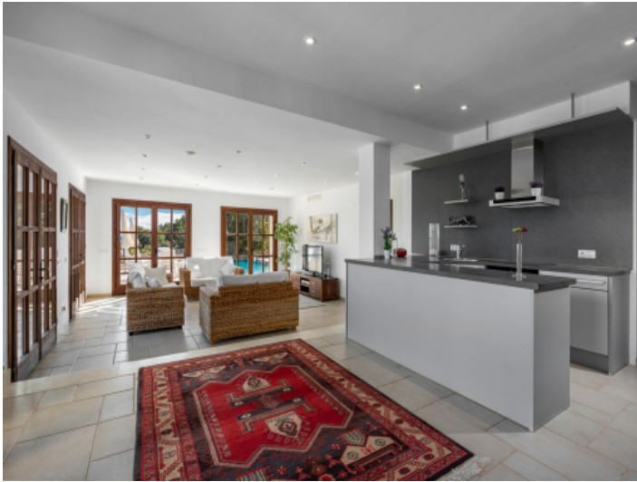
Open, modern kitchen in the living area