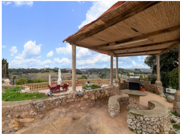
Fantastic barbecue area