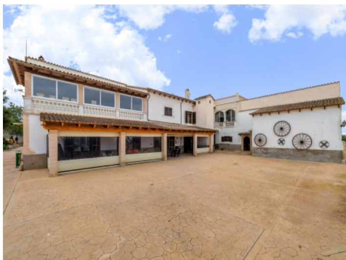
Exterior view and large outdoor area