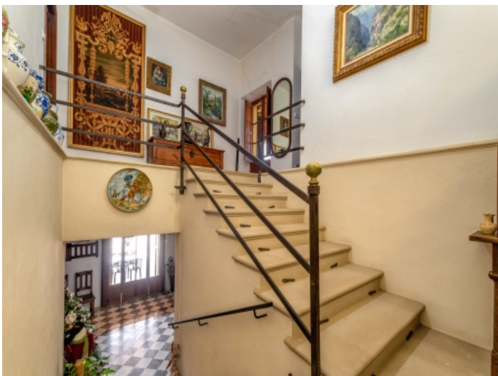
View of the floor