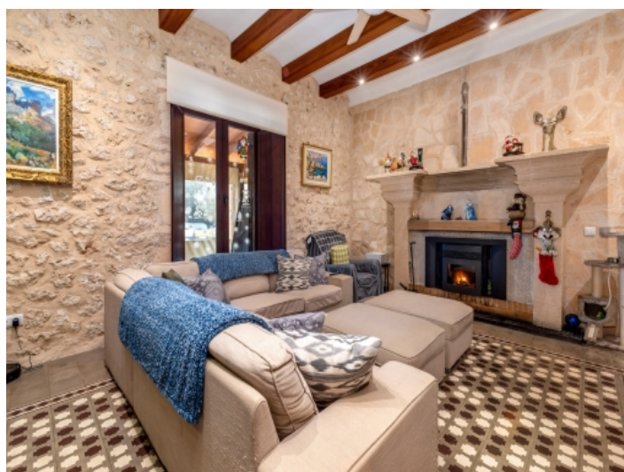
Cozy living area with fire place