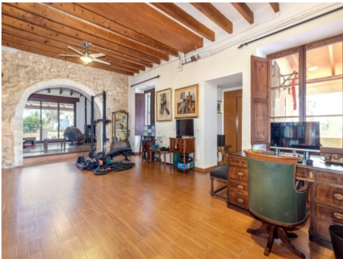
Spacious office / gym area