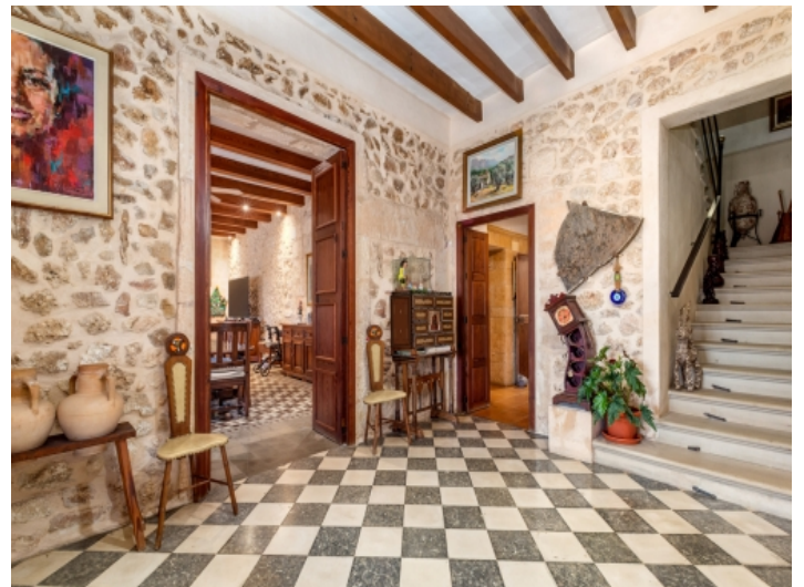
View of the floor