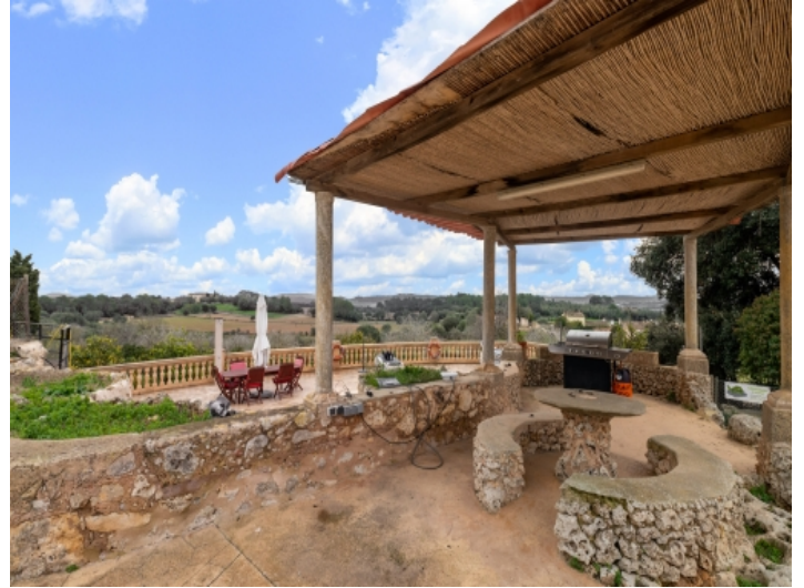
Fantastic barbecue area