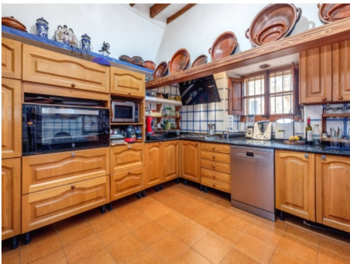
Fully equipped wooden kitchen