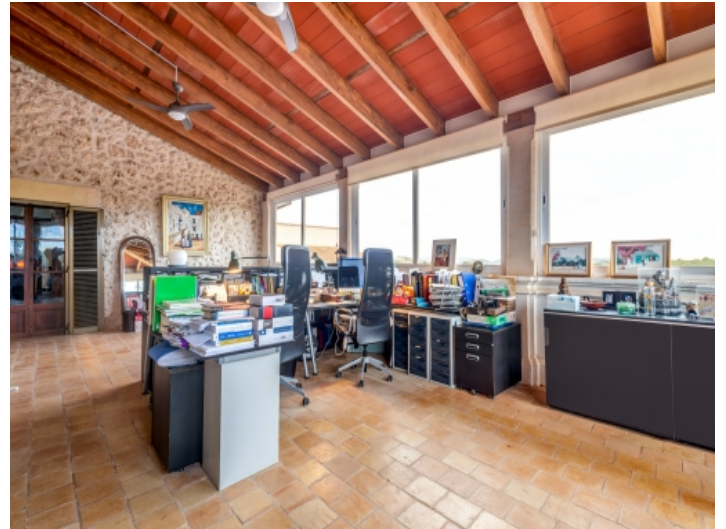
Light flooded office area