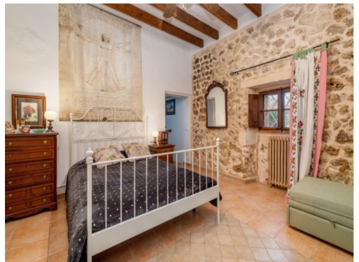
One of 7 bedrooms