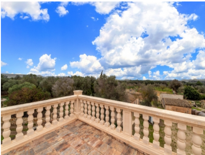
Idyllic landscape views