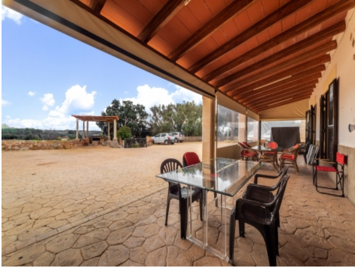
Covered sitting area