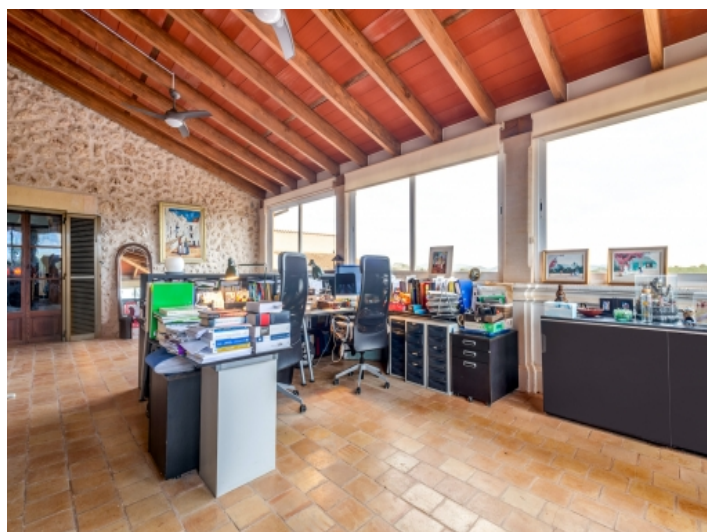
Light flooded office area