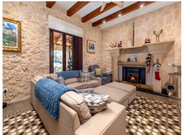
Cozy living area with fire place