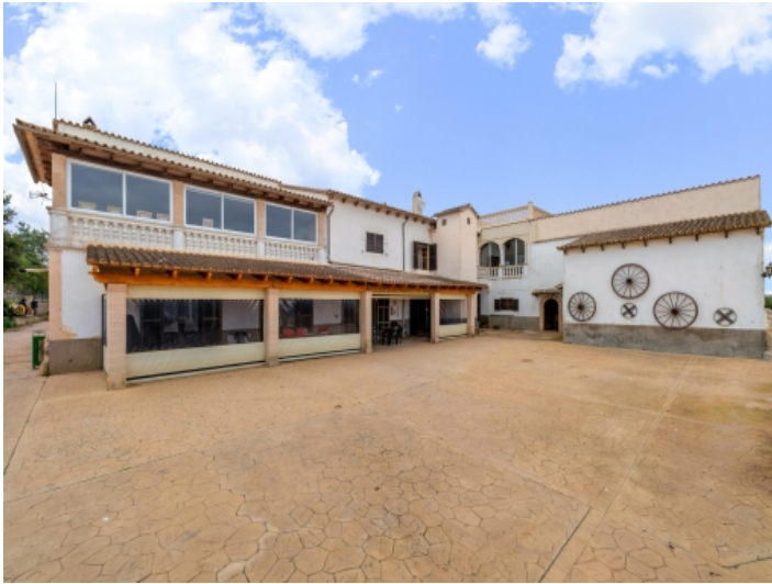
Exterior view and large outdoor area