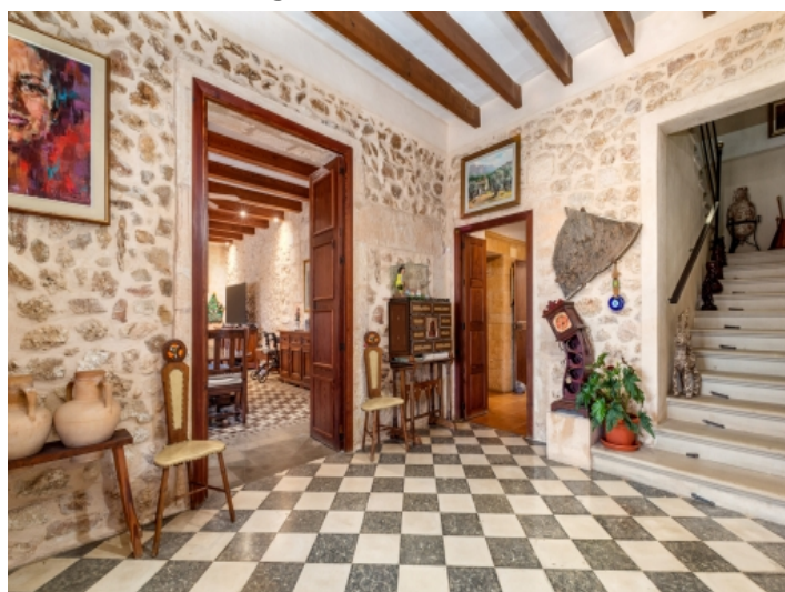
View of the floor