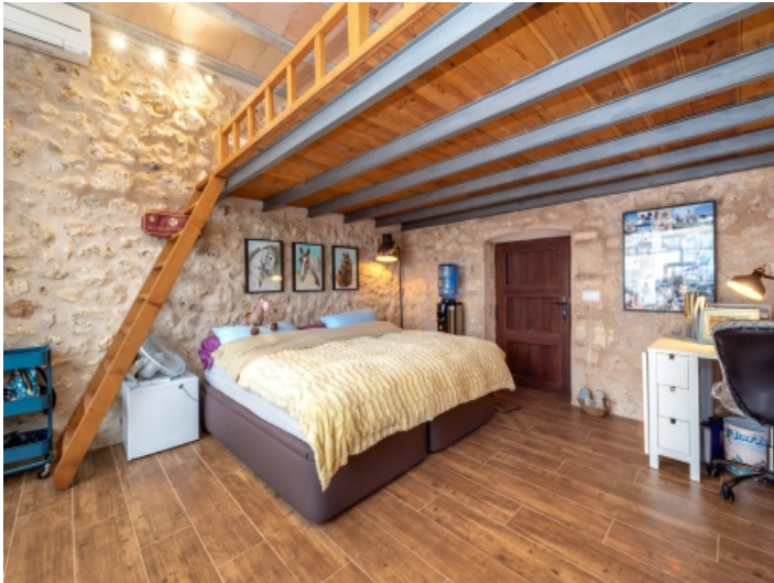
One of 7 bedrooms