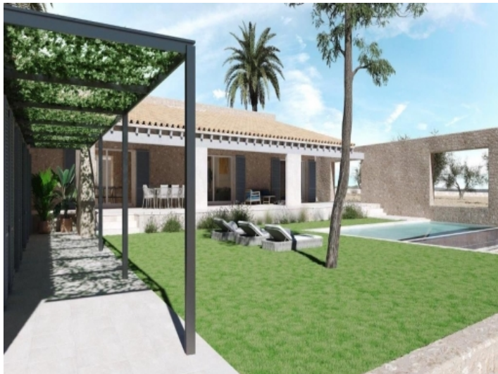
Pool and garden area