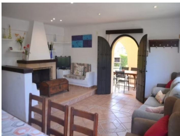
Entrance and living area