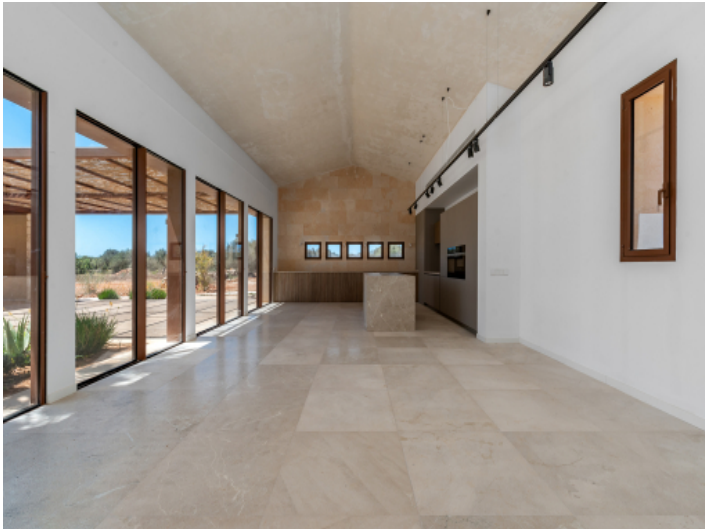
Kitchen and living area