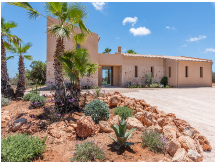
View to the finca