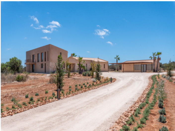
View to the property