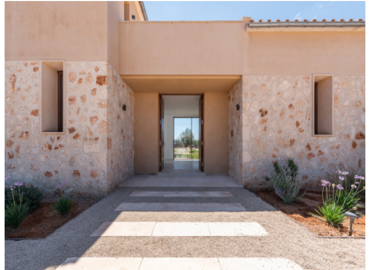
Nice entrance area