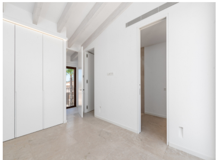
All bedrooms with bathroom en suite