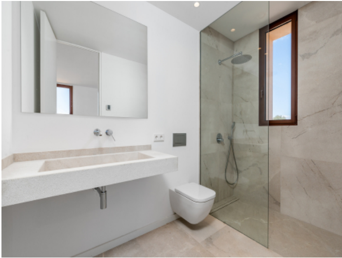
One of 6 bathrooms