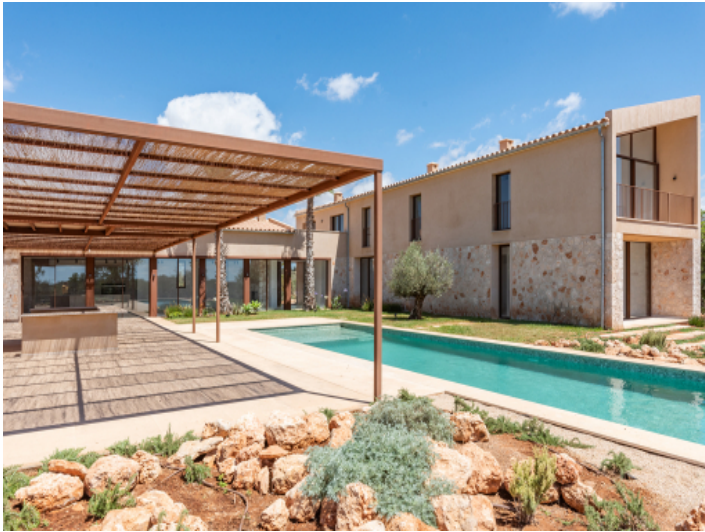
Pool and terrace