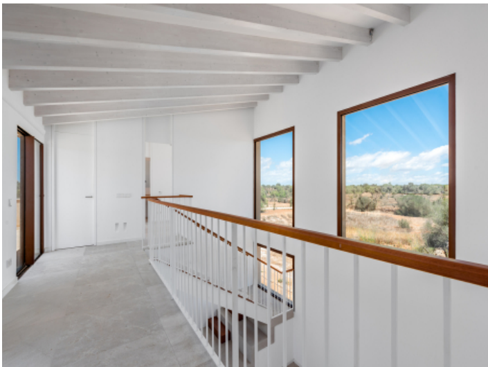
Hallway first floor