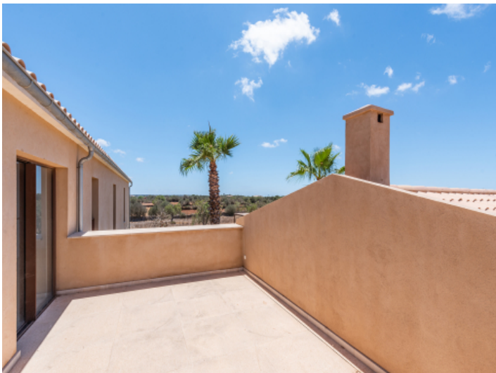
Bedroom with private terrace