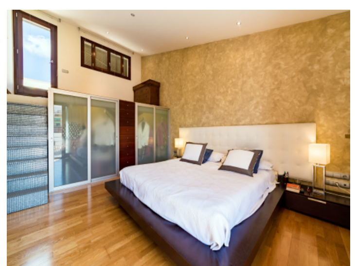
Large double bedroom