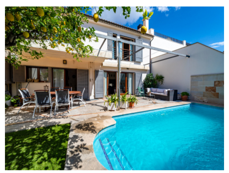
Pool area and terrace