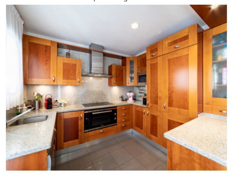
Rustic kitchen made of wood