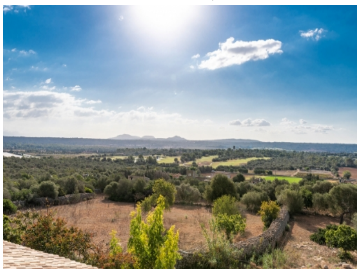
Stunning panoramic views