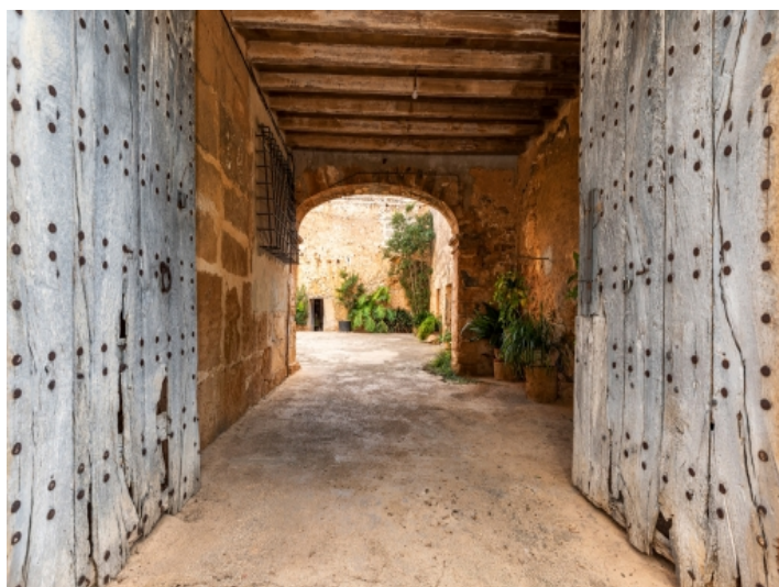
Entrance to the patio