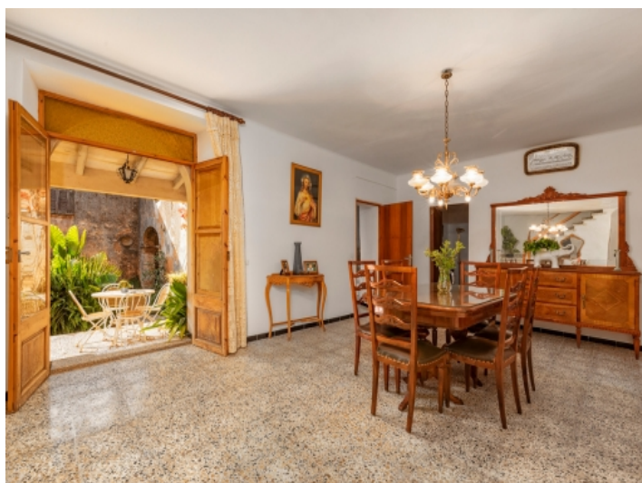
Traditional dining area