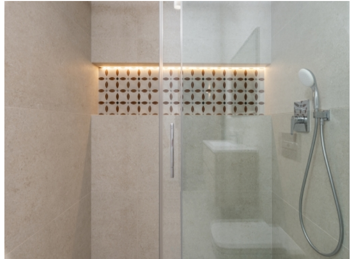
Beautifully designed kitchen