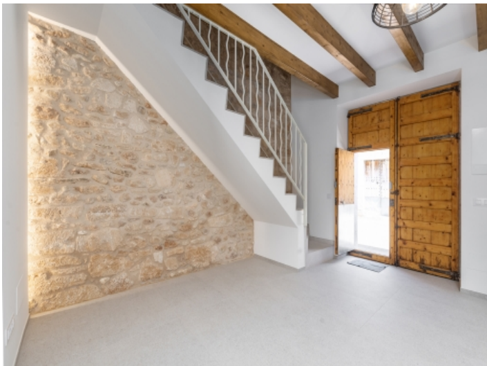
Spacious entrance and living area