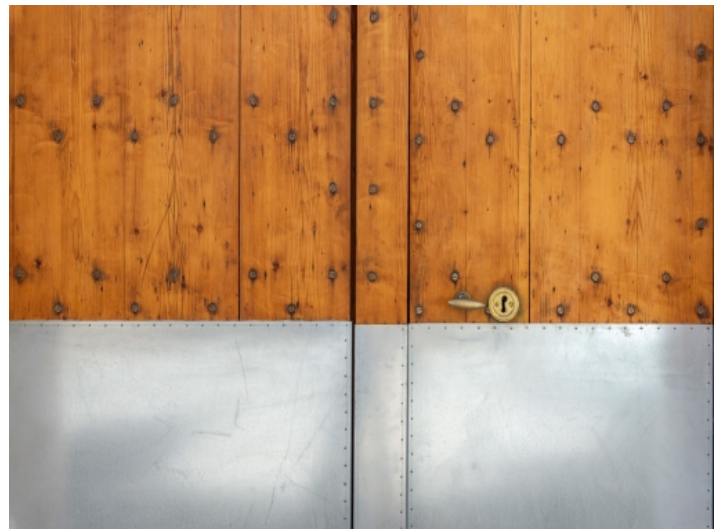
Authentic wooden front door