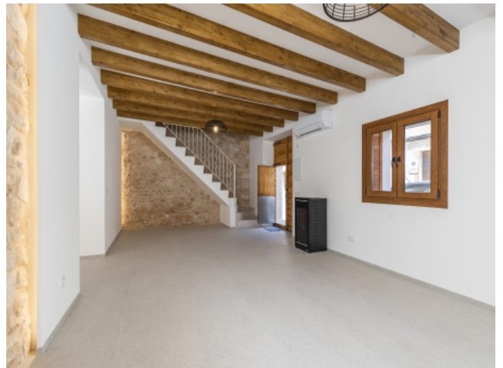
Open living and entrance area