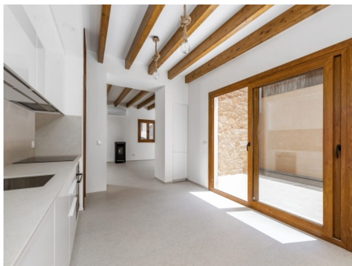
Bright kitchen area