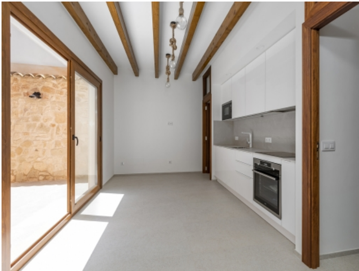
Direct access to the terrace