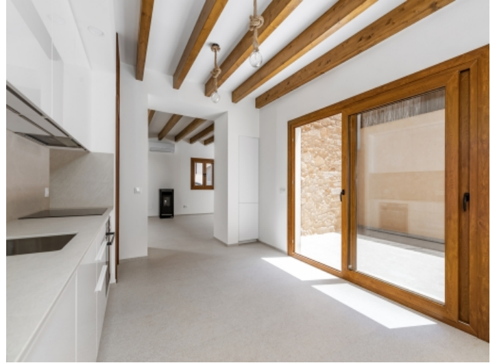
Bright kitchen area