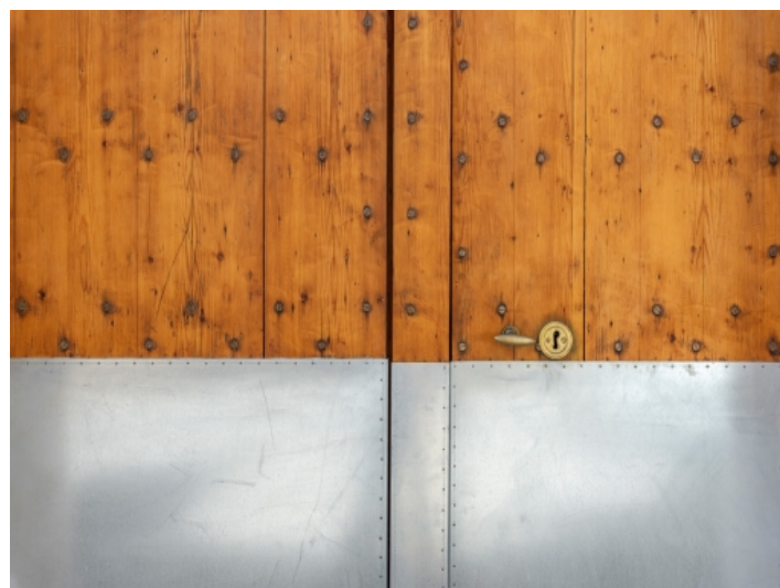
Authentic wooden front door