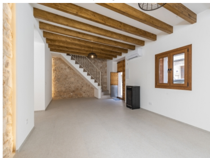
Open living and entrance area