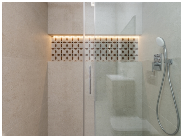
Beautifully designed kitchen