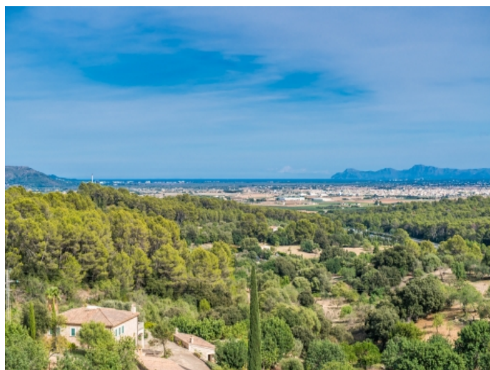
Spectacular panorama views to the bay of Alcudia