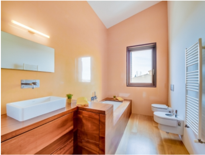
Modern bathroom with bathtub