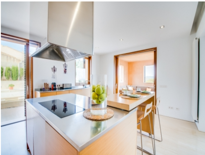
Cooking island and dining area