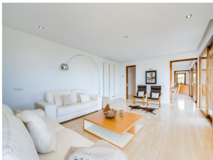
Living area with access to the dining area