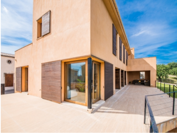
Terrace and outdoor area