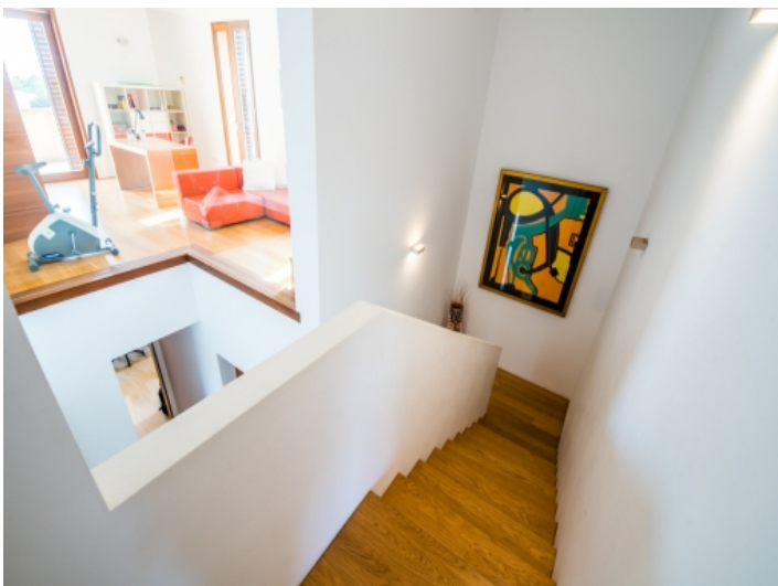
Elegant design of the house