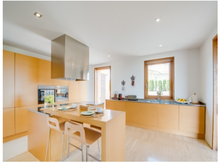
Modern kitchen with ample space