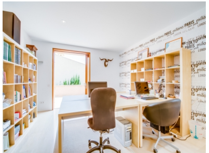
Office with terrace access