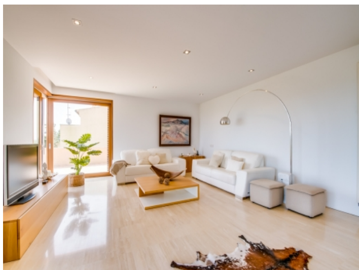
Lightflooded, spacious living area