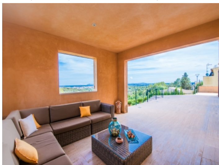
Covered lounge area