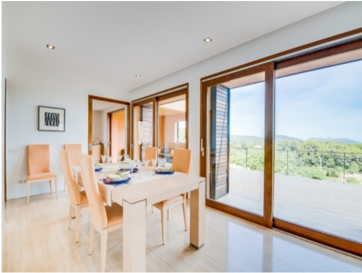
Dining area with direct terrace access