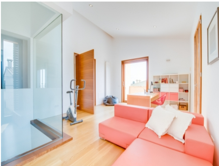
Room with glazed wall