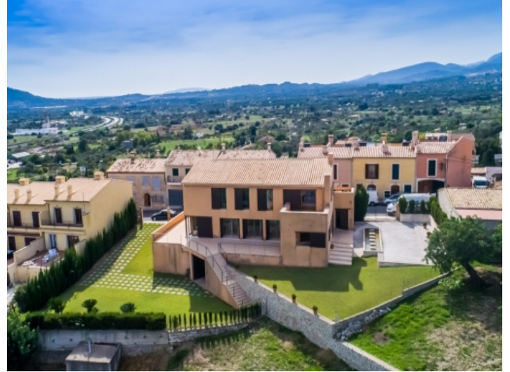
Bird's eye view of the house