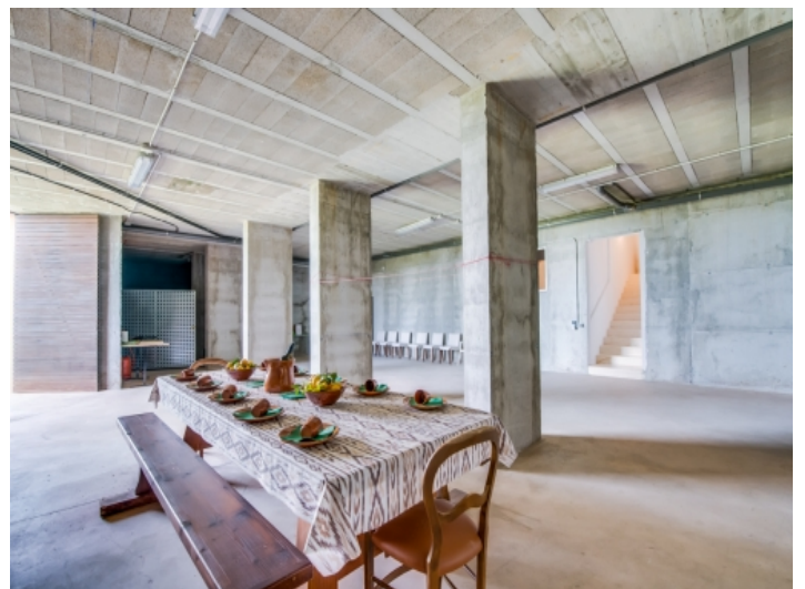
Large basement with many possibilities