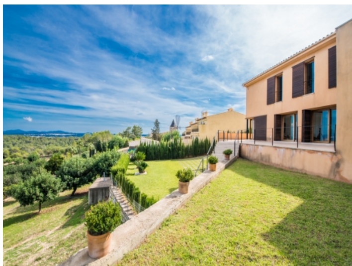
Large garden with a view