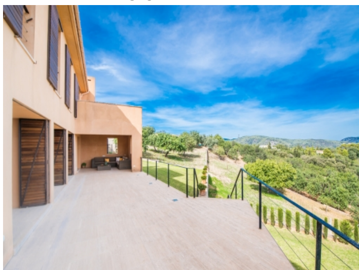
Large terrace with garden access