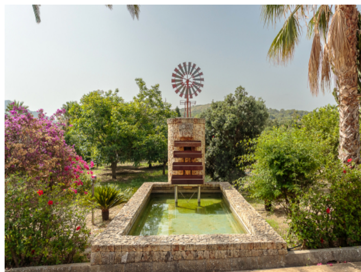
Mature garden and windmill