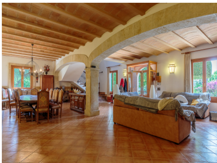
Bright living and dining area