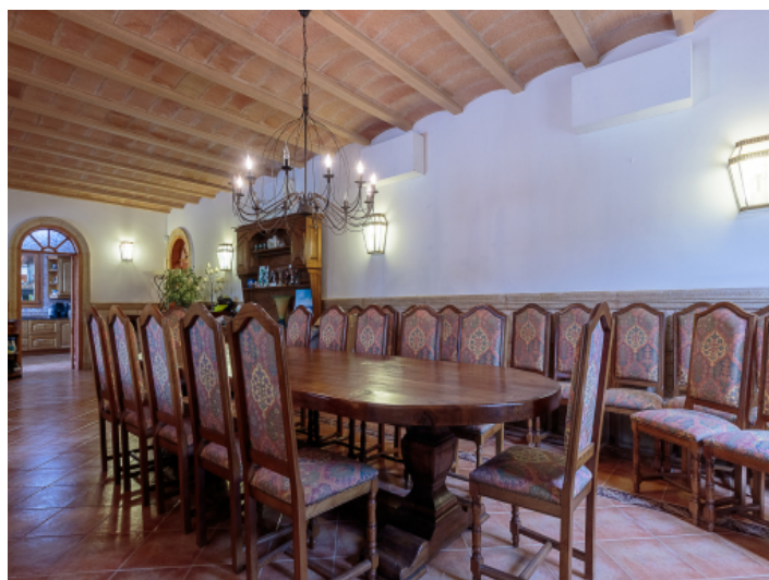
Very spacious dining area