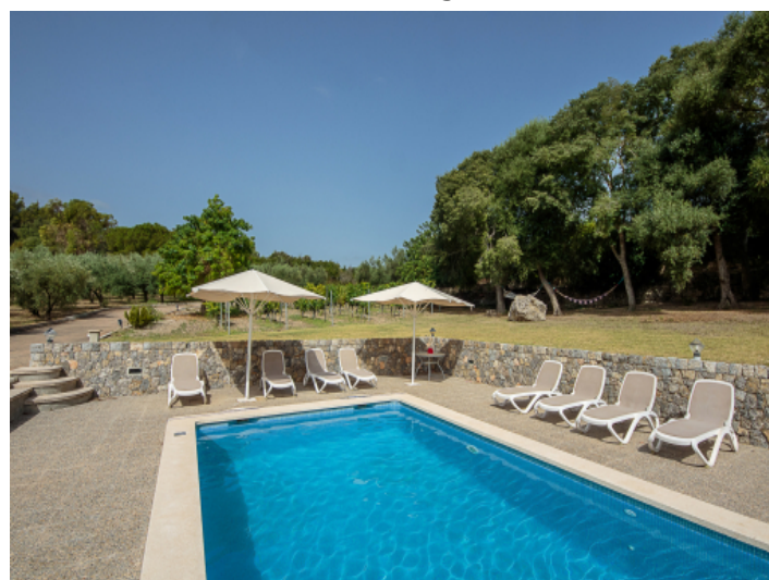
Pool surrounded by well-kept garden