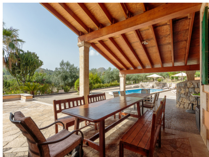
Outdoor dining area