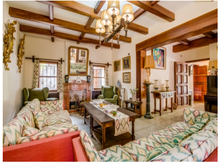
Further living area with wooden ceiling beams