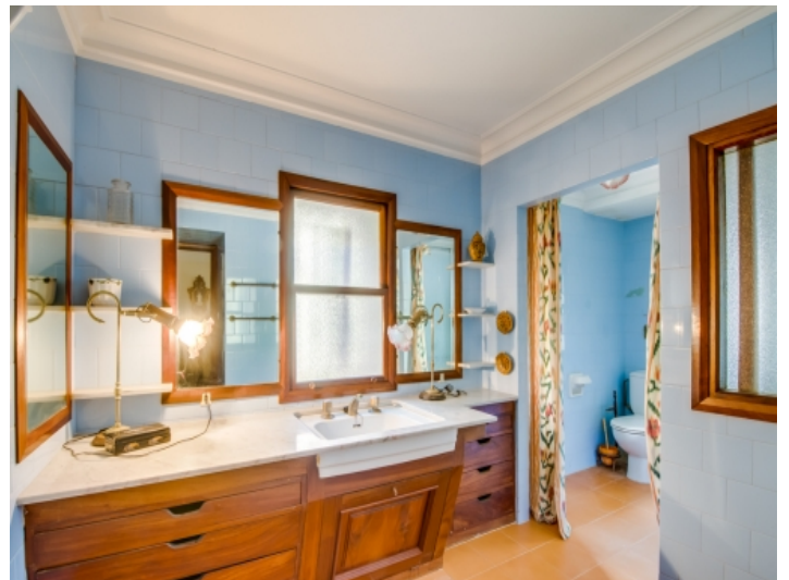
One of in total 9 bathrooms