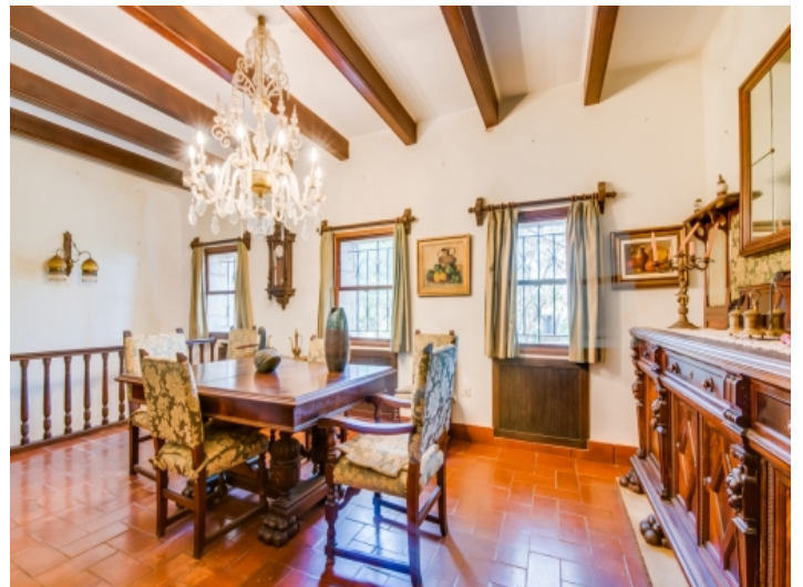
Rustic dining area on the upper floor