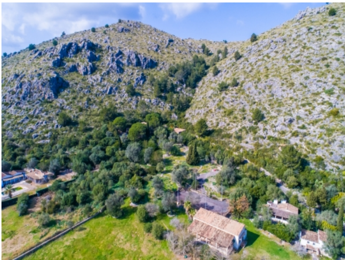
Property with tennis court from above