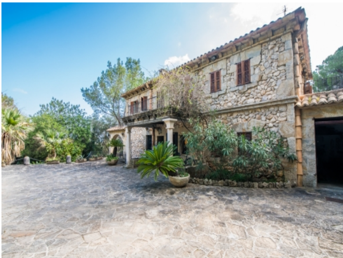
Front view of the main house with stone facade