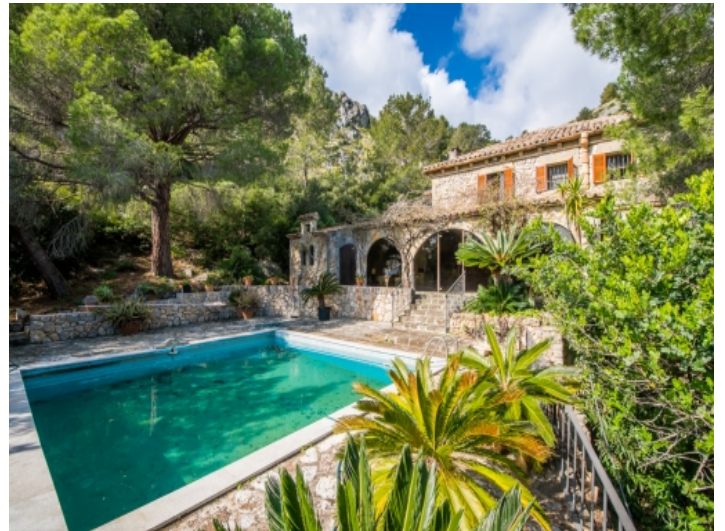
Pool area in the middle of nature