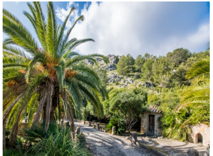
Mediterranean green plot