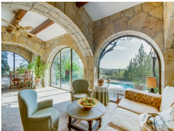
Lightflooded wintergarden with a view