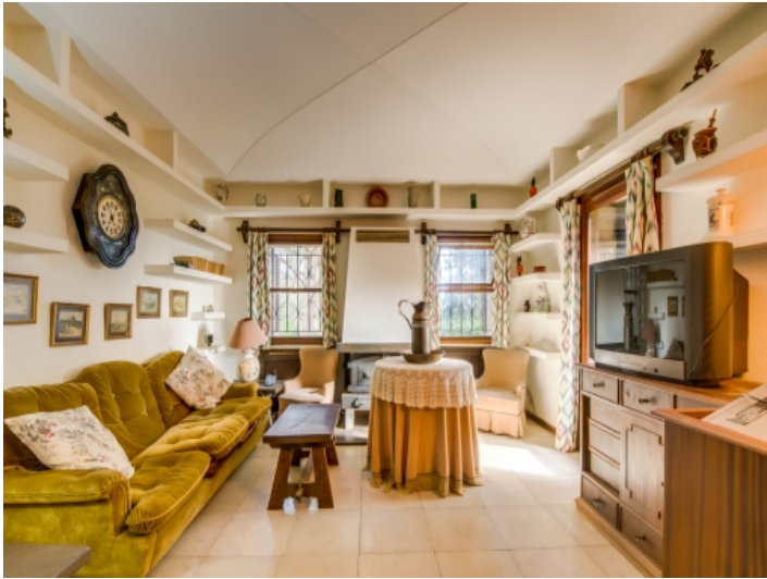
Rustic living area with terrace access