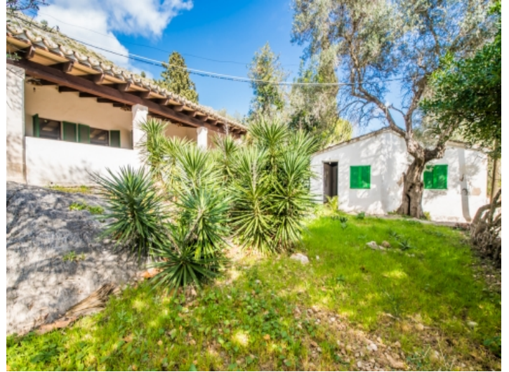
View of the guest houses