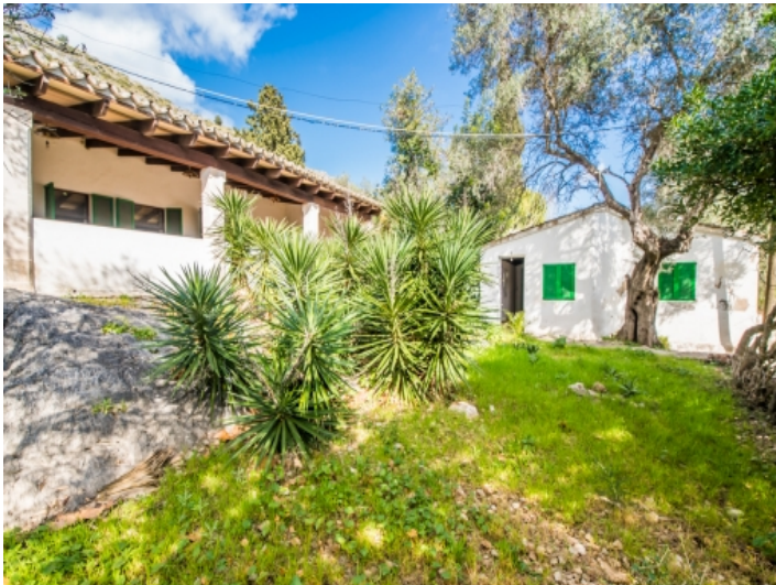
View of the guest houses