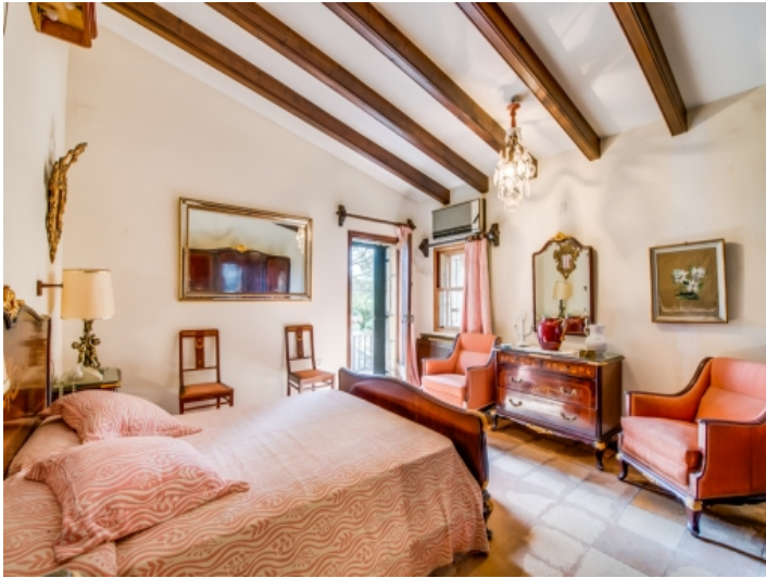
One of in total 11 bedrooms