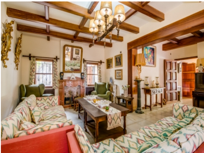
Further living area with wooden ceiling beams