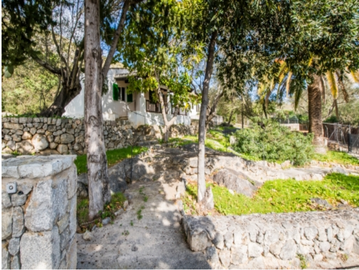
Access to a guest house