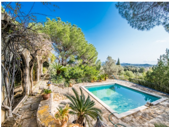
Pool area in absolute privacy with distant views