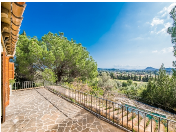
Stunning panoramic views from the terrace