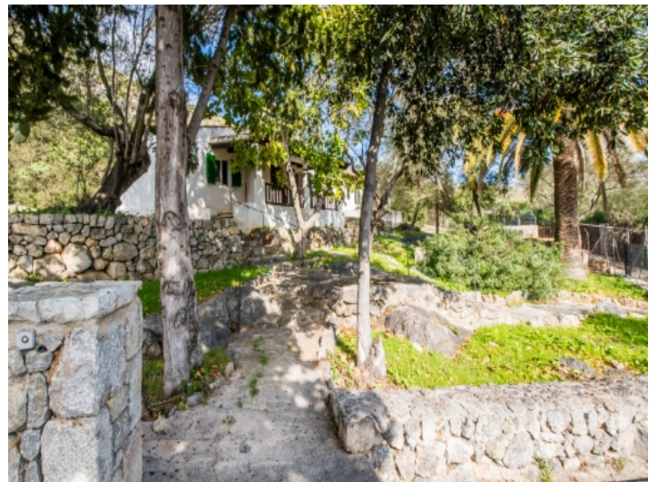
Access to a guest house