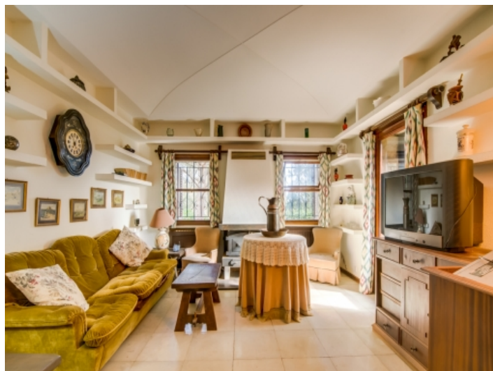
Rustic living area with terrace access

PORTA MALLORQUINA • C./ COLOM 20 2º, 07001 PALMA, SPAIN