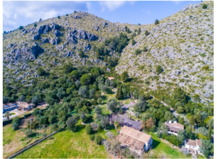
Property with tennis court from above