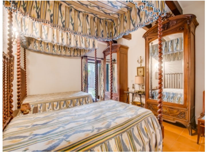
One of in total 11 bedrooms