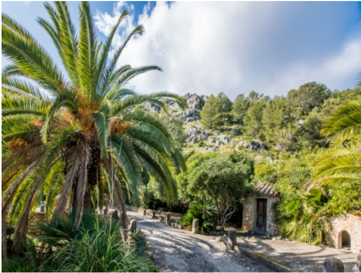
Mediterranean green plot