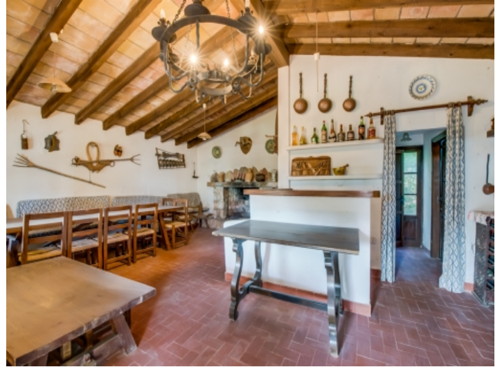
Rustic bbq house with wooden beams