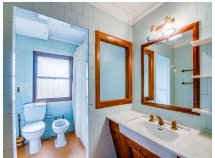
One of in total 9 bathrooms