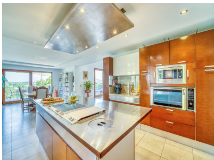
Kitchen with dining area