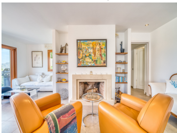
Additional living room