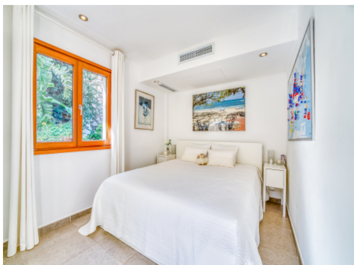
Bedroom on the upper floor