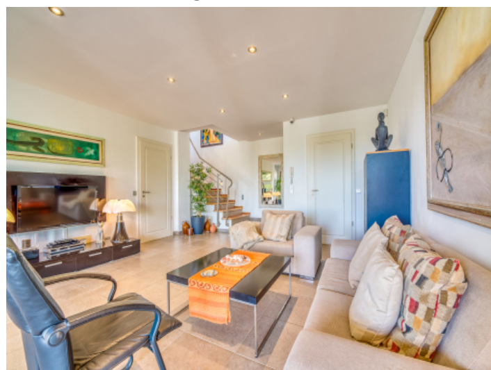
Lounge on the lower level