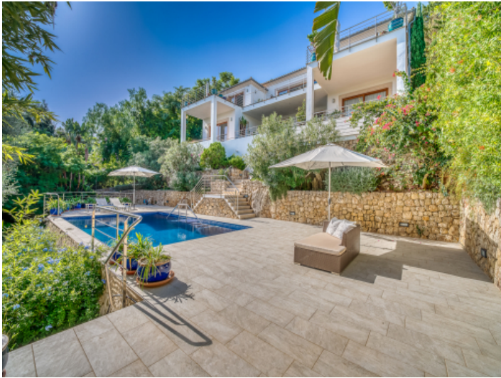
Impressive villa with views and pool in Pollença