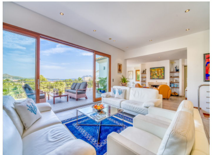
Upper floor with beautiful views