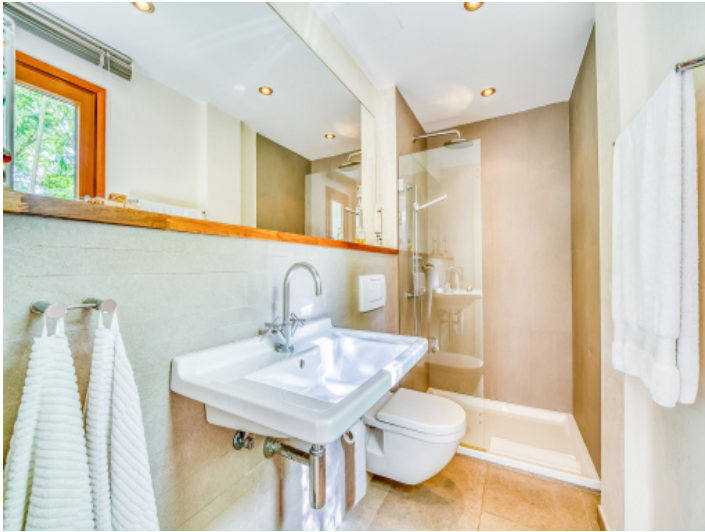
Bathroom on the upper floor