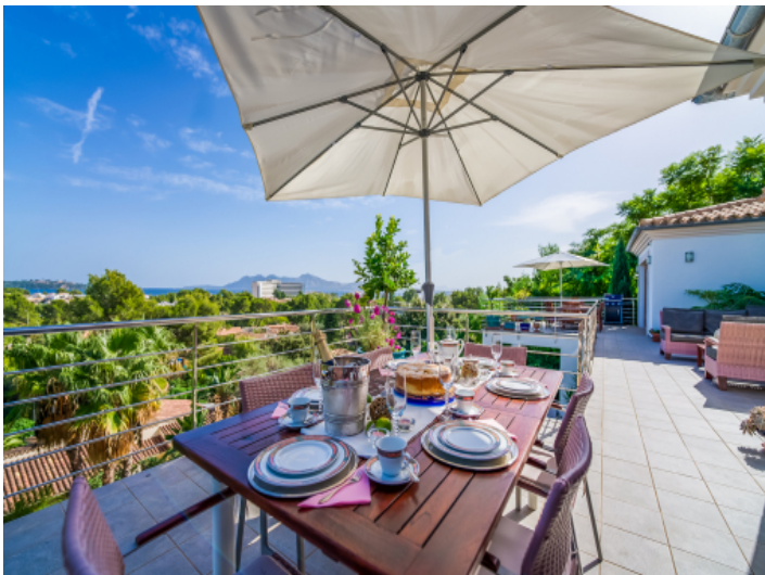
Terrace on the upper floor