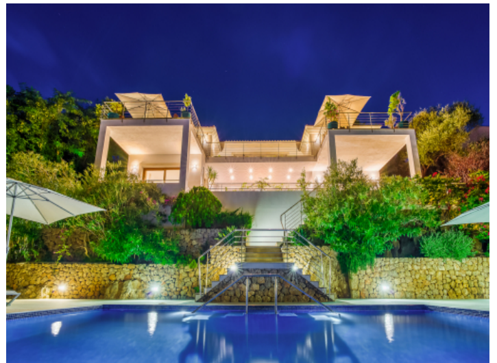
Spectacular view by night