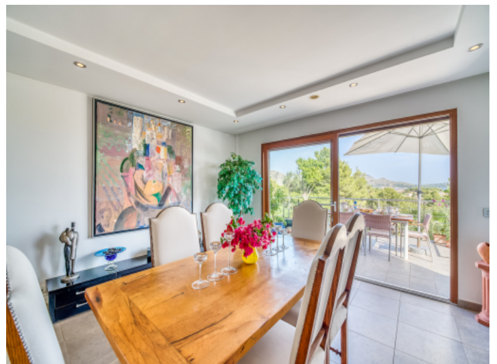
Dining area with access to the terrace