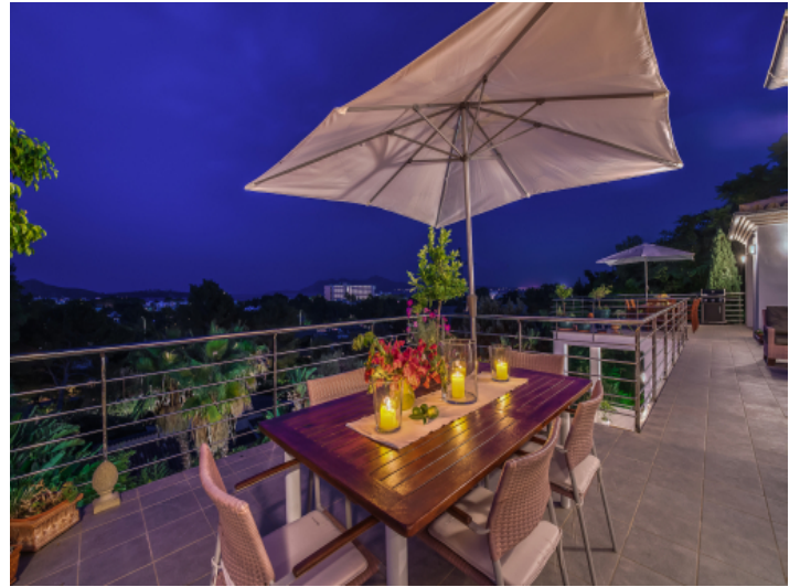
Outdoor dining area at night