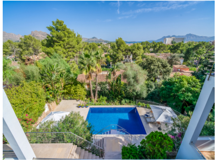
View at the pool