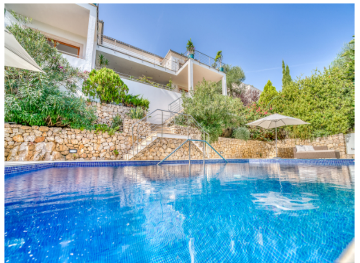
Elegant outdoor area