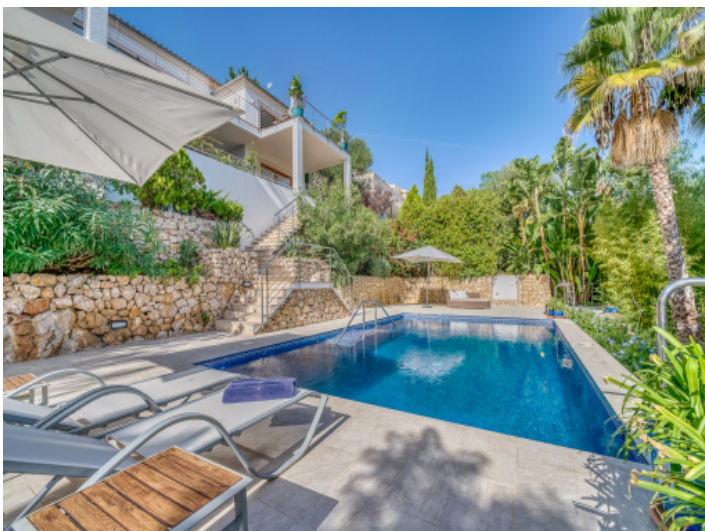
Superb pool area