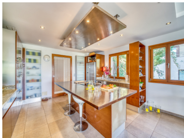
Elegant fitted kitchen