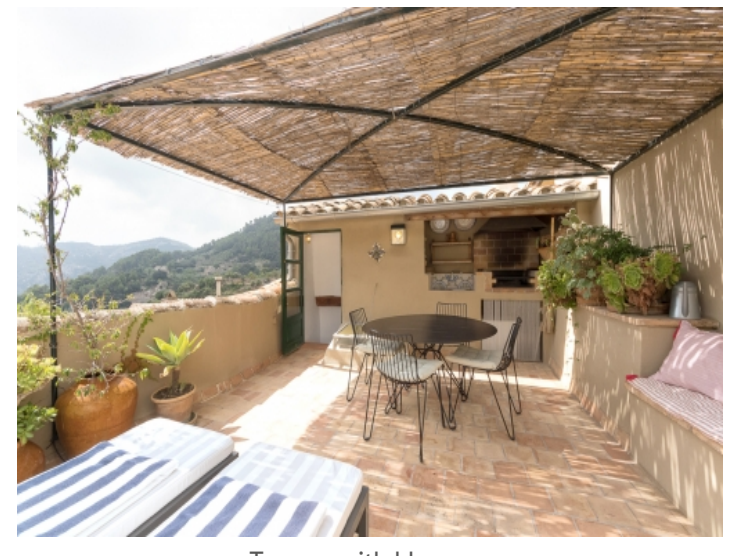
Terrace with bbq area