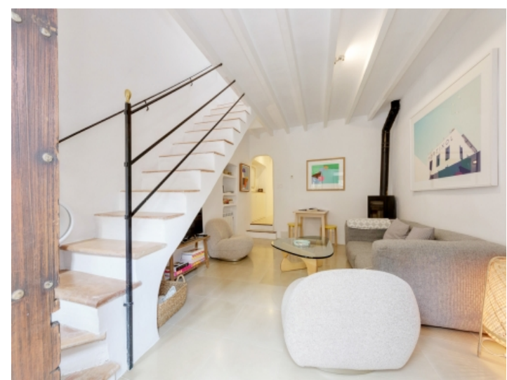
Beautifully renovated living area