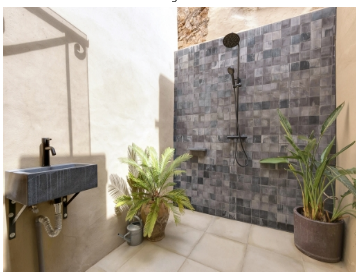
Beautiful outdoor bathroom