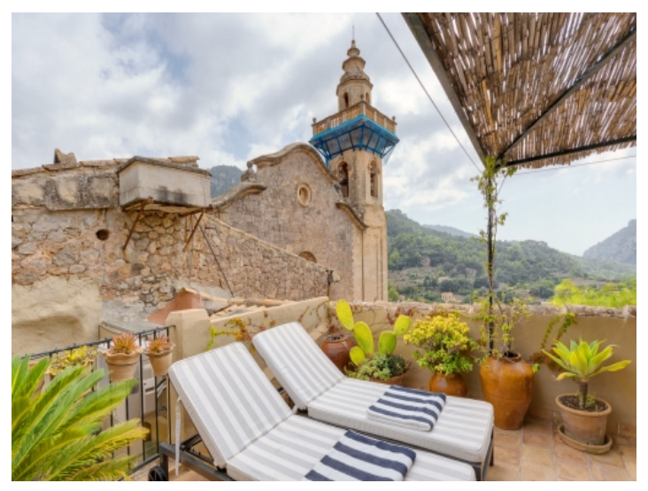
Terrace with views of the church