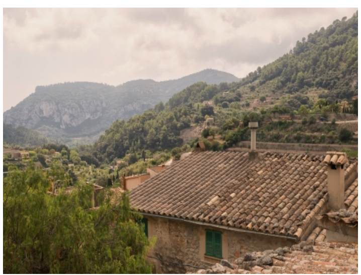
Beautiful mountain views