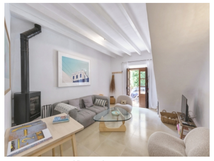
View to the entrance