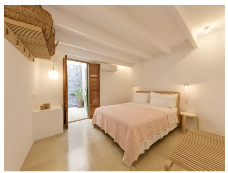
Bedroom with outdoor bathroom