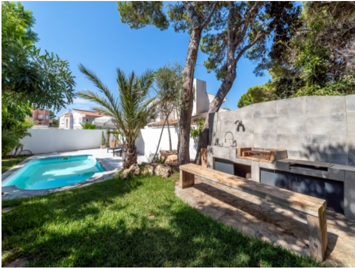
Fantastic outdoor kitchen and pool