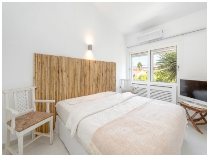
Second double bedroom