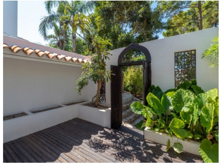
Access to the garden