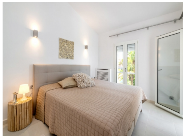
Large double bedroom