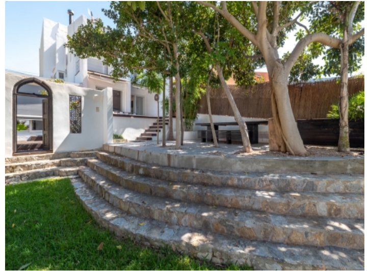
Exterior view of the house