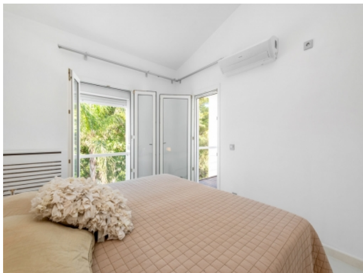
Large double bedroom