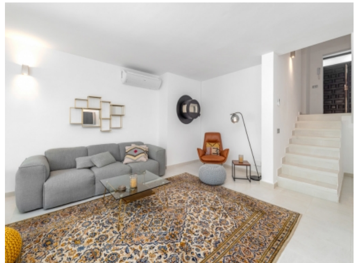
Alternative view of the living area