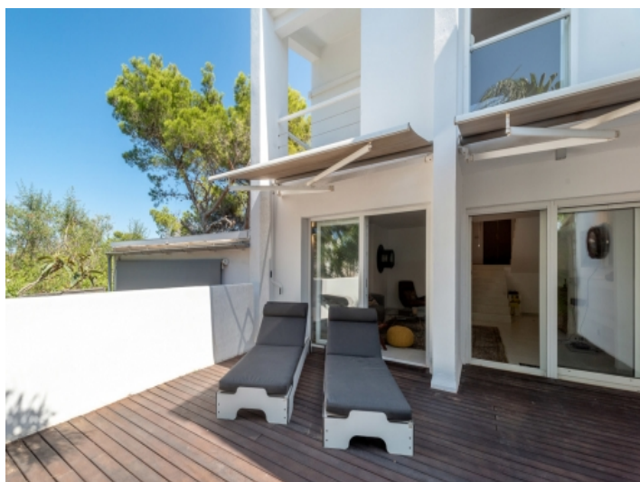
Terrace with sun loungers