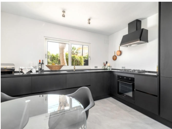
Modern kitchen in black