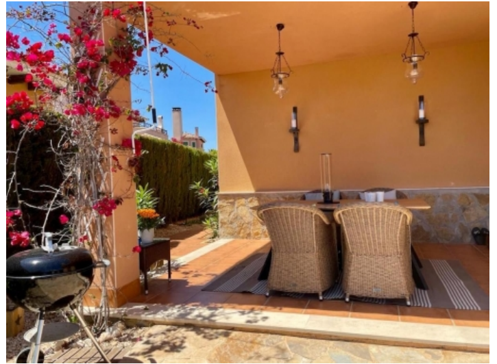
Covered dining area