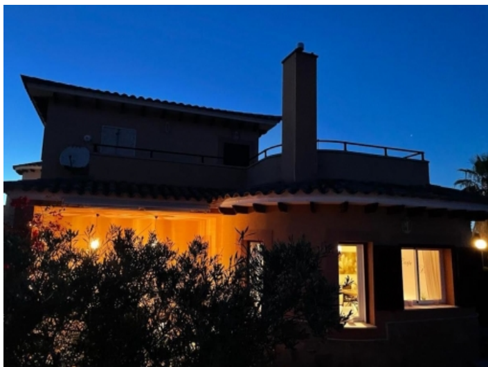
The villa by night