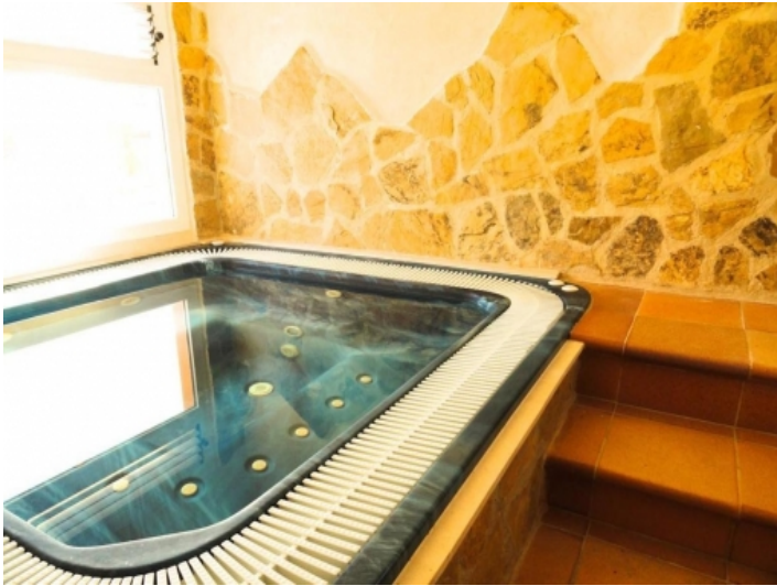
Spa area with jacuzzi