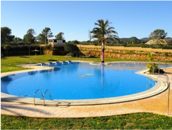
Inviting pool area