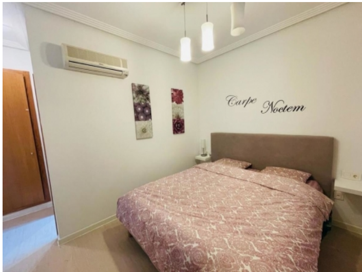
View of the double bedroom