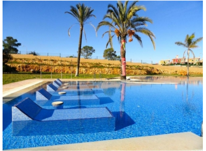
Sun loungers in the pool