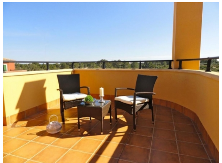
Balcony with sitting area