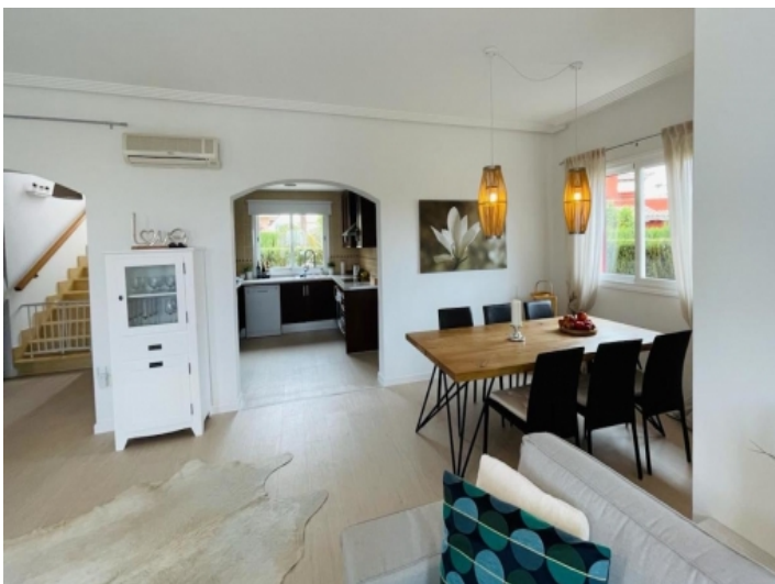
Access to the kitchen