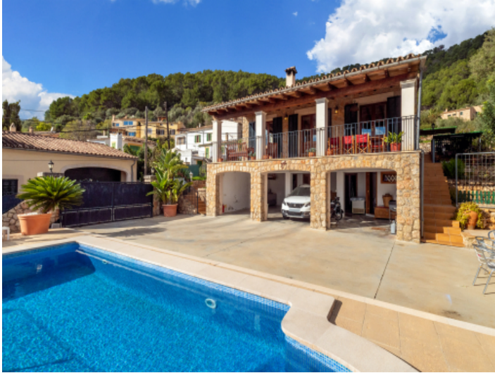
Pool area and terrace