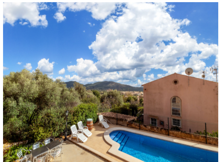
View to the pool area