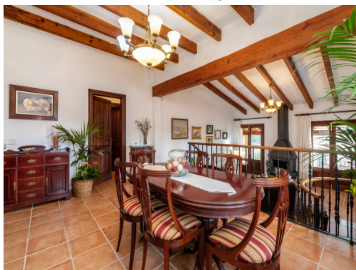
Adjoining, gallery-like dining area