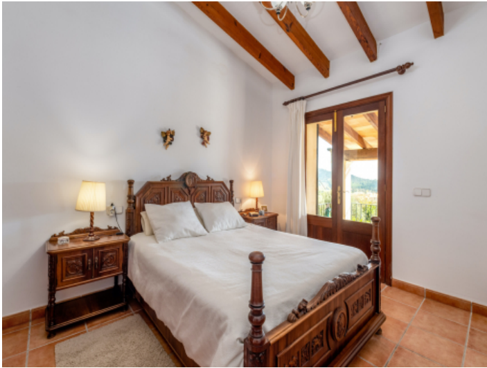
Double bedroom with terrace access