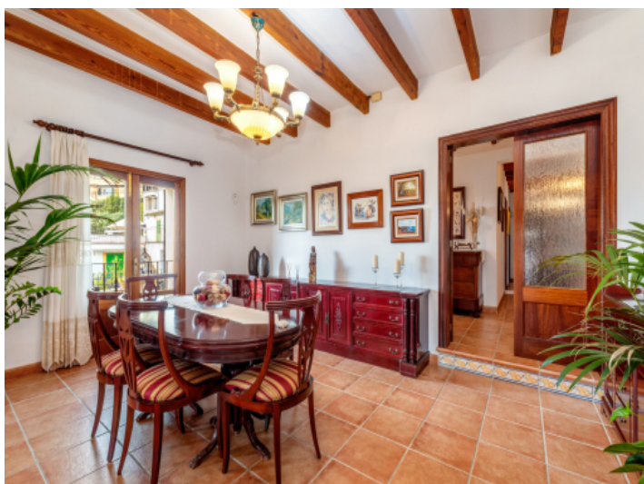
Access to the corridor