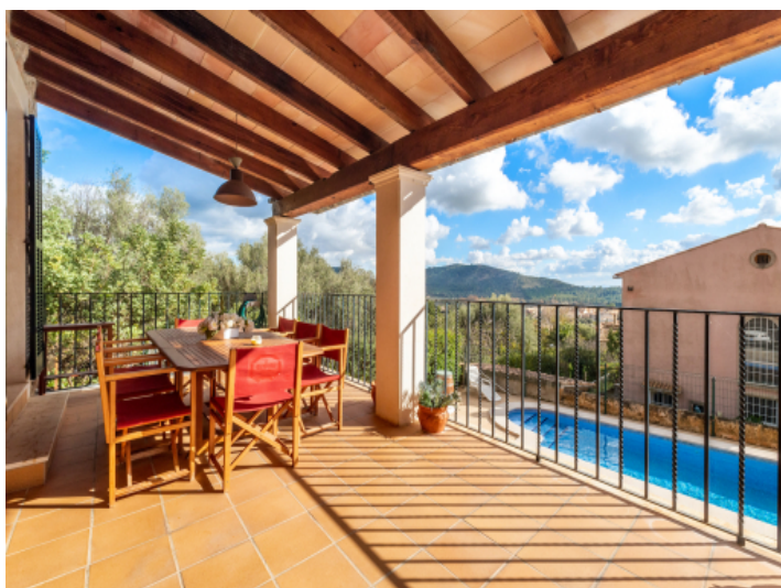
Upper terrace with view to the pool