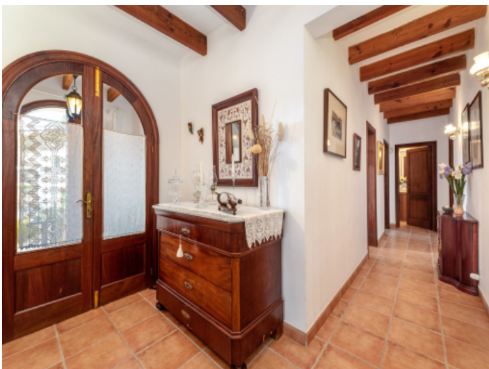
Entrance area and corridor