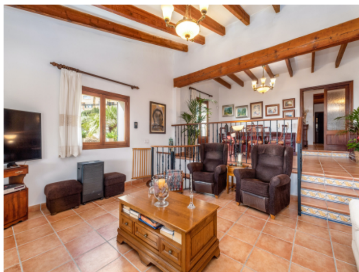
Modern, open living area