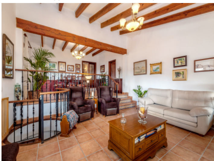
Comfortable living area with wooden ceiling beams