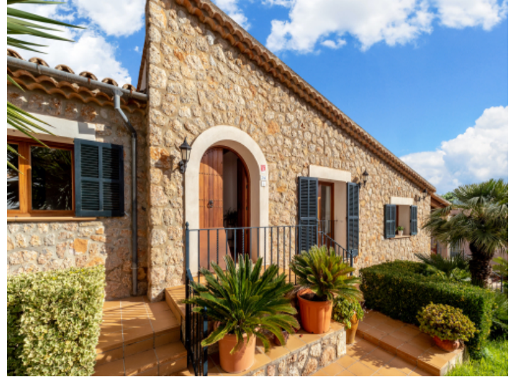
Access to the house