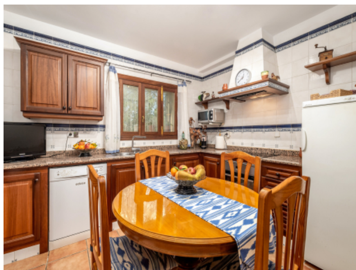
Country house kitchen with dining area