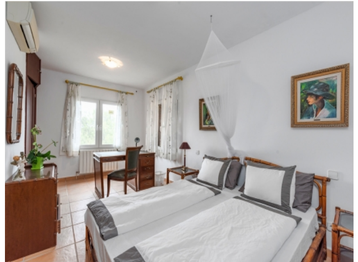
Second double bedroom