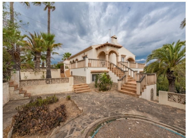
Exterior view of the sea view villa