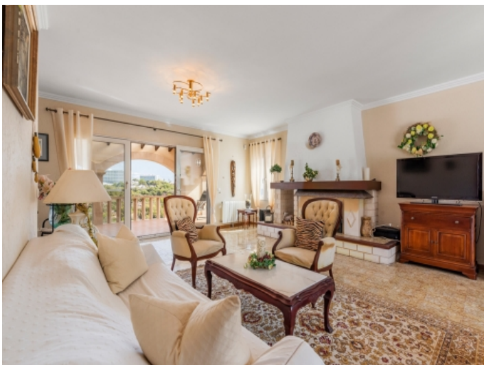
Cozy living area