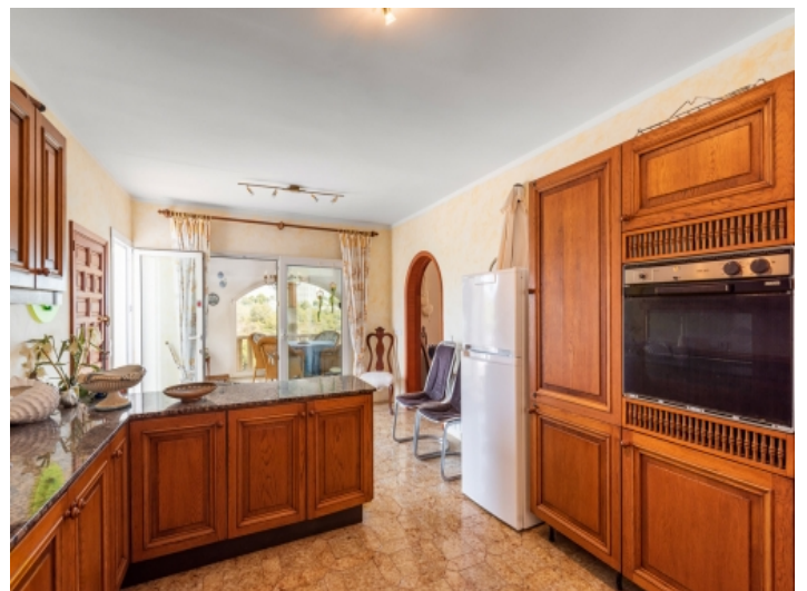
Rustic, wooden kitchen