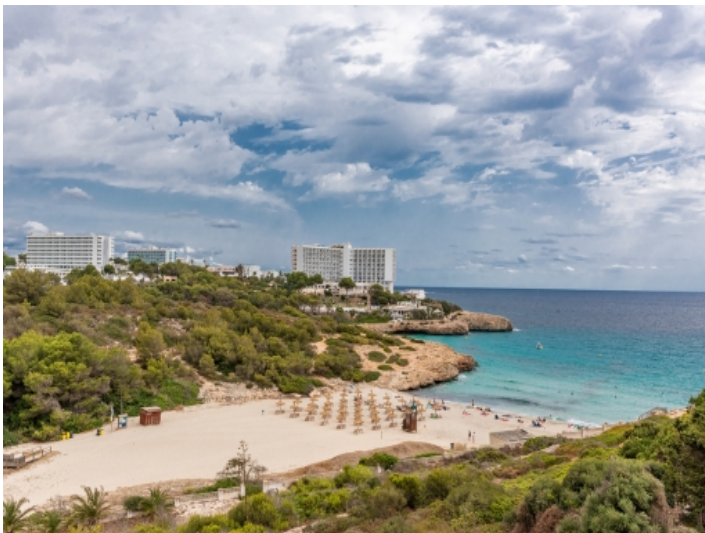
View to the Cala Murada