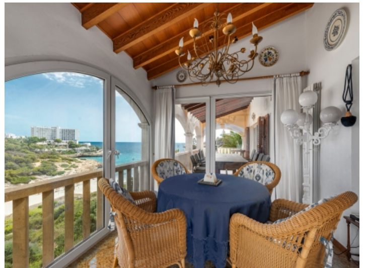
Separate dining areas on the balcony