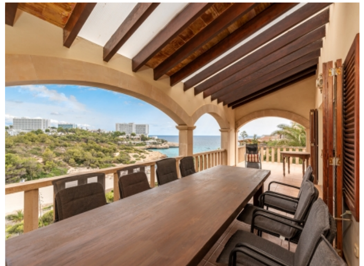
Dining area on the balcony