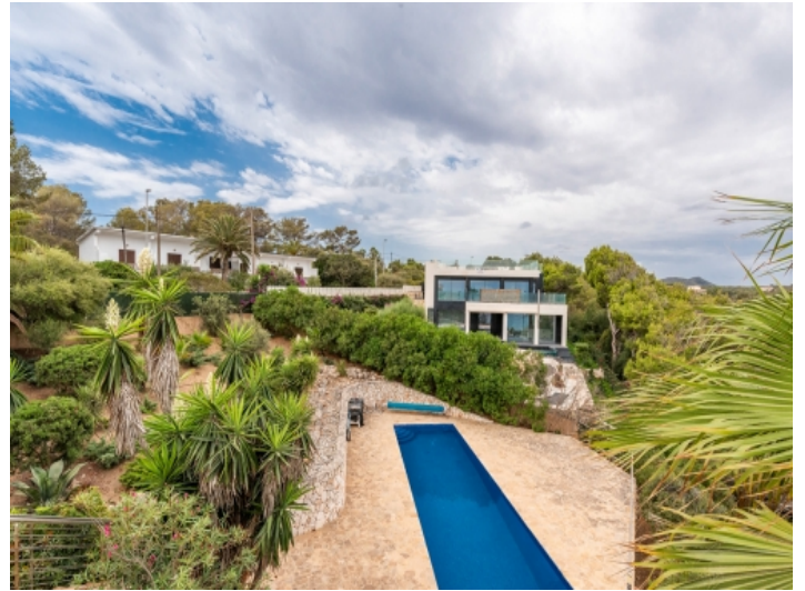
View of the pool area