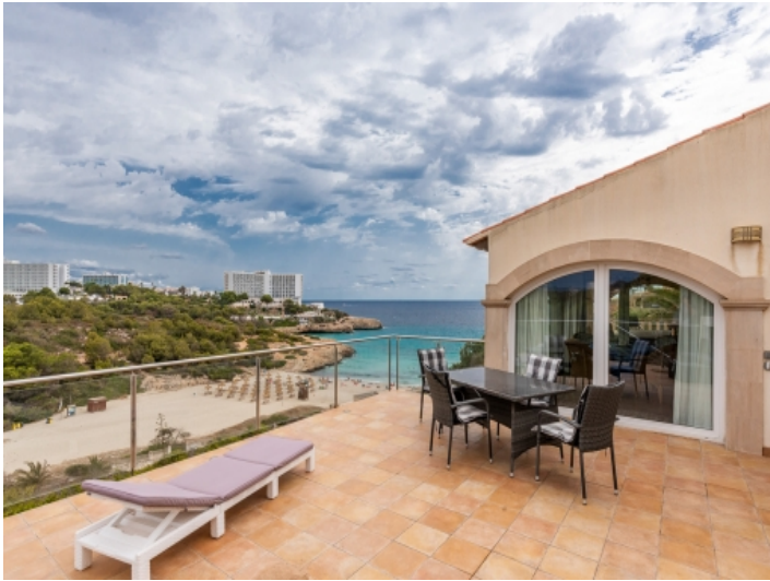
Terrace with a view