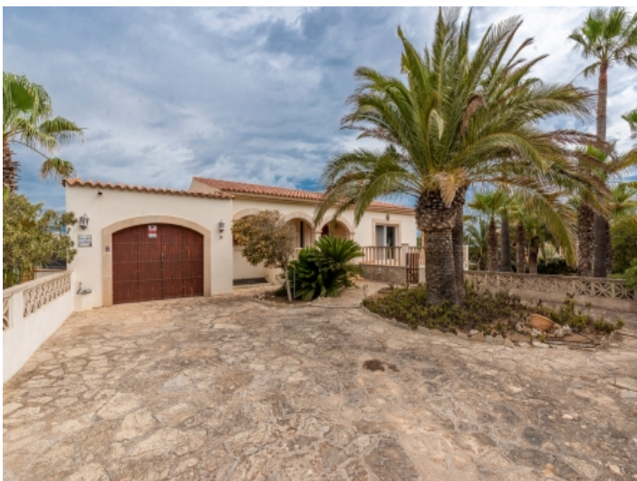
Garage and entrance area