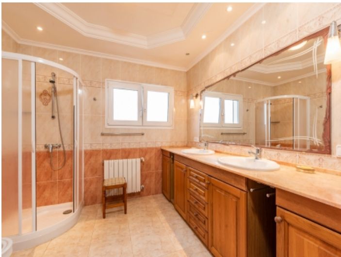
Large bathroom with shower