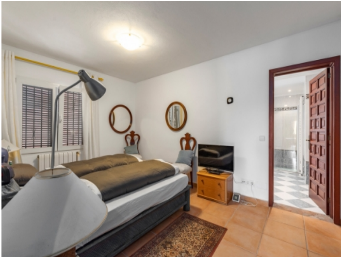
Master bedroom with bathroom en suite