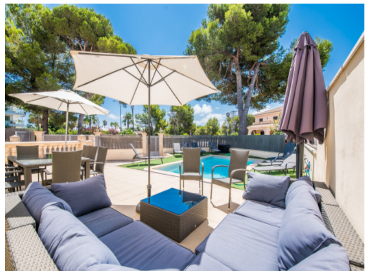
Lounge area at the pool