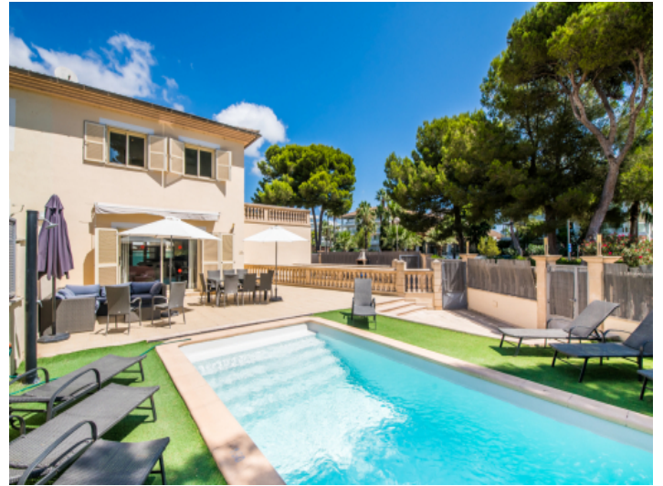
Lovely pool area