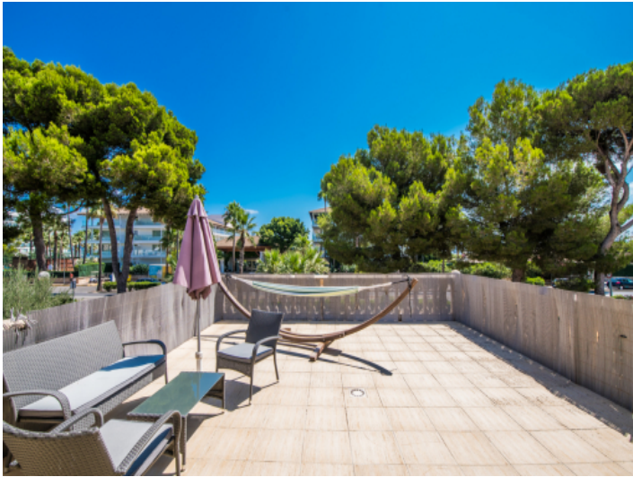
Sunny roof terrace