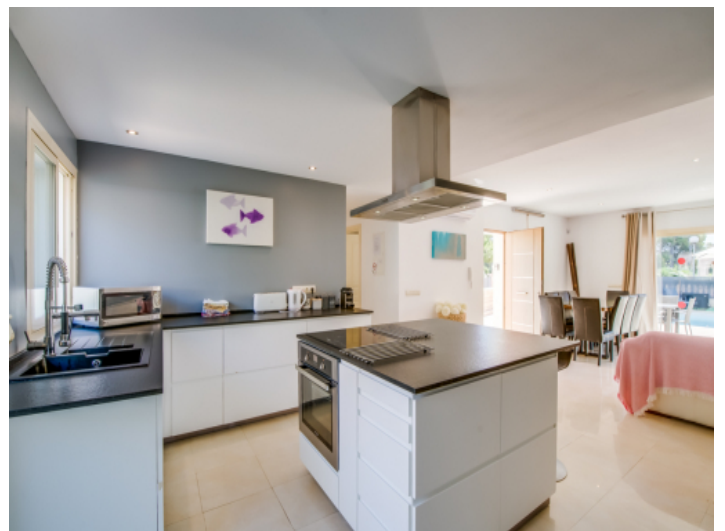
Modern kitchen with island