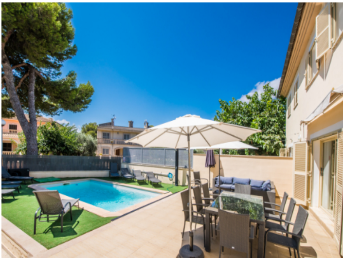
Outdoor dining area next to the pool