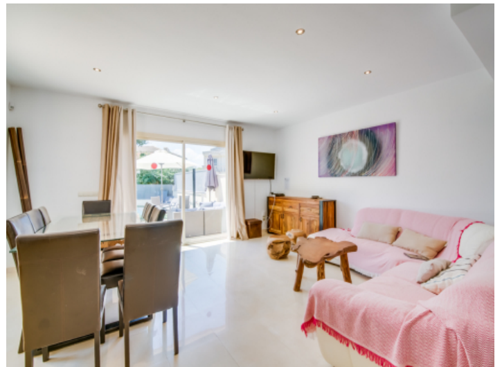
Living and dining area with terrace access