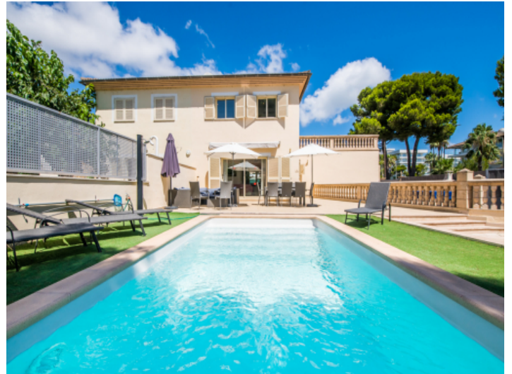
Exterior view and pool