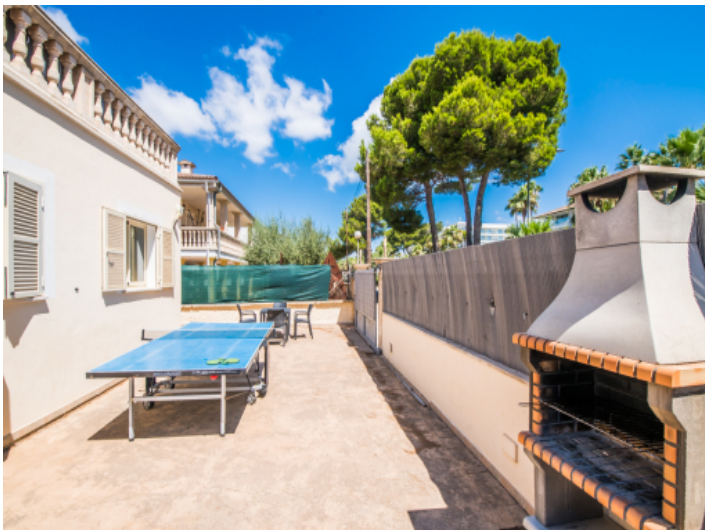
Further terrace with bbq