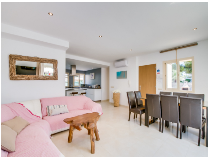
View to the open kitchen