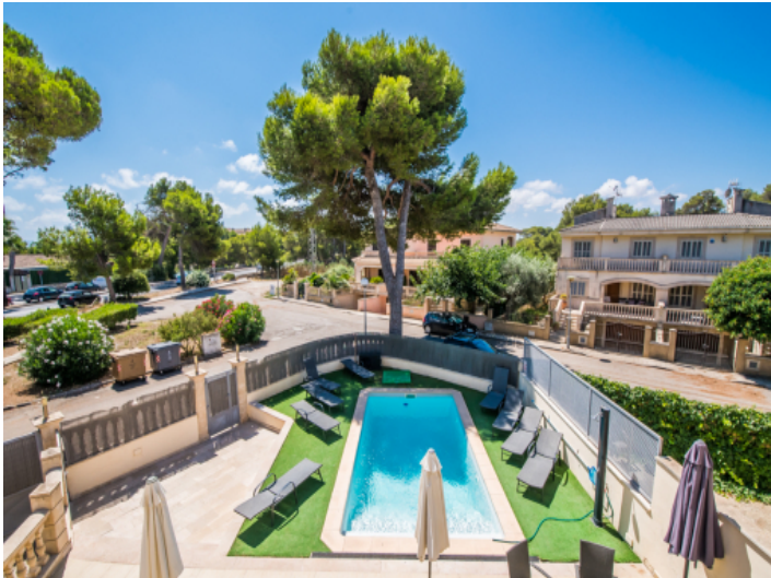
View of the pool and outdoor area