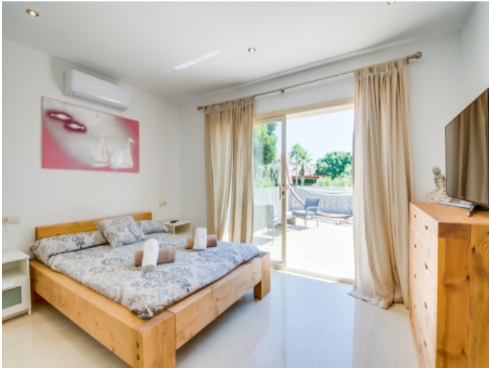
Double bedroom with terrace access