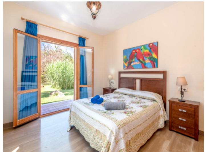
Double bedroom with garden access