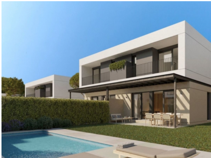
house, Puig de Ros