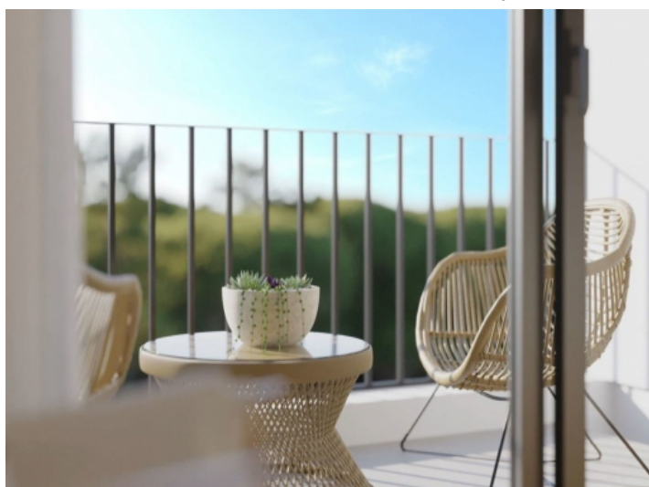
View to the balcony