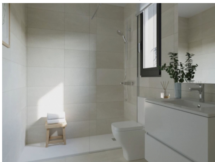
Elegant bathroom with walk-in shower