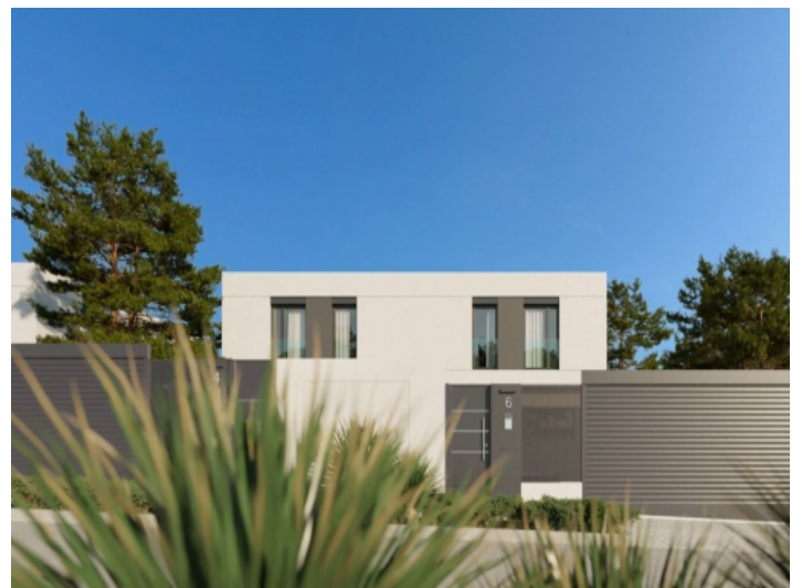
Exterior view of the house