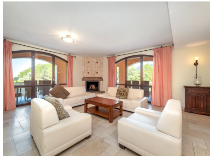
Large living area with fireplace