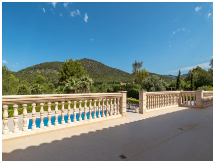
Large terrace with access to the pool