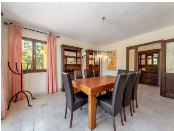
Open dining area