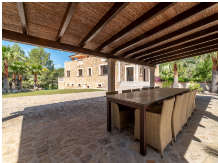
Covered outdoor dining area