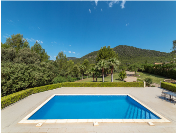
Pool in absolute privacy