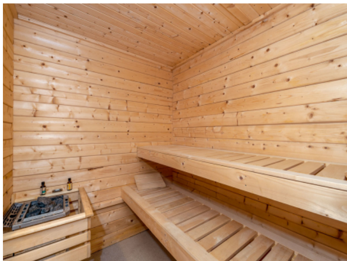
Own sauna and spa area