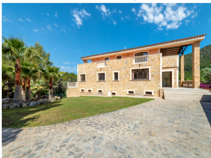
Exterior view and access