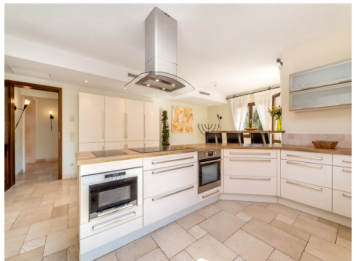
Spacious, modern kitchen