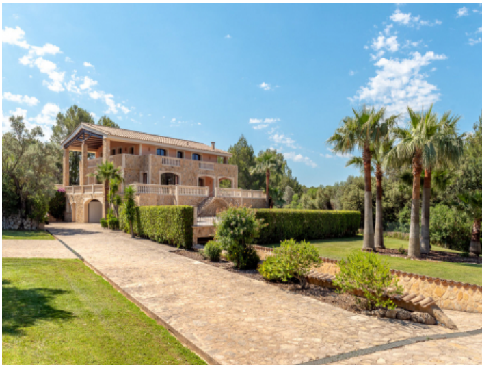
Driveway to the natural stone finca