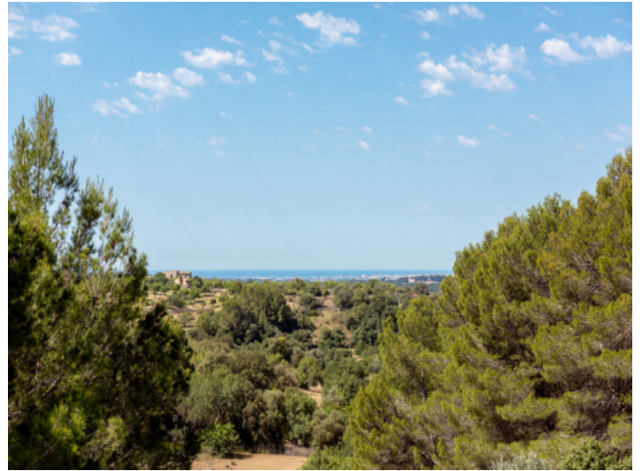
Wonderful panoramic views as far as the sea